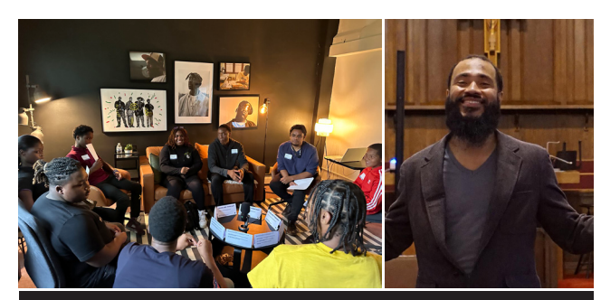
Photo 1 (left): Youth engagement roundtable with Scholars of Class Act Detroit at St. Cyprian's Episcopal Church.

The youth involvement in the neighborhood framework continues with the photo-sharing activity. See the description below for instructions: