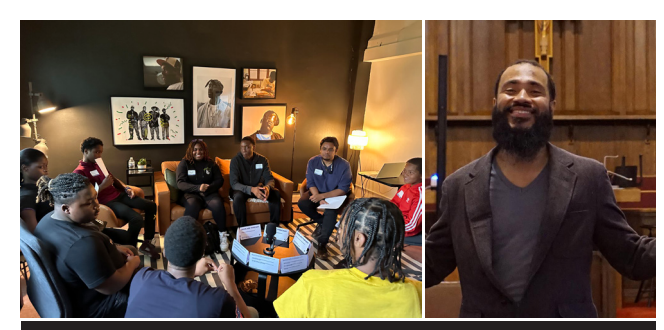
Photo 1 (left): Youth engagement roundtable with Scholars of Class Act Detroit at St. Cyprian's Episcopal Church.

The youth involvement in the neighborhood framework continues with the photo-sharing activity. See the description below for instructions: