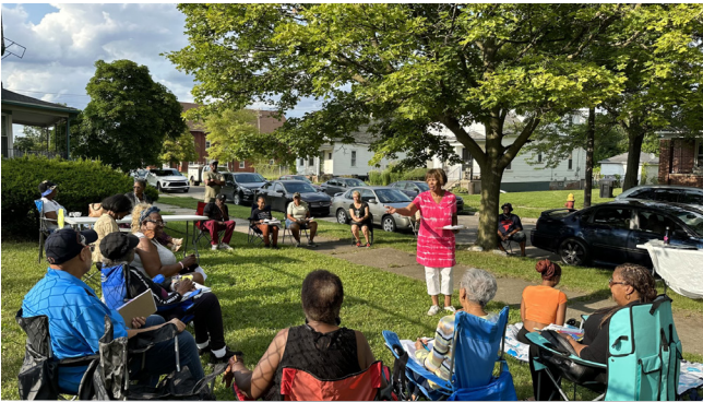
Photo of the United Block Club Council Meeting