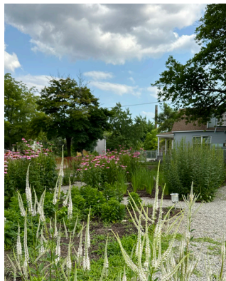
Photos of LaNita's Memorial Garden Park