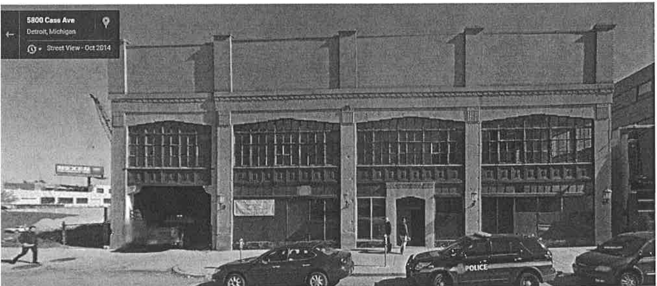
5800 Cass (October 2014)