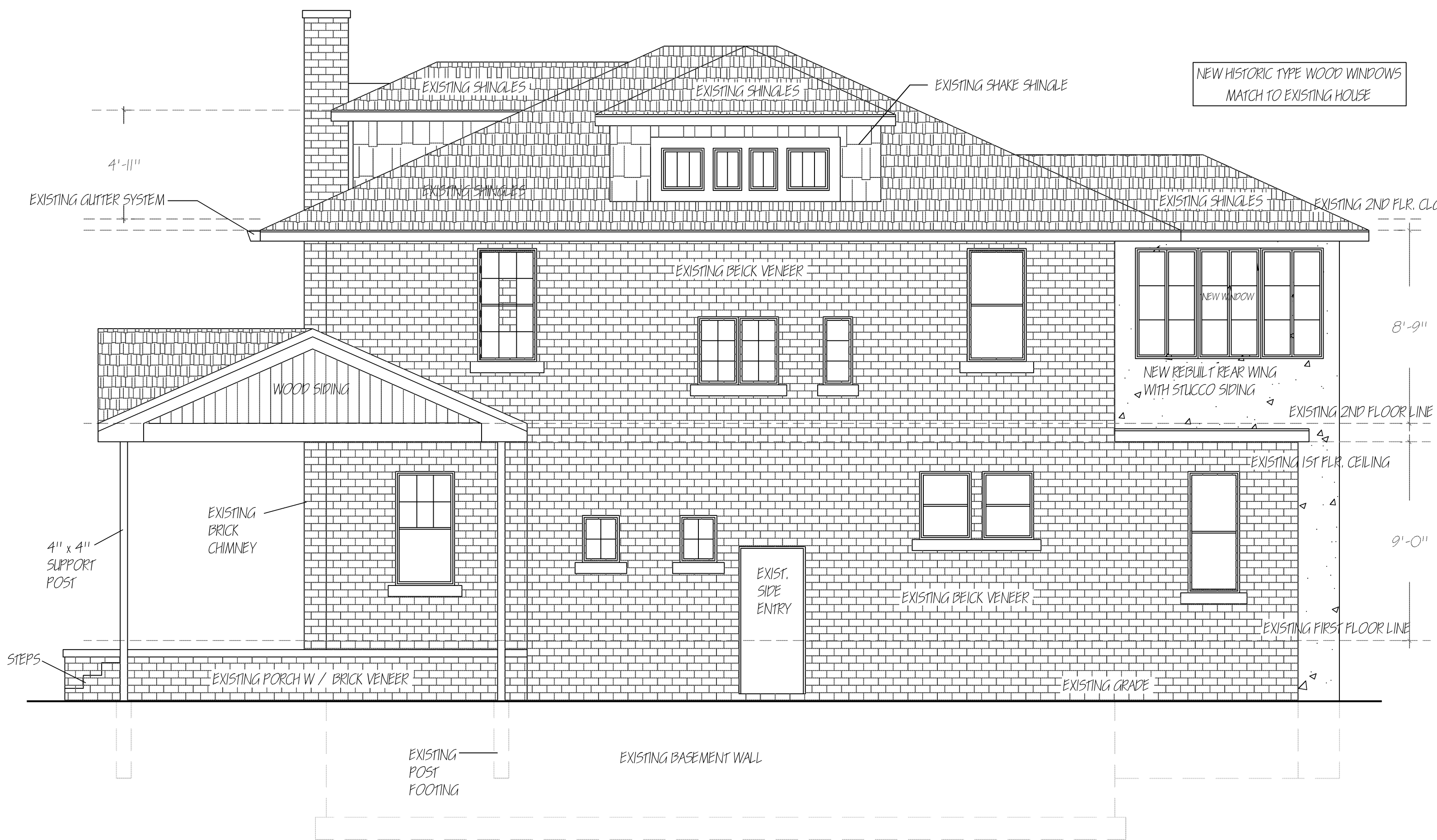
EXISTING RIGHT SIDE ELEVATION SCALE 1/4" = 1'-0"

ALL EXISTING WINDOWS ARE SHOWN WITH EXACT DETAIL