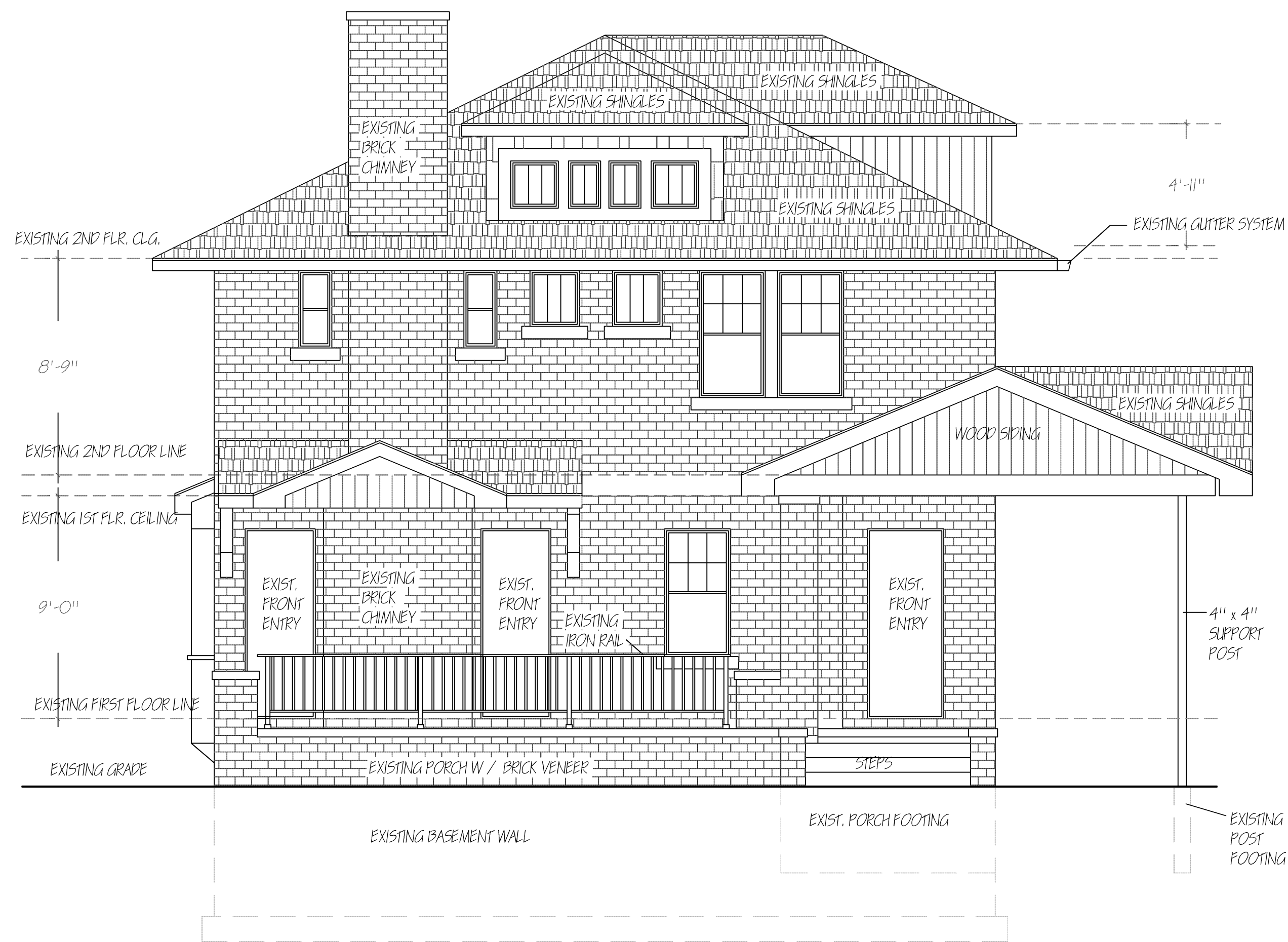
EXISTING FRONT ELEVATION SCALE 1/4" = 1'-0"