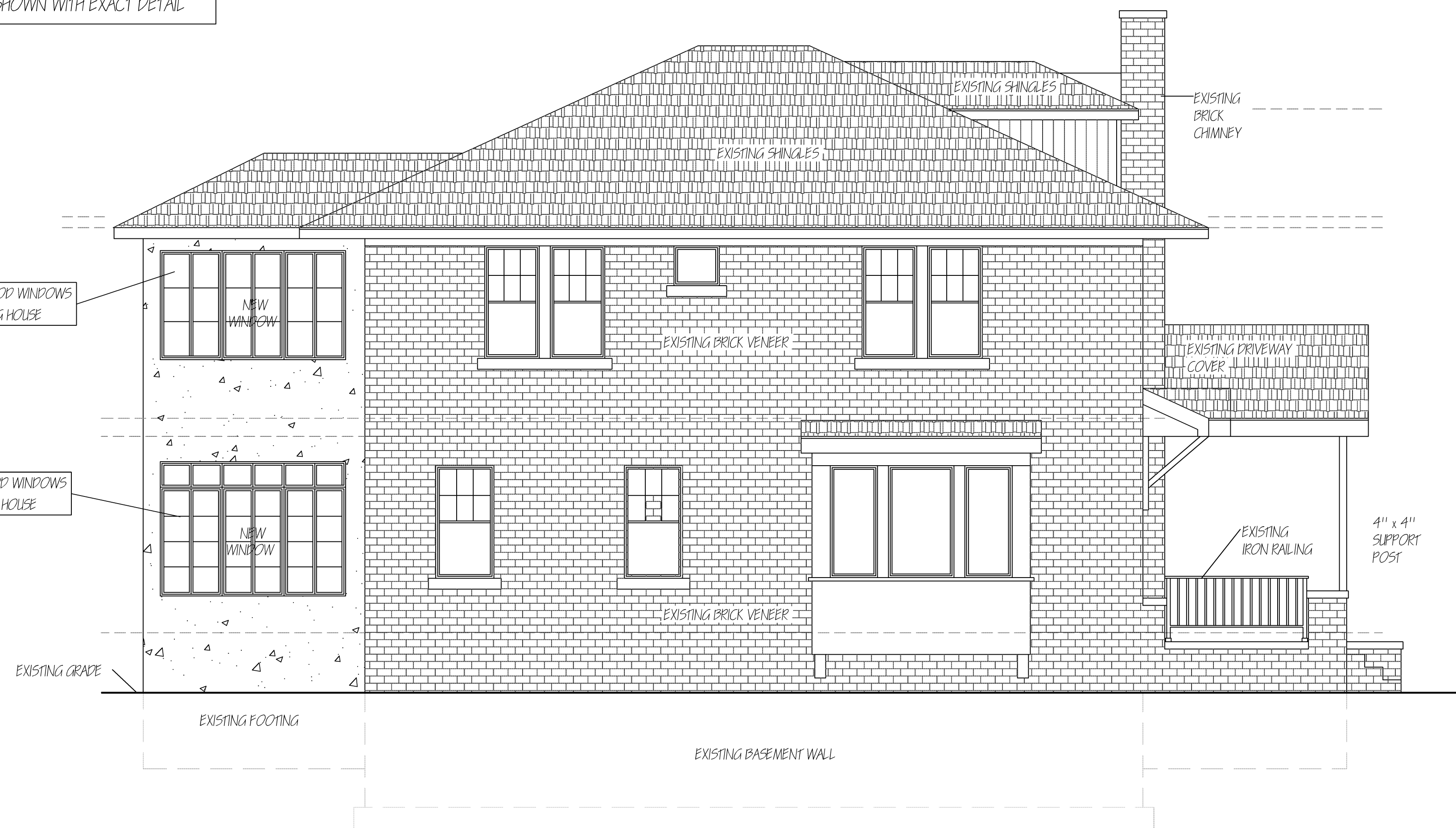
EXISTING LEFT SIDE ELEVATION SCALE 1/4" = 1'-0"

EXISTING 2 / 2 STORY BRICK HOUSE ON BASEMENT EVARDO LEE MORALES 1616 W. CHICAGO BLVD. DETROIT, MI 48206