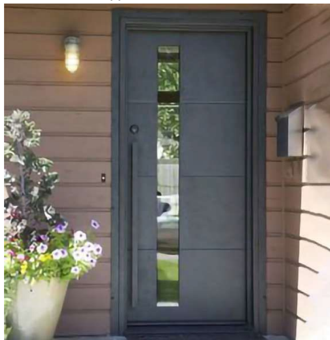
Upper Front Door