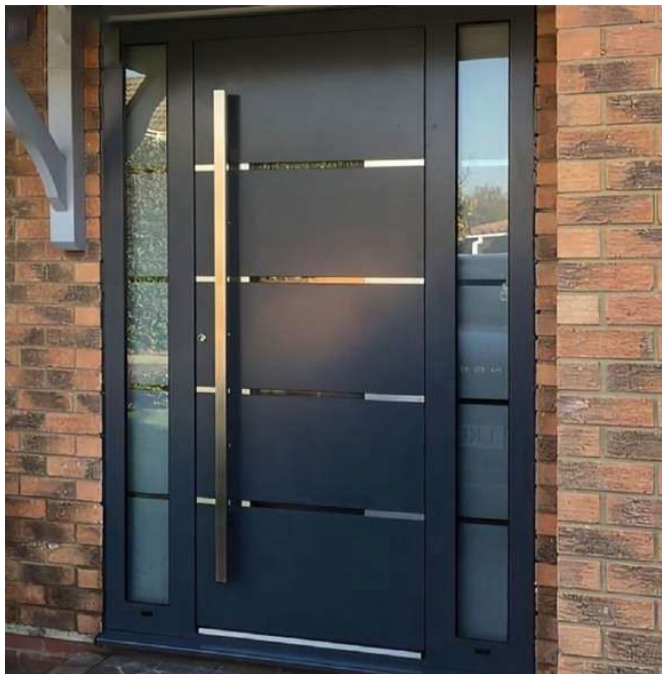
Lower Front Door (Main Entrance)