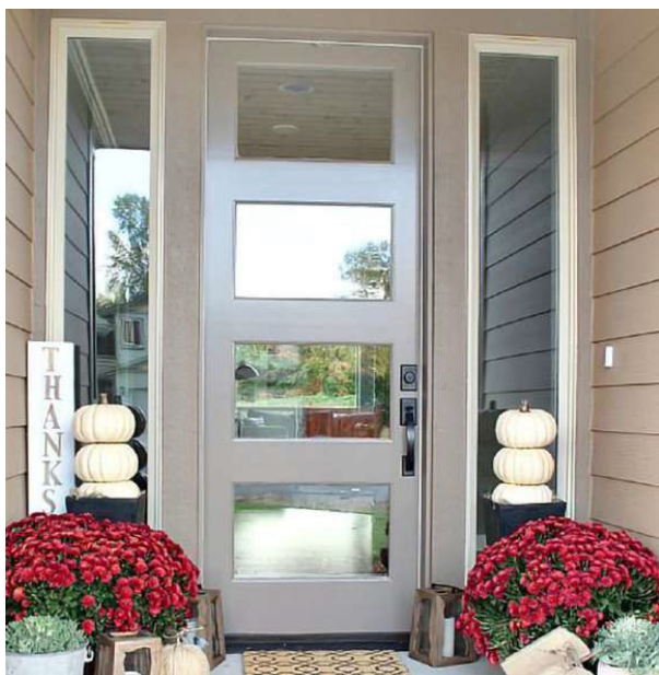
Upper Rear Door (black)