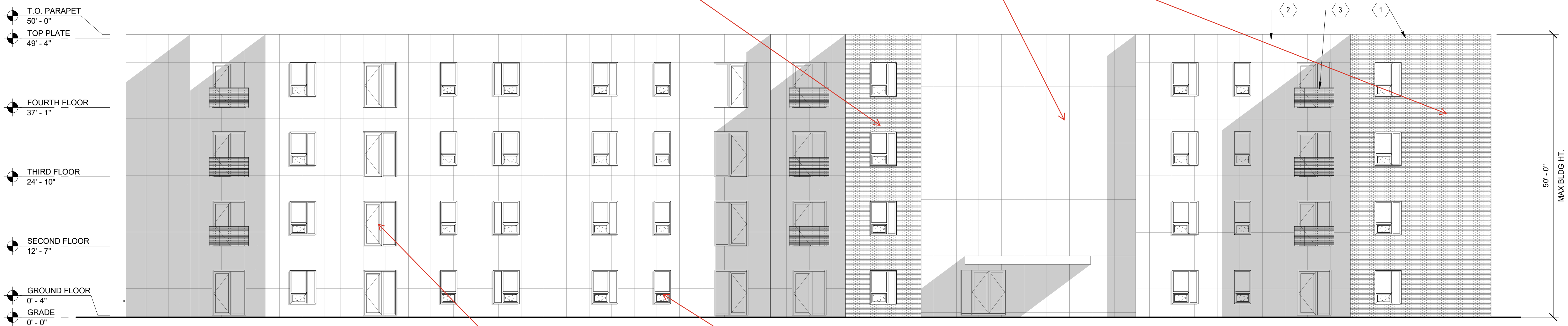
1 EAST ELEVATION SCALE: 1" = 10'-0"

What can be done to avoid these blank areas on the facades?