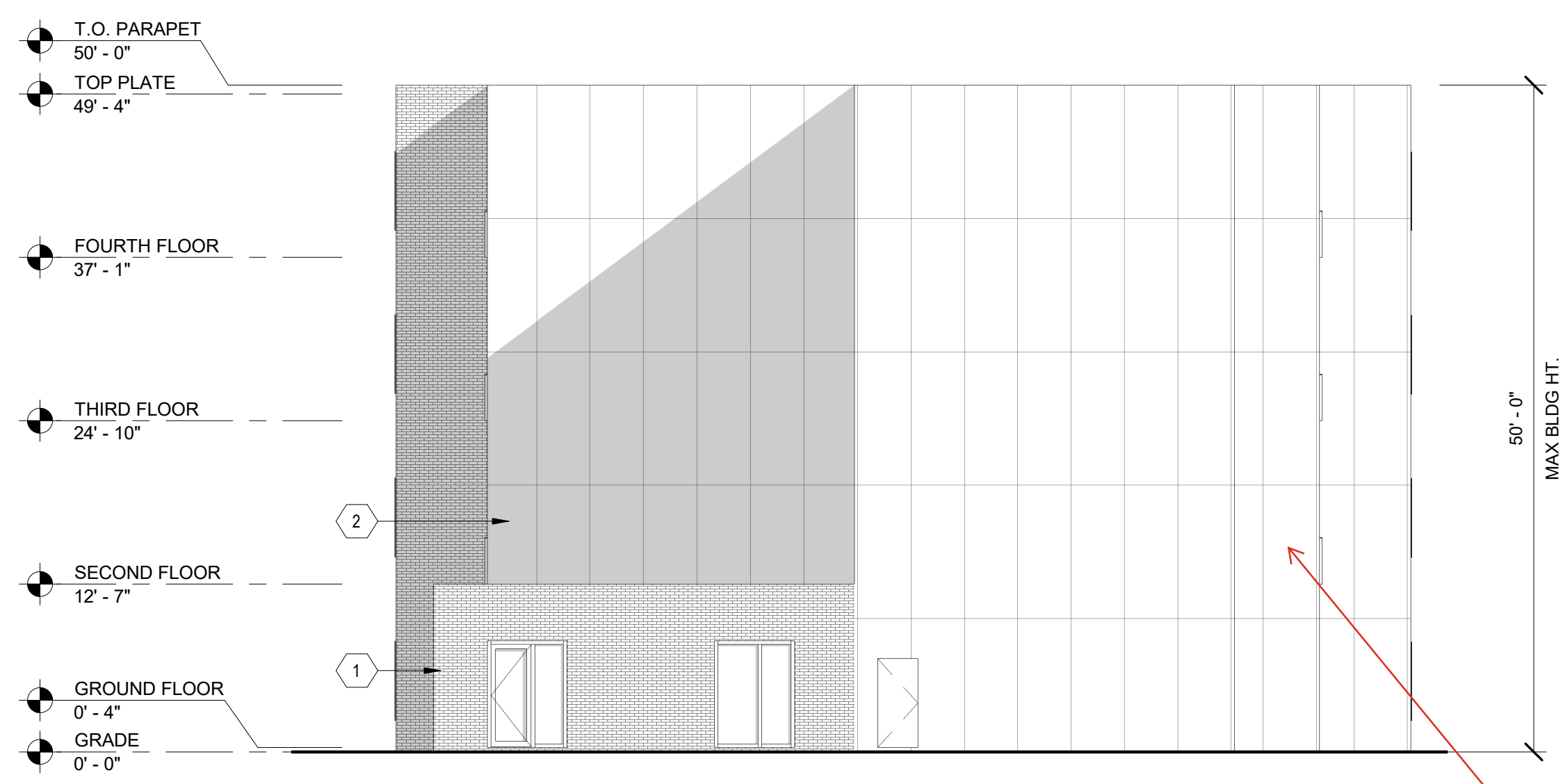
2 SOUTH ELEVATION SCALE: 1" = 10'-0"