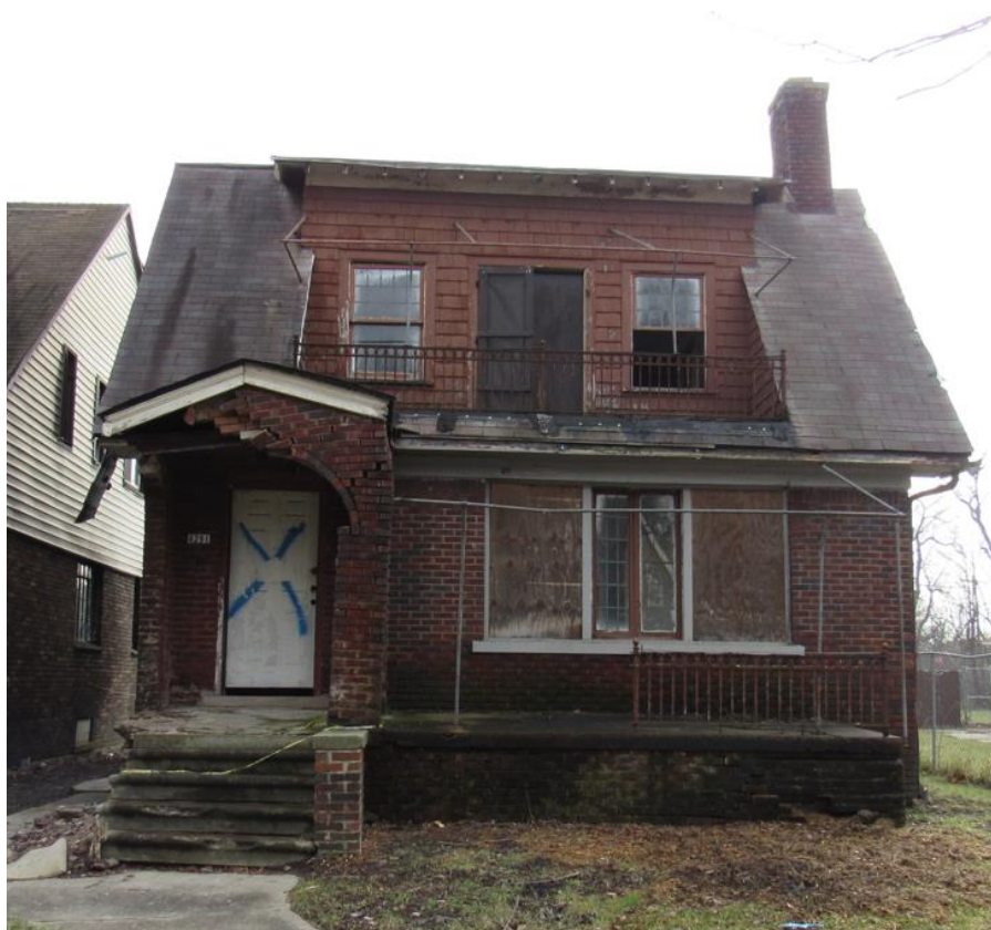
January 15, 2020