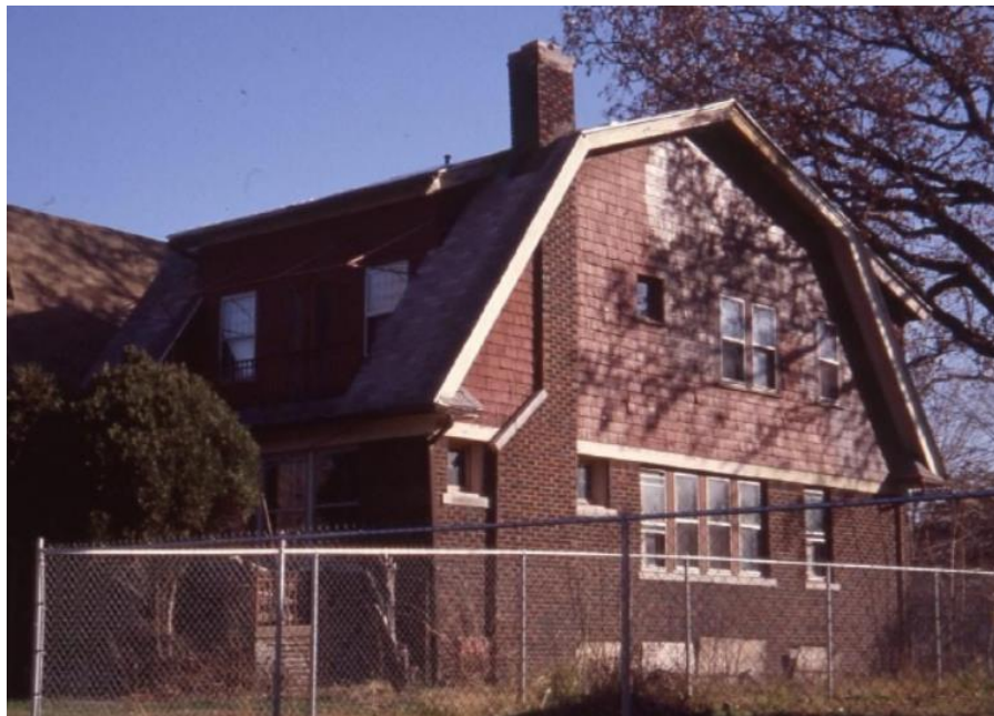
Designation Photograph 1998