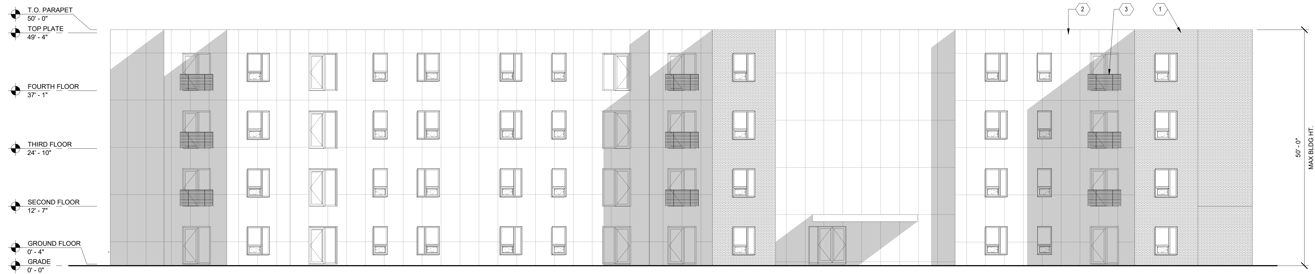
1 EAST ELEVATION SCALE: 1" = 10'-0"