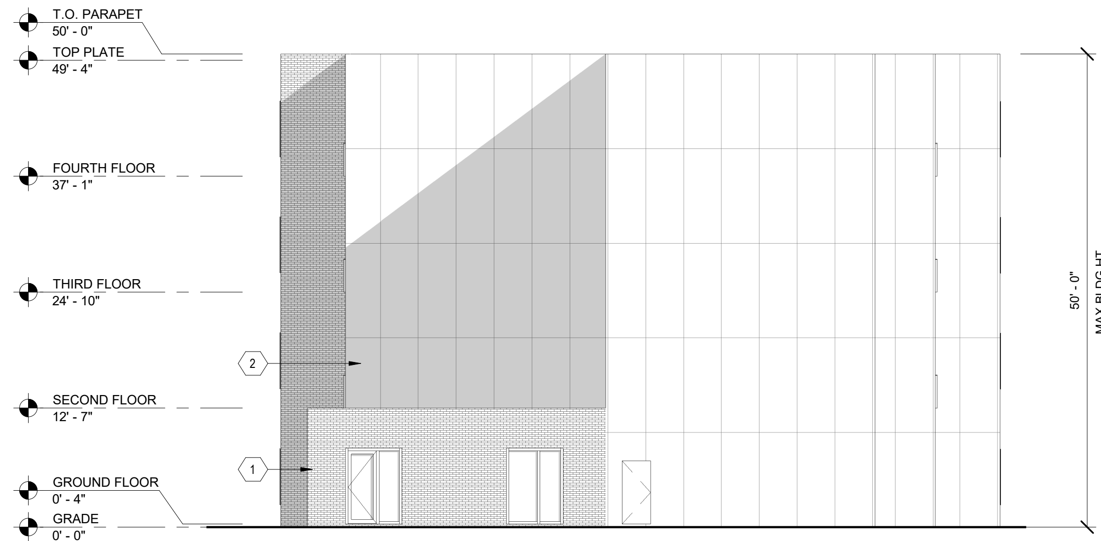
2 SOUTH ELEVATION SCALE: 1" = 10'-0"

DO NOT SCALE DRAWINGS | ©2021 Timothy Flintoff Architect, PLLC