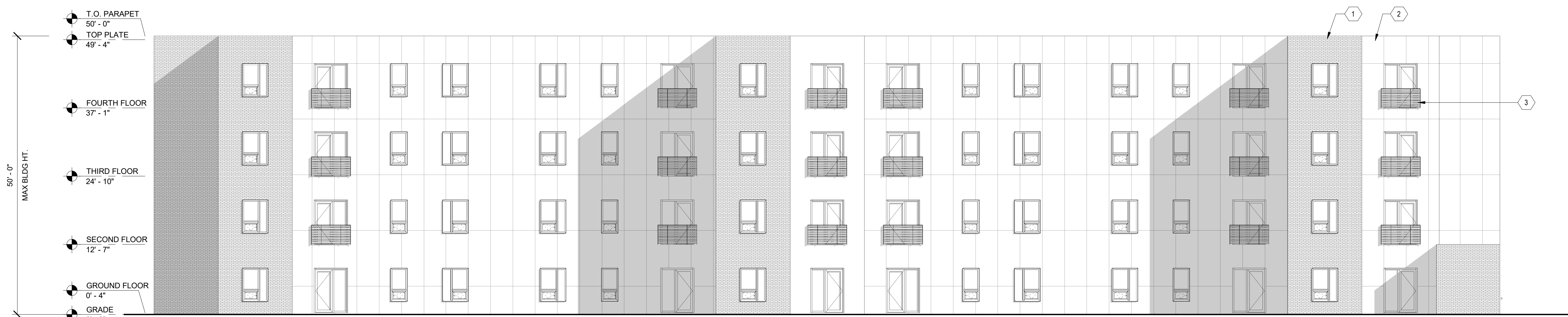
1 WEST ELEVATION SCALE: 1" = 10'-0"