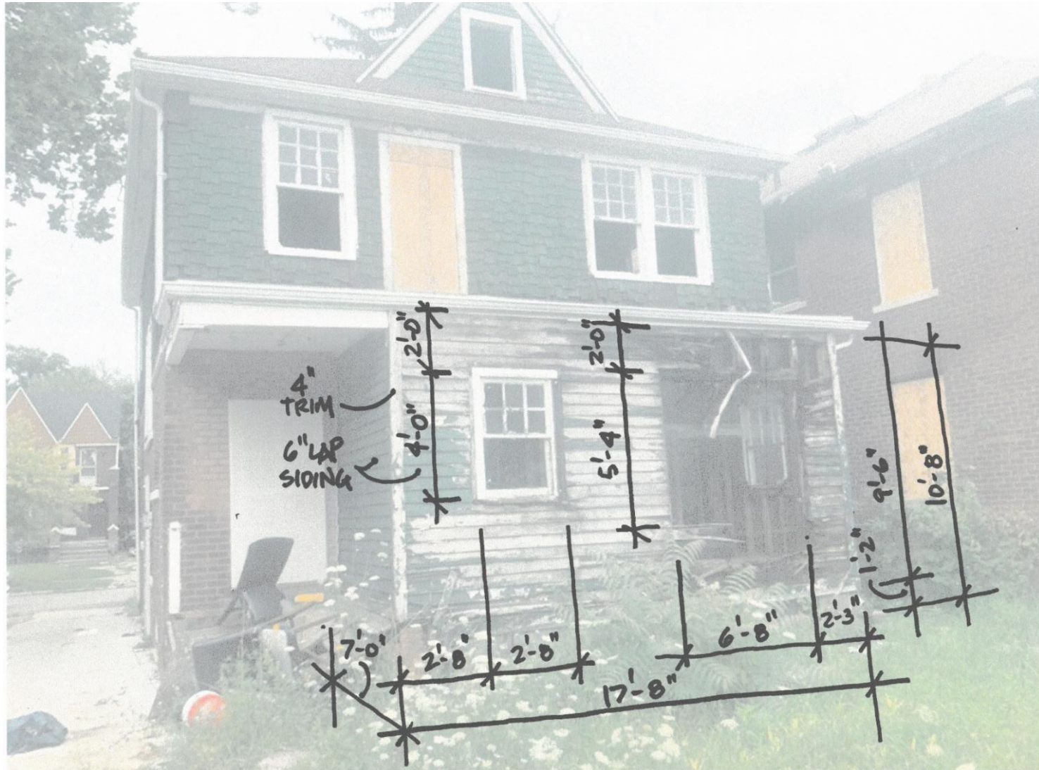
4221 Cortland -Dimensions