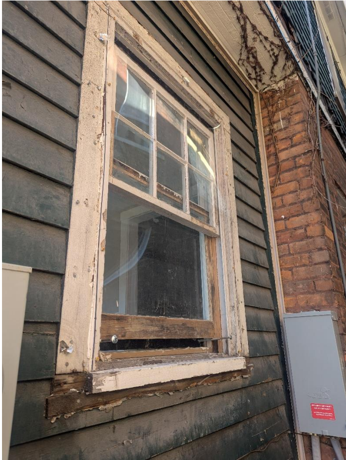
4221 Cortland - Existing 6" Wood Lap Siding (Exposure 4-1/2")