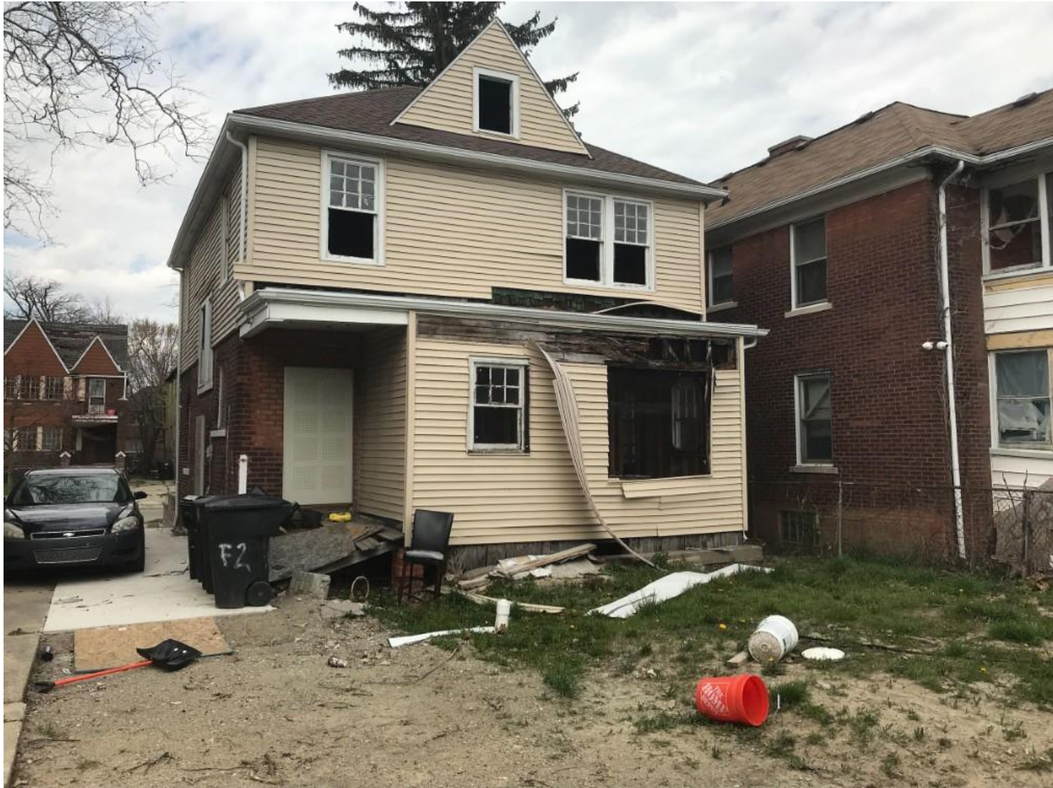
4221 Cortland - Before Vinyl Siding was removed