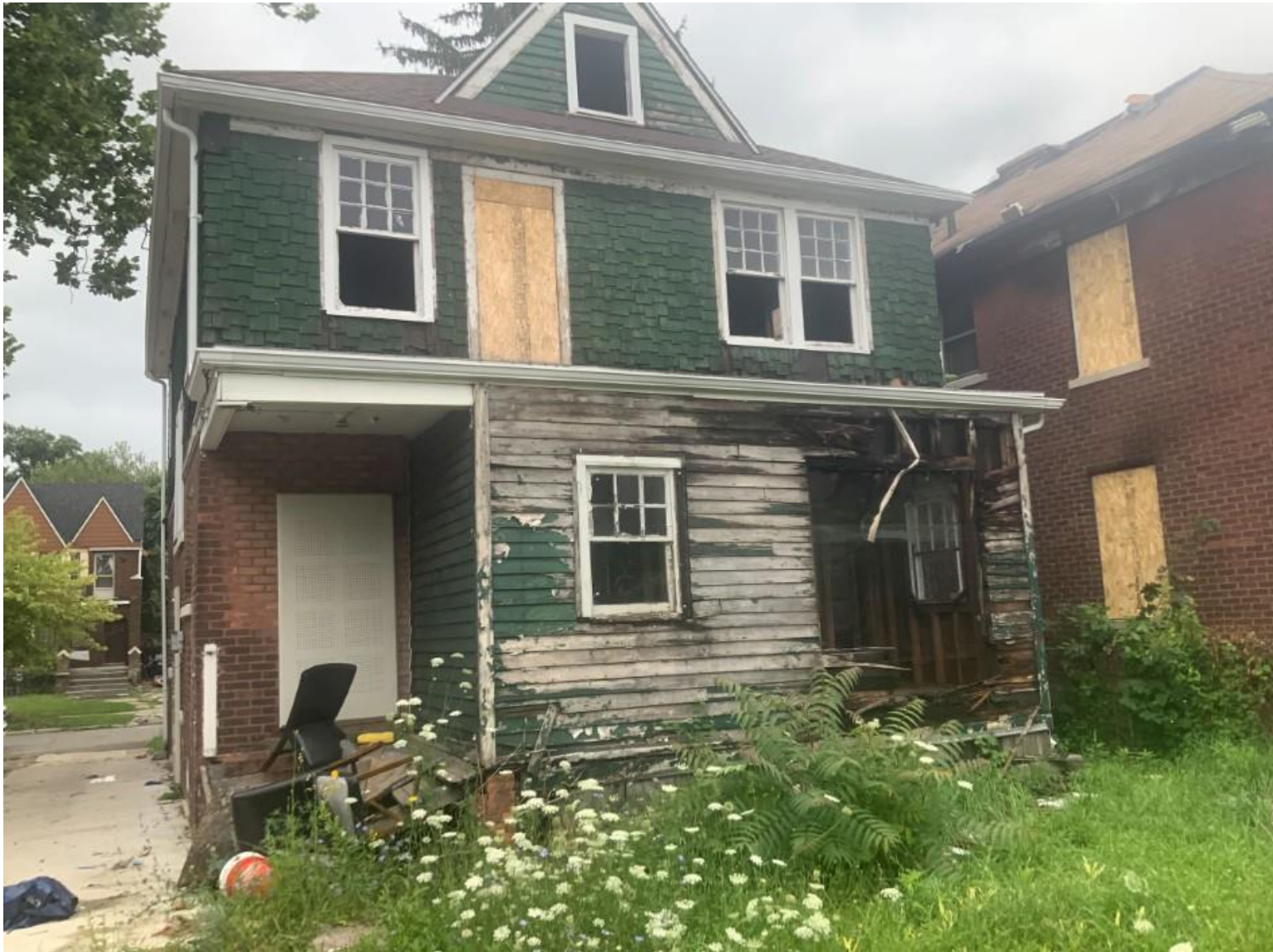
4221 Cortland - Vinyl Siding removed