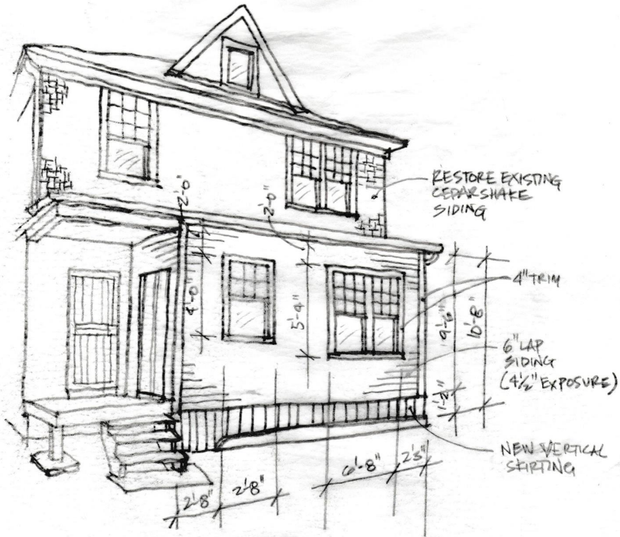
4221 Cortland - Proposed