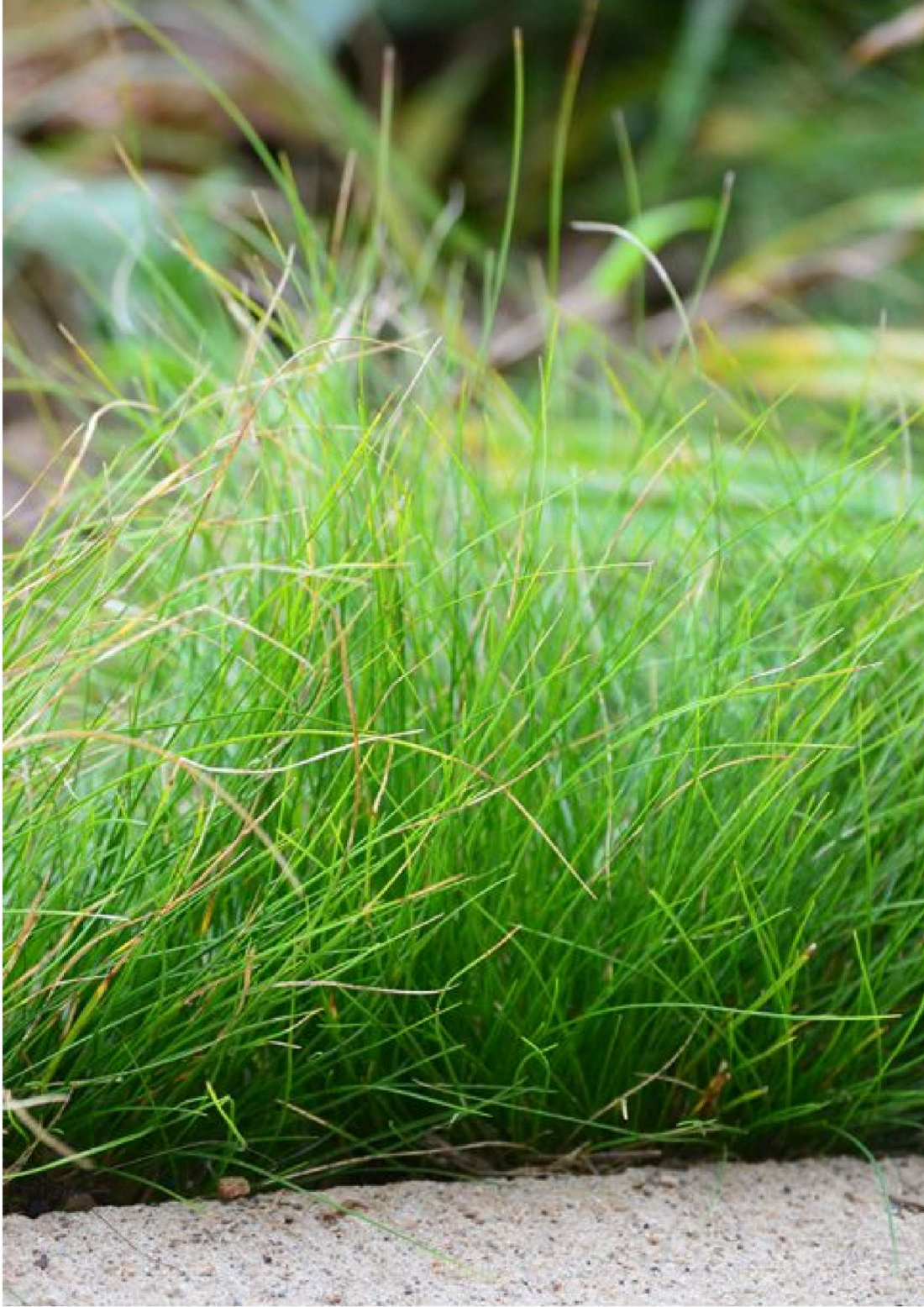
Ivory Sedge - Carex eburnea