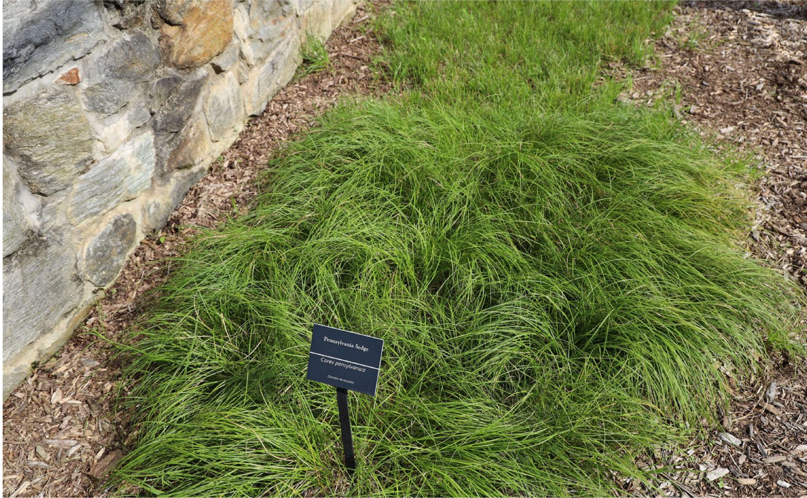
Pennsylvania Sedge - Carex pensylvanica