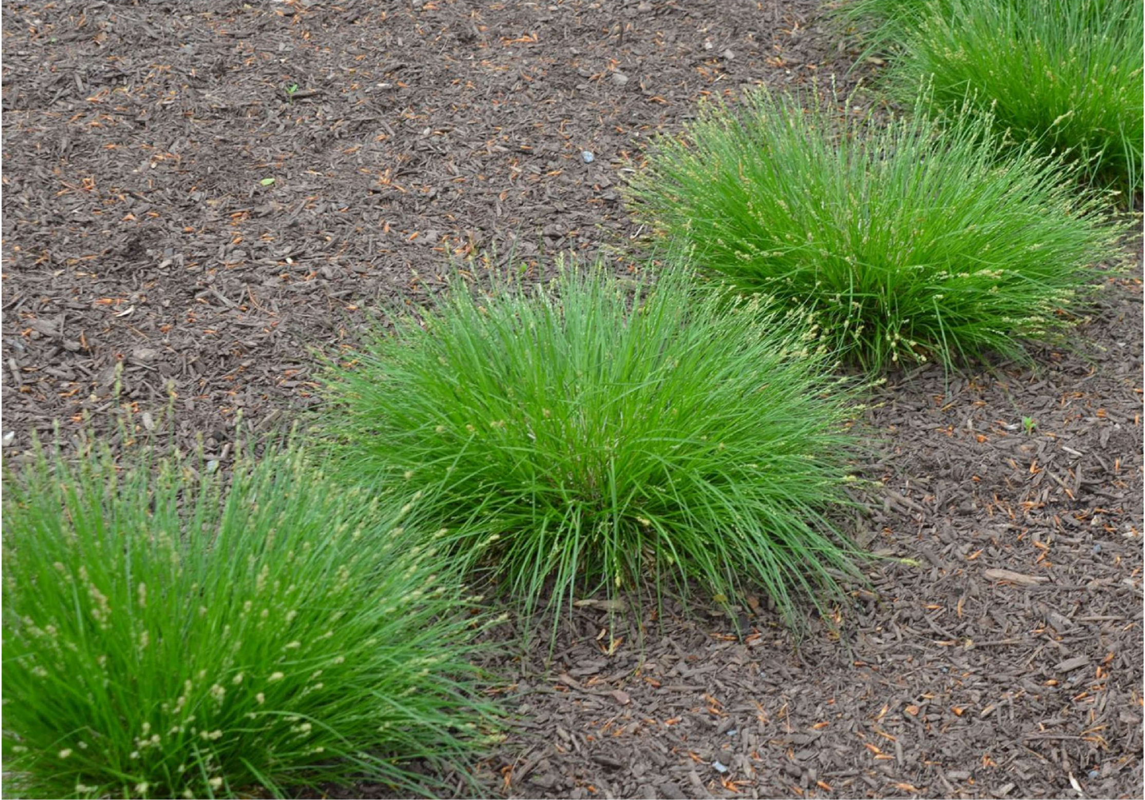
Eastern Star Sedge - Carex radiata