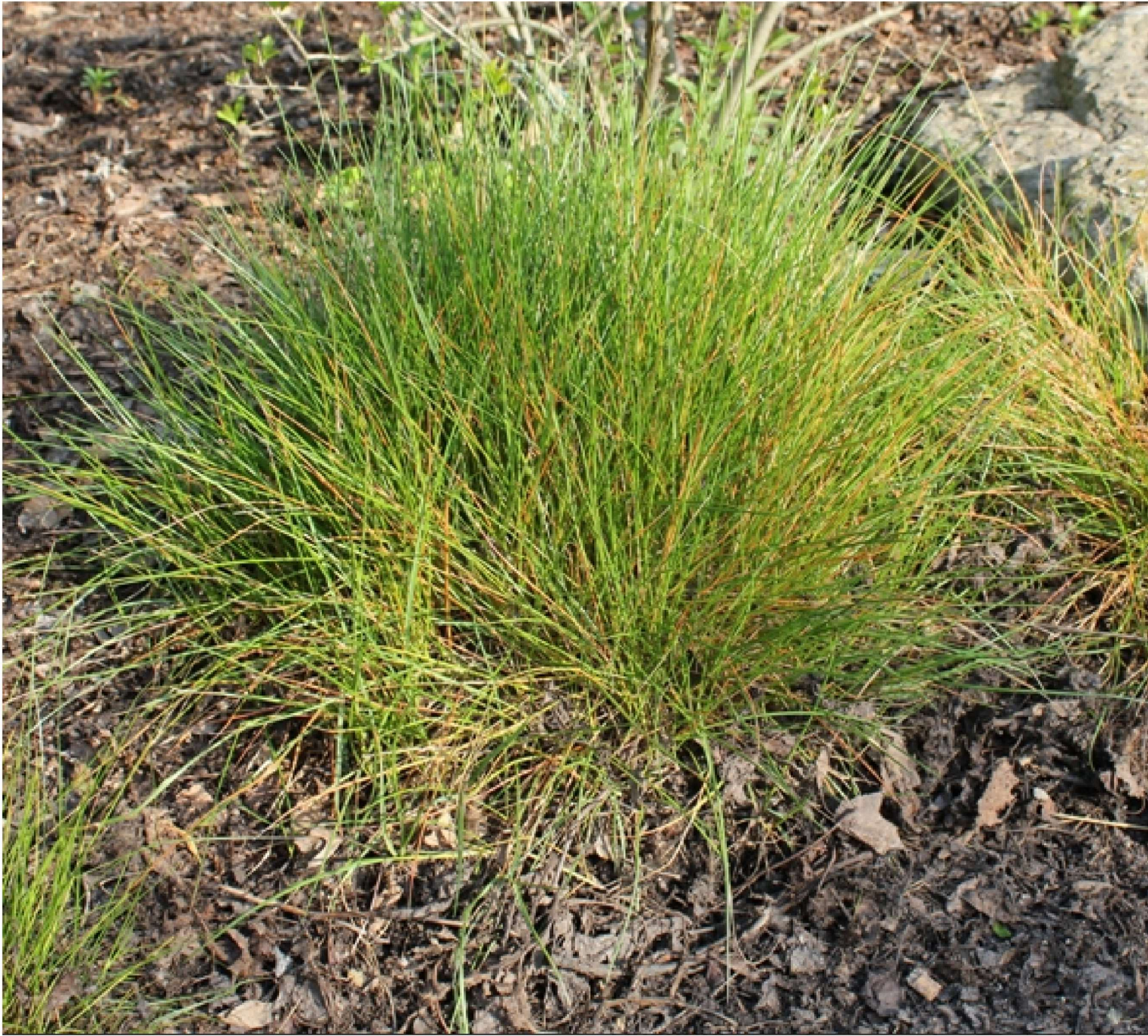
Path Rush - Juncus Tenuis