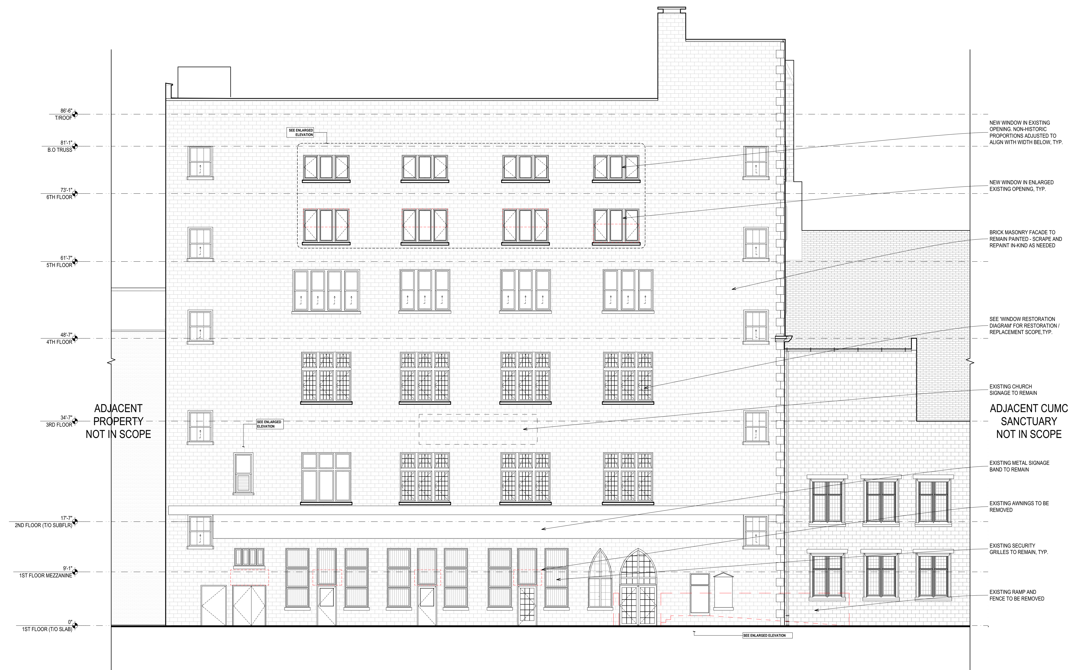
1 NORTH ELEVATION SCALE: 1/8" = 1'-0"