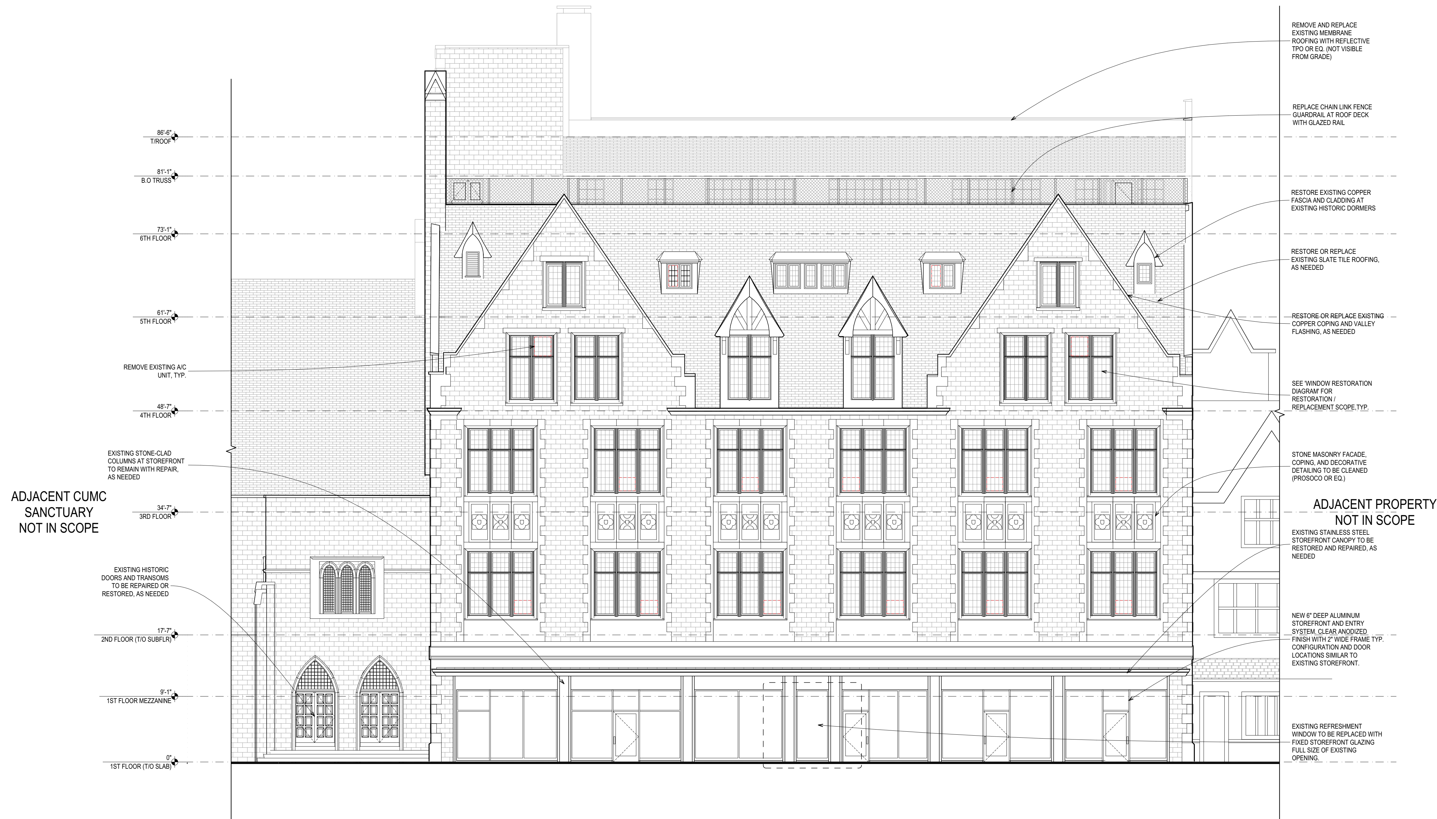
1 SOUTH ELEVATION SCALE: 1/8" = 1'-0"