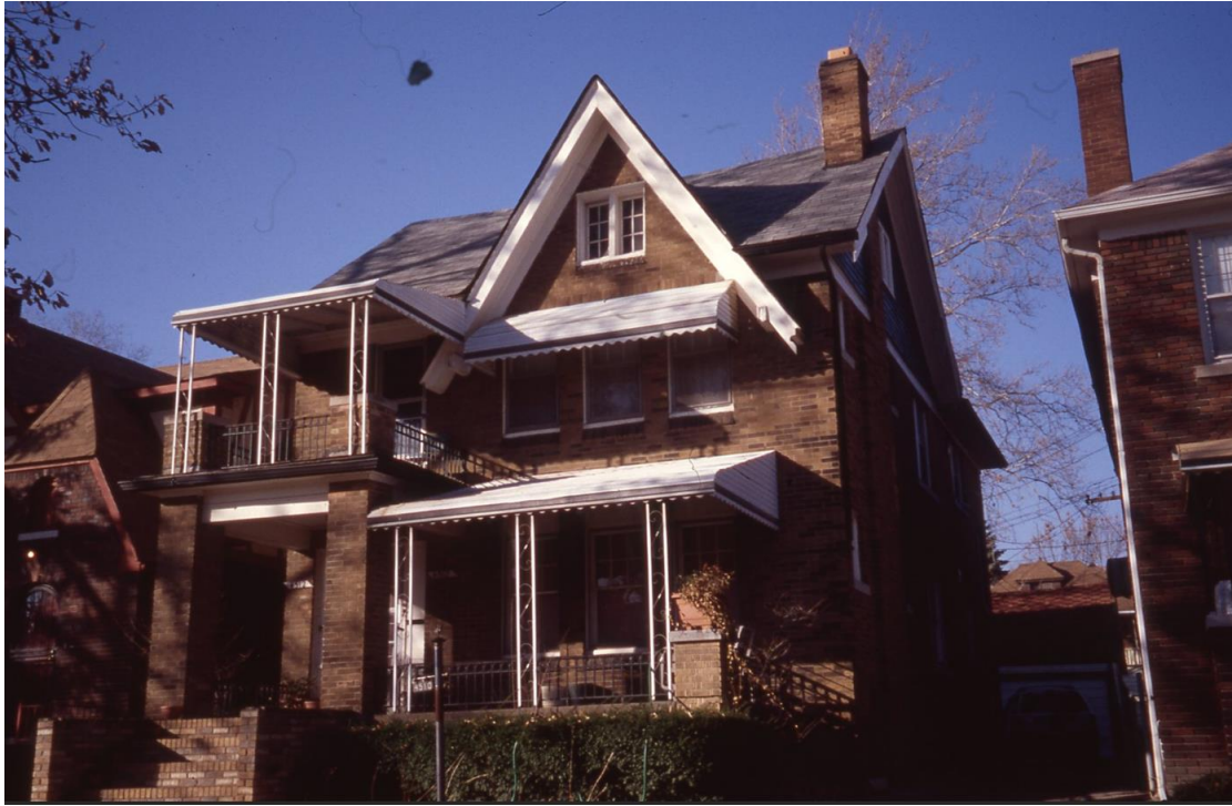
Designation Photograph 1998