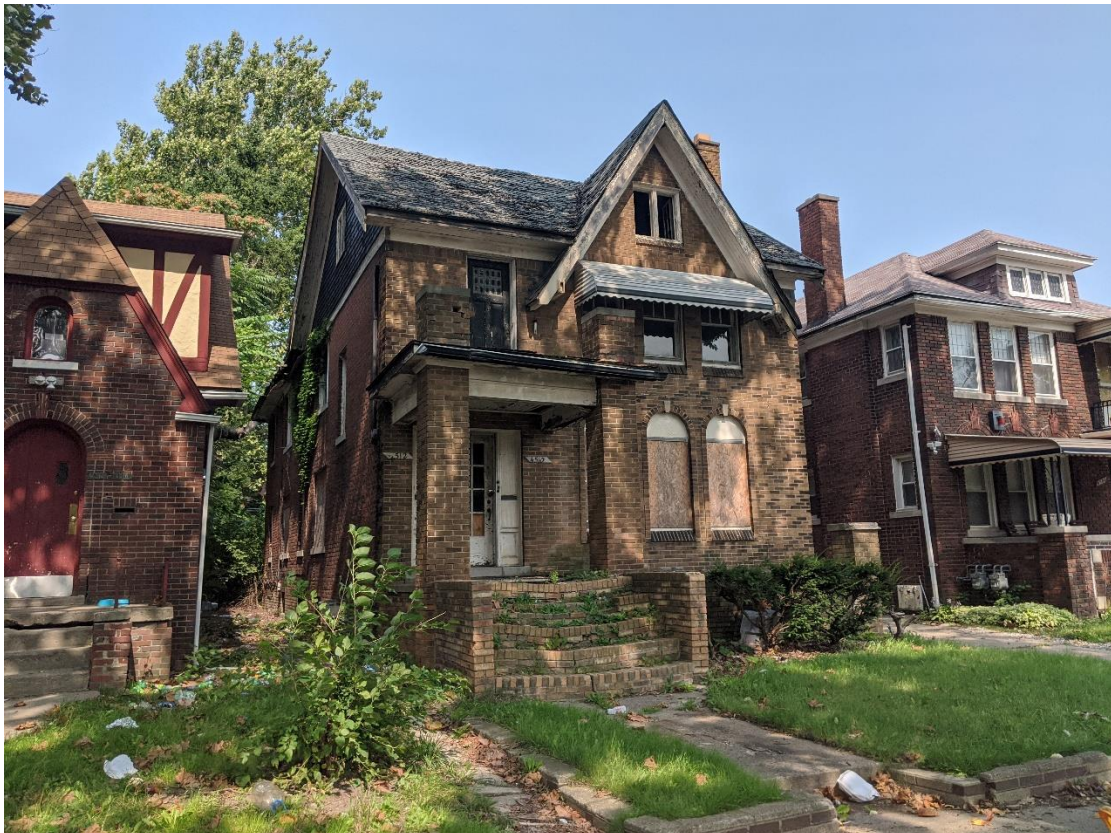
September 15, 2020