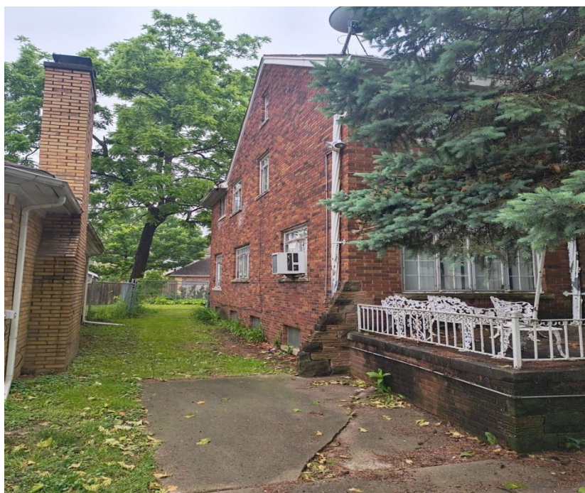
Description: Side C of Property.