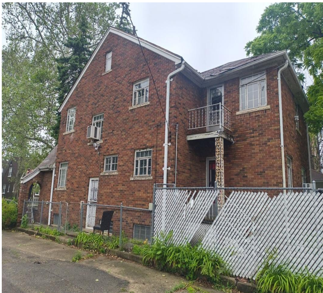
Description: Side B of Property.