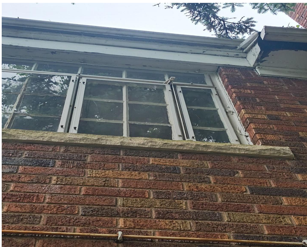
Photos of the rotten wood.