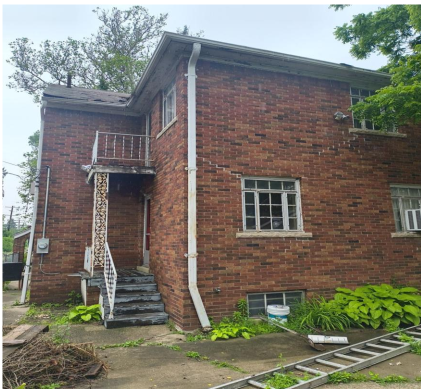
Description: Side D of Property. Rear