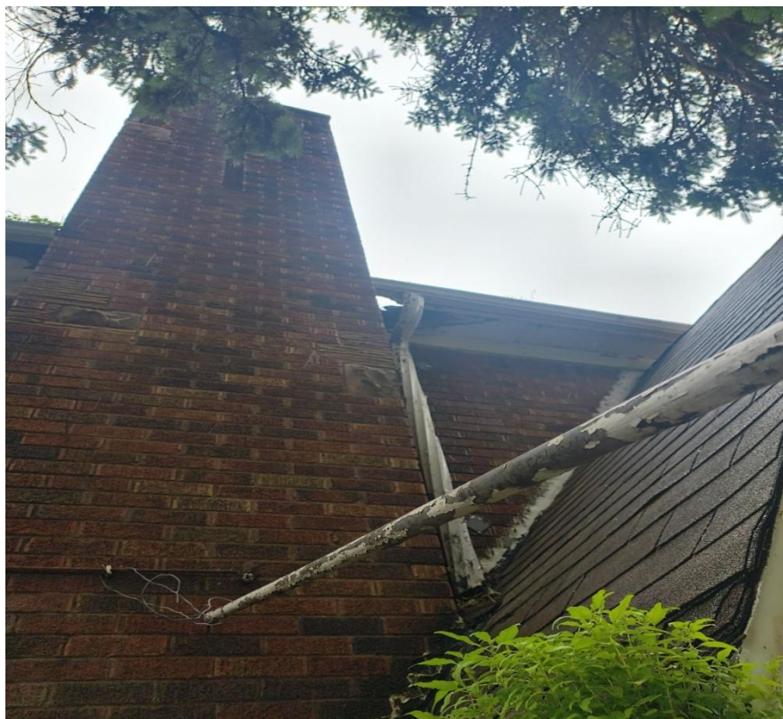
Photos of the rotted wood.