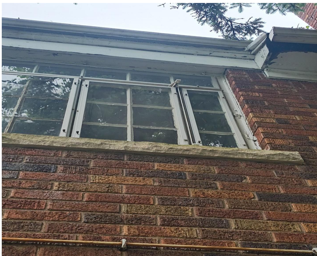
Photos of the rotten wood.