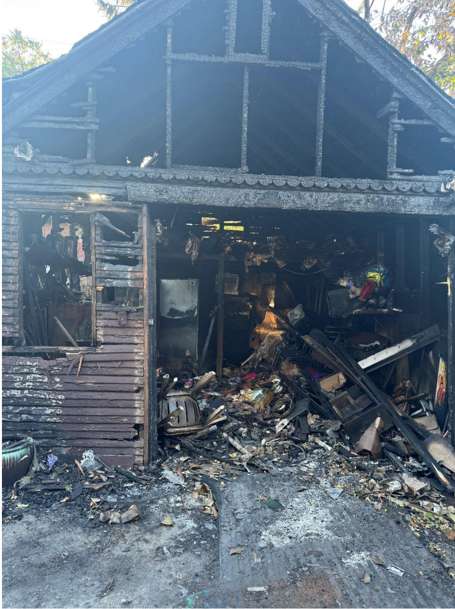
Garage After Fire