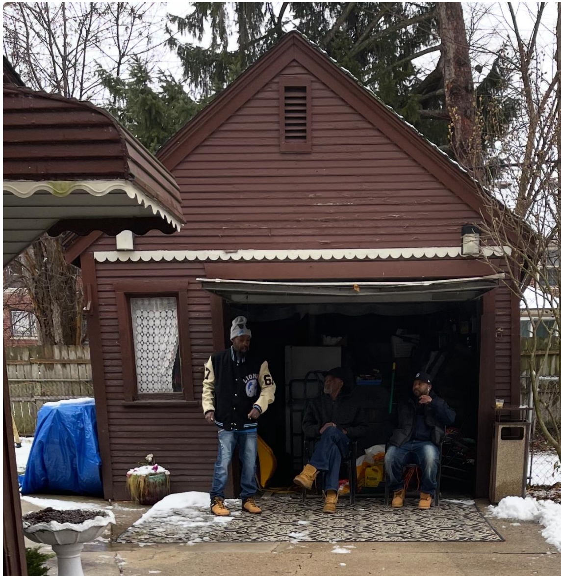
Garage Before Fire