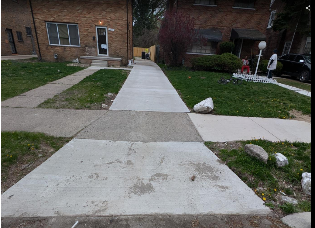
DRIVEWAY FROM THE BACK OF THE HOUSE