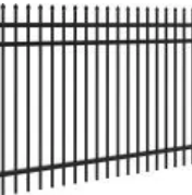
Ornamental Steel Fence | 3 Rail | Pressed Point | 6'