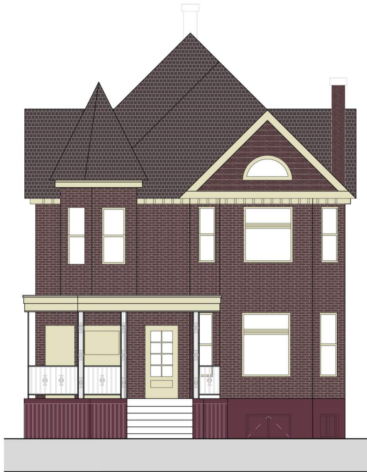
1 NORTH ELEVATION - EXISTING ORIGINAL IMAGE SCALE: 3/16" = 1'-0"