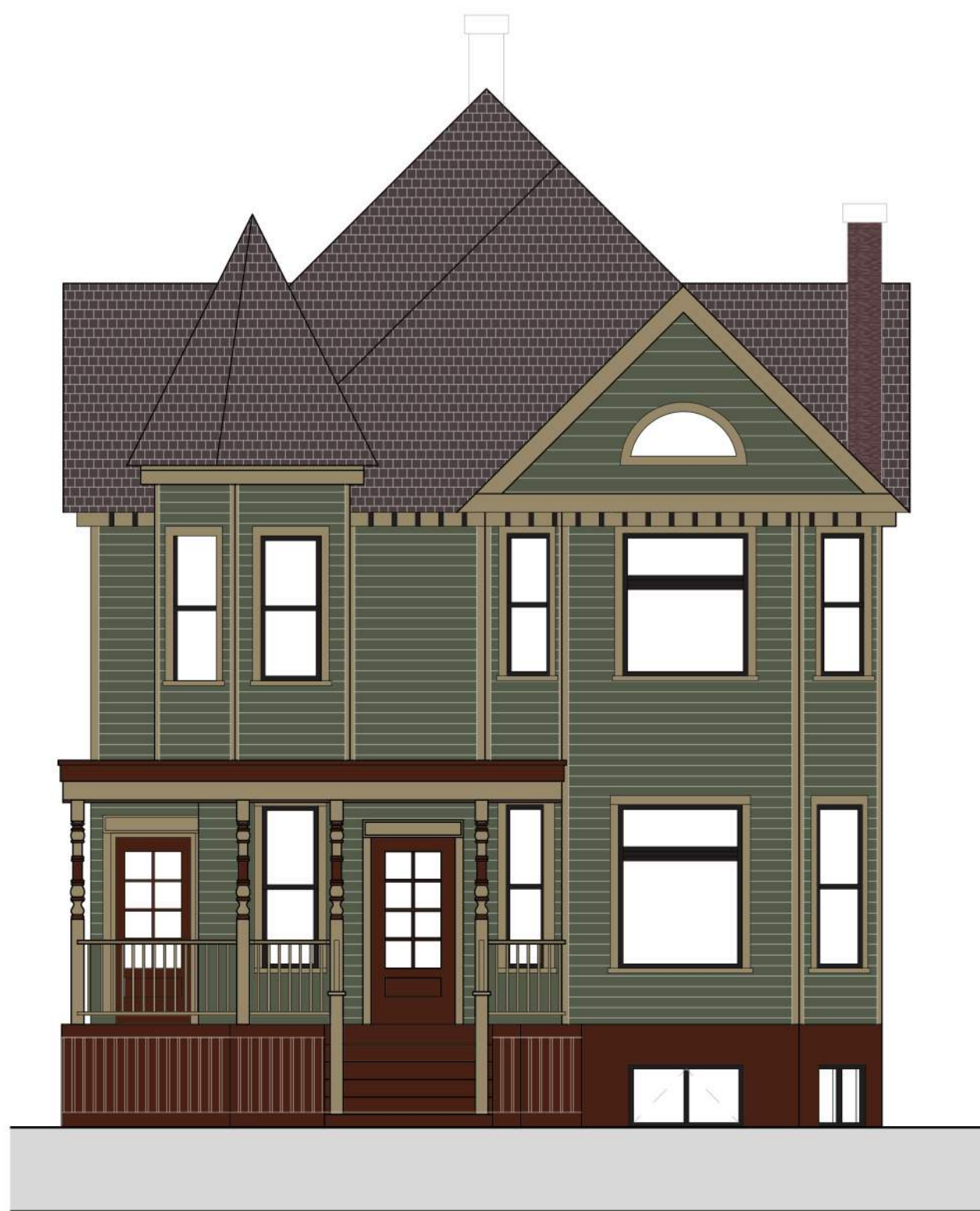
3 NORTH ELEVATION - PROPOSED ORIGINAL IMAGE SCALE: 3/16" = 1'-0"