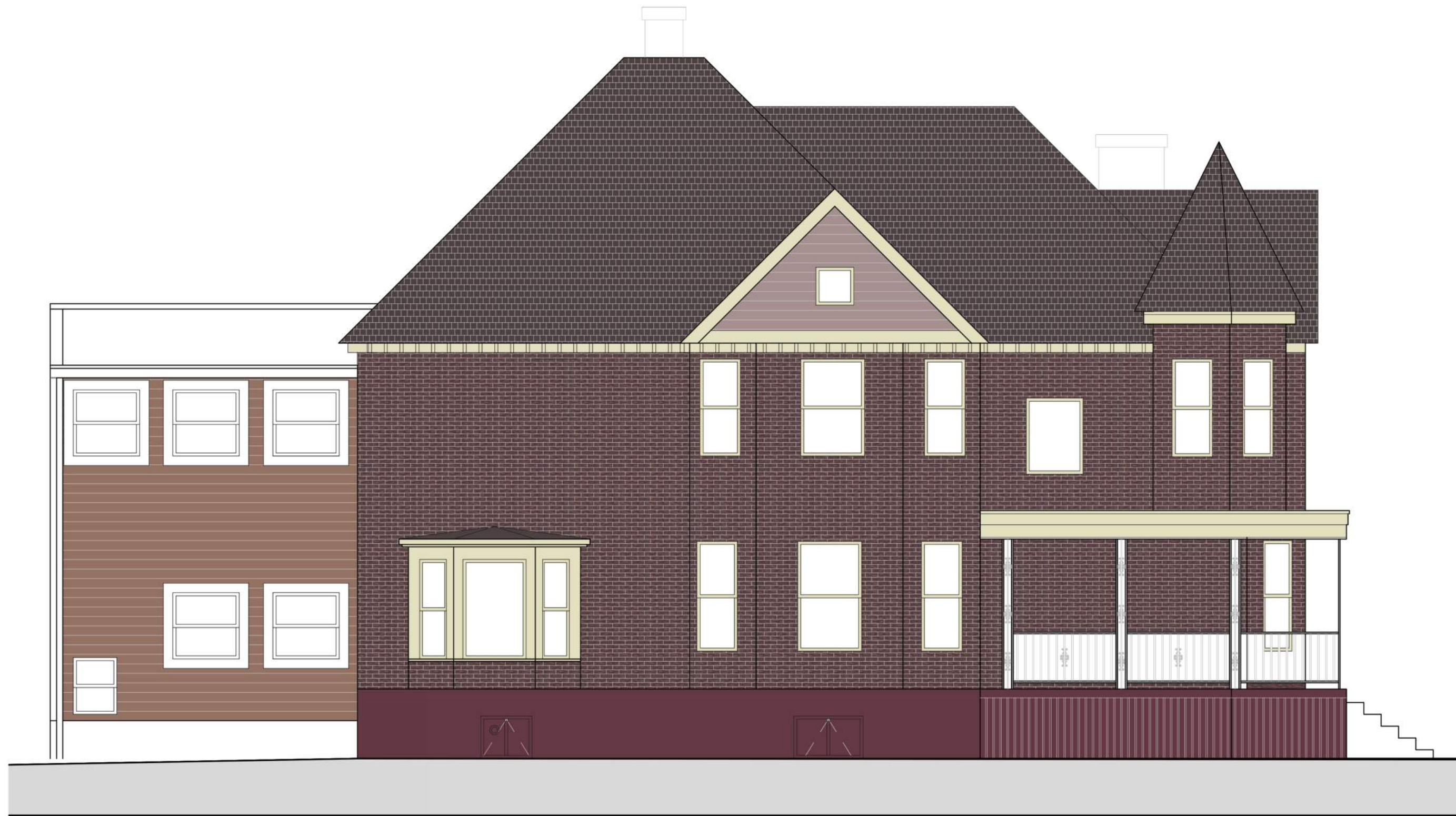
2 WEST ELEVATION - EXISTING ORIGINAL IMAGE SCALE: 3/16" = 1'-0"