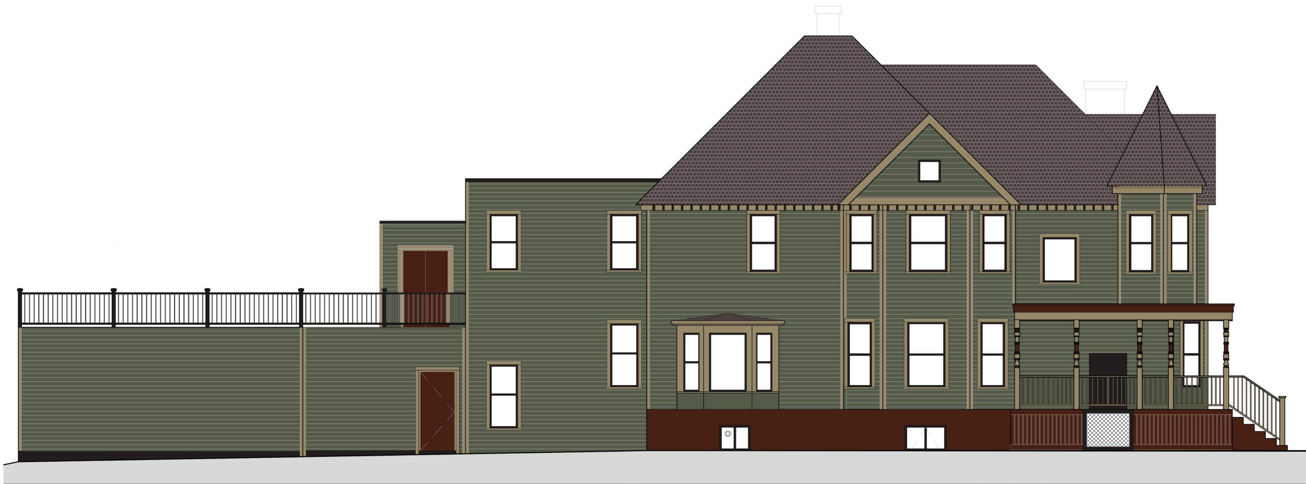
4 WEST ELEVATION - PROPOSED ORIGINAL IMAGE SCALE: 3/16" = 1'-0"