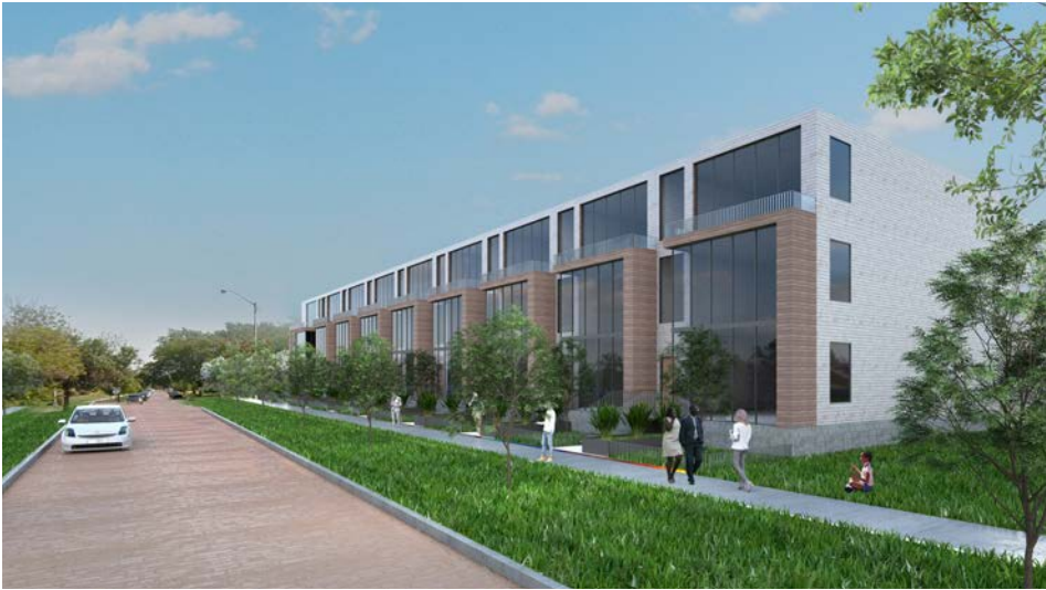
CONCEPTUAL VIEW OF ROWHOUSES ON VIRGINIA PARK STREET, LOOKING EAST