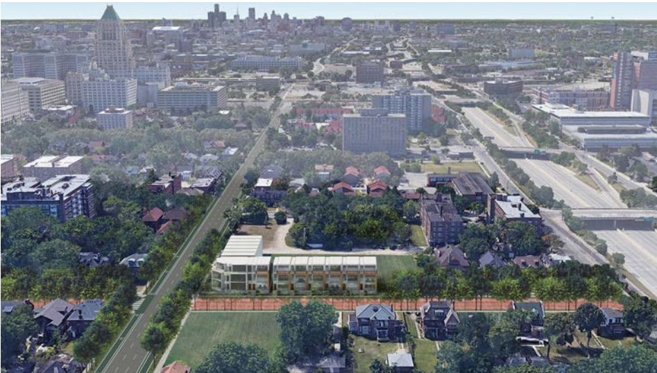
CONCEPTUAL AERIAL VIEW OF ROWHOUSES ON VIRGINIA PARK STREET, LOOKING SOUTH