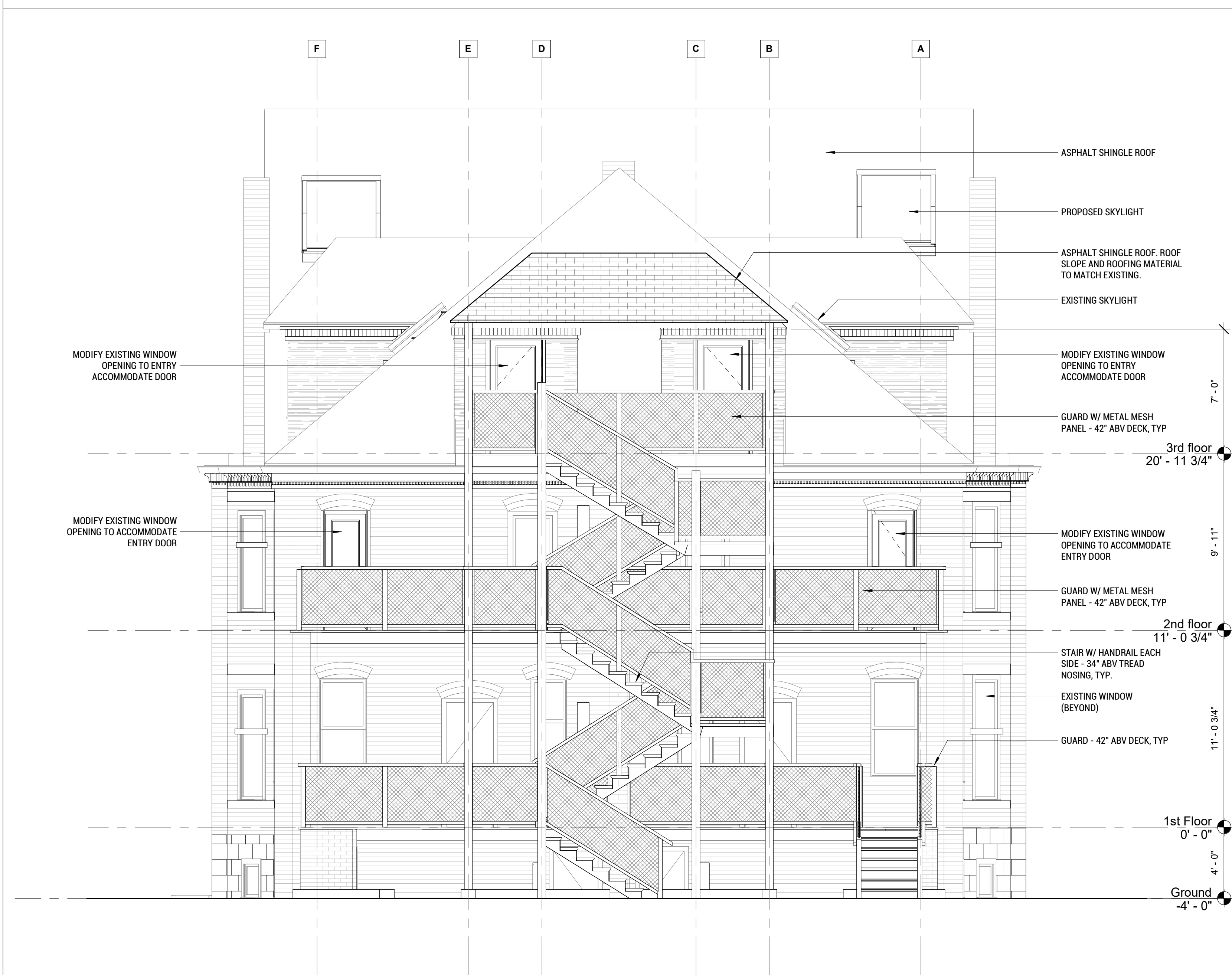
2 PROPOSED PARTIAL SOUTH ELEVATION AT STAIR / DECK H.32 1/4" = 1'-0"