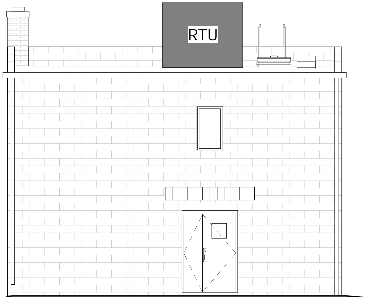
2 E31 NORTH (STREET) ELEVATION W/ RTU ABOVE ADDITION