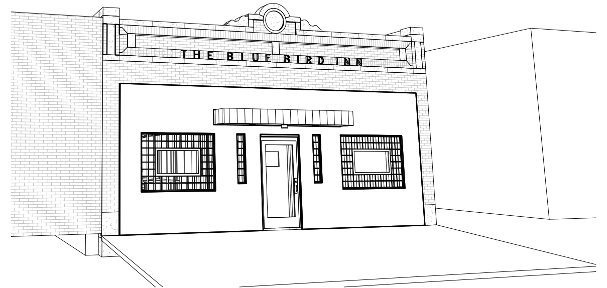
3 TIREMAN AVE VIEW (FROM MIDDLE OF STREET)