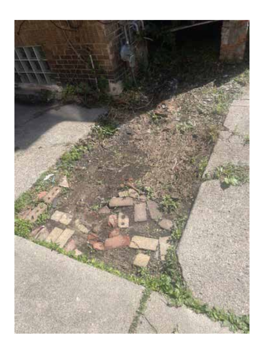
Missing conrete in driveway leading into the backyard.