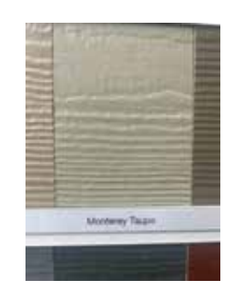
Proposal JAMESHARDIE PRIMED 5 FIBER CEMENT CEDARMILL LAP SIDING Cobblestone