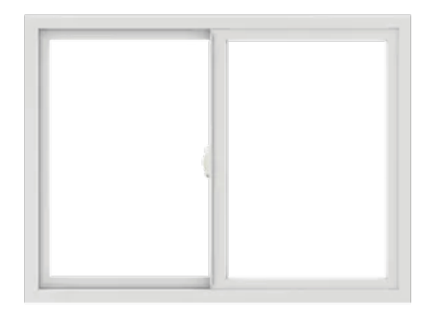
Proposed replacement window for back side 2nd floor. Andersen 100 series Gilding Window