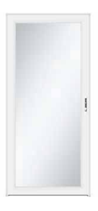
Proposal Front Security Door