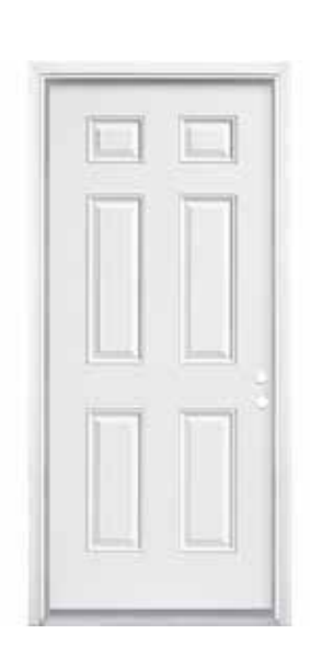
Proposal Side and Back Doors 6 Panel Fiberglass