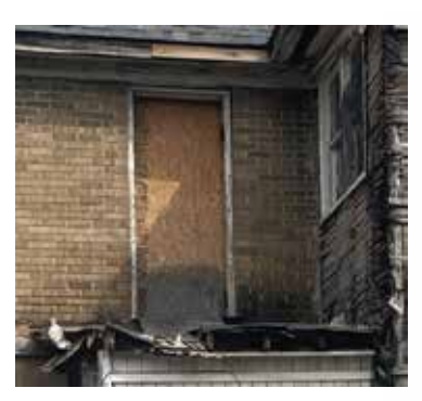
Back Upper Porch Door