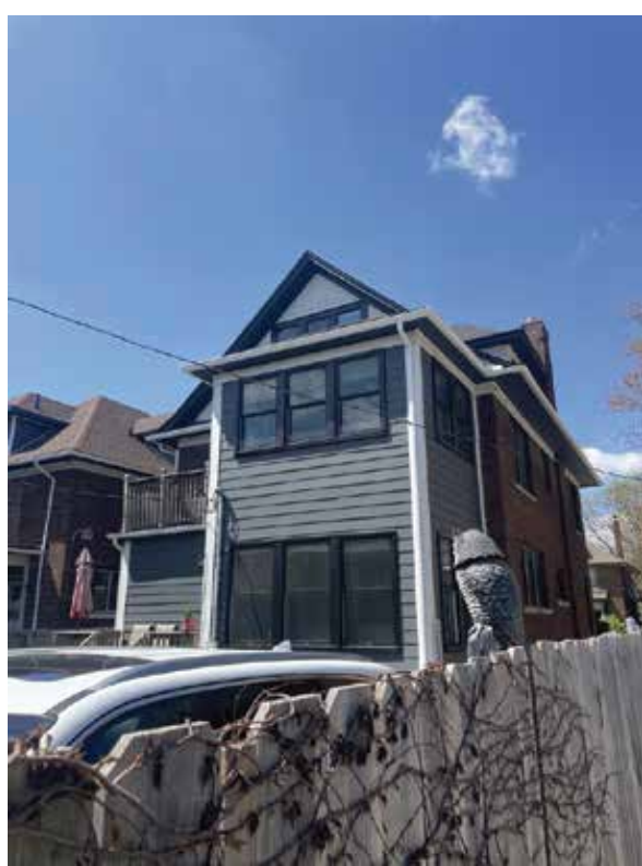
Finished Example of proposal repairs This photo was taken of the house next door 1659 Edison St