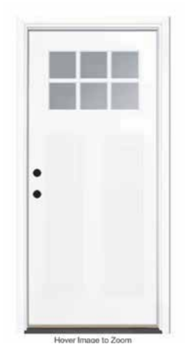
Proposal Front Door Fiberglass Craftsman