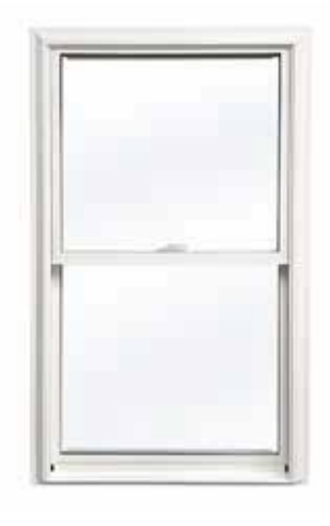
Proposed replacement windows for back wall Andersen 100 series 1st floor