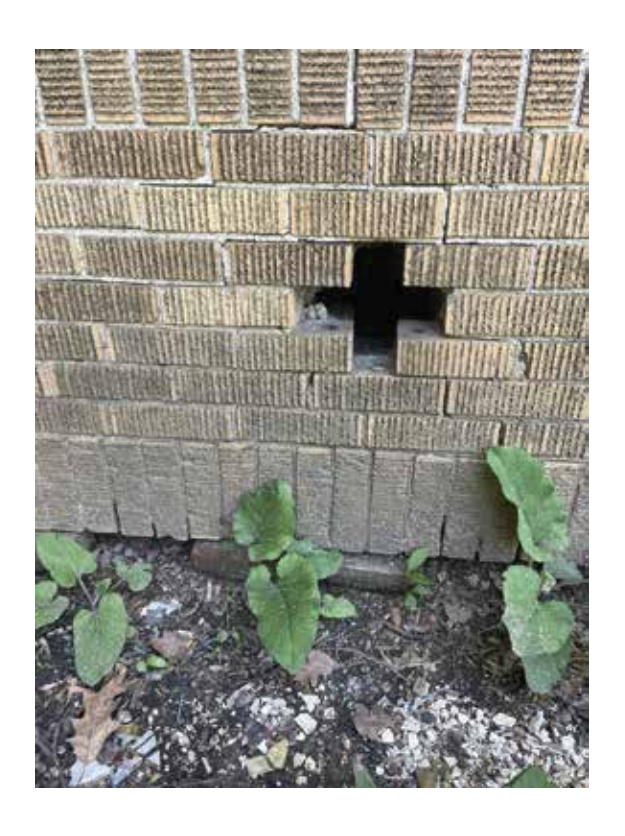
Replace missing bricks from the side.