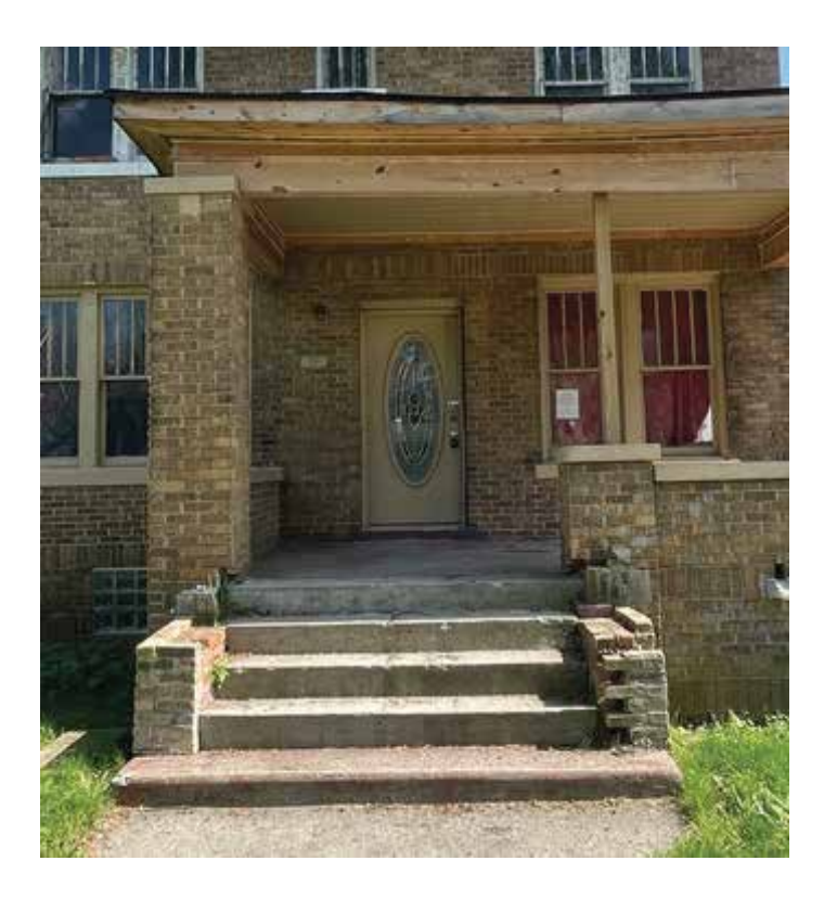
Replace missing bricks from front steps additional install missing caps on top of the bricks.

Lastly, replace the 4x4 wooden post in the center with matching bricks like the other columns.