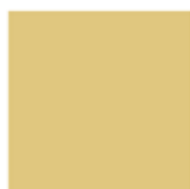
A:3 Light Yellow MS: 5Y 8/6