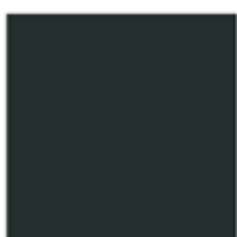
A:8 Blackish Green MS: 2.5BG 2/2