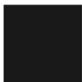
B:19 Black MS: N 0.5/