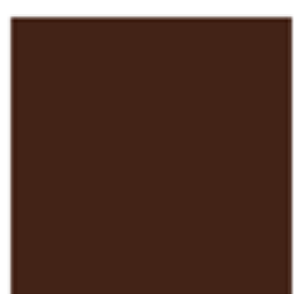
B:18 Dark Reddish Brown MS: 2.5YR 2/4