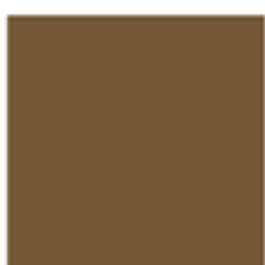
B:13 Moderate Olive Brown MS: 2.5Y 4/4