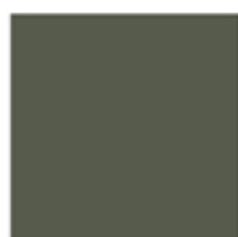
B:11 Grayish Olive Green MS: 5GY 4/2