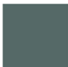
B:12 Grayish Green MS: 10G 4/2