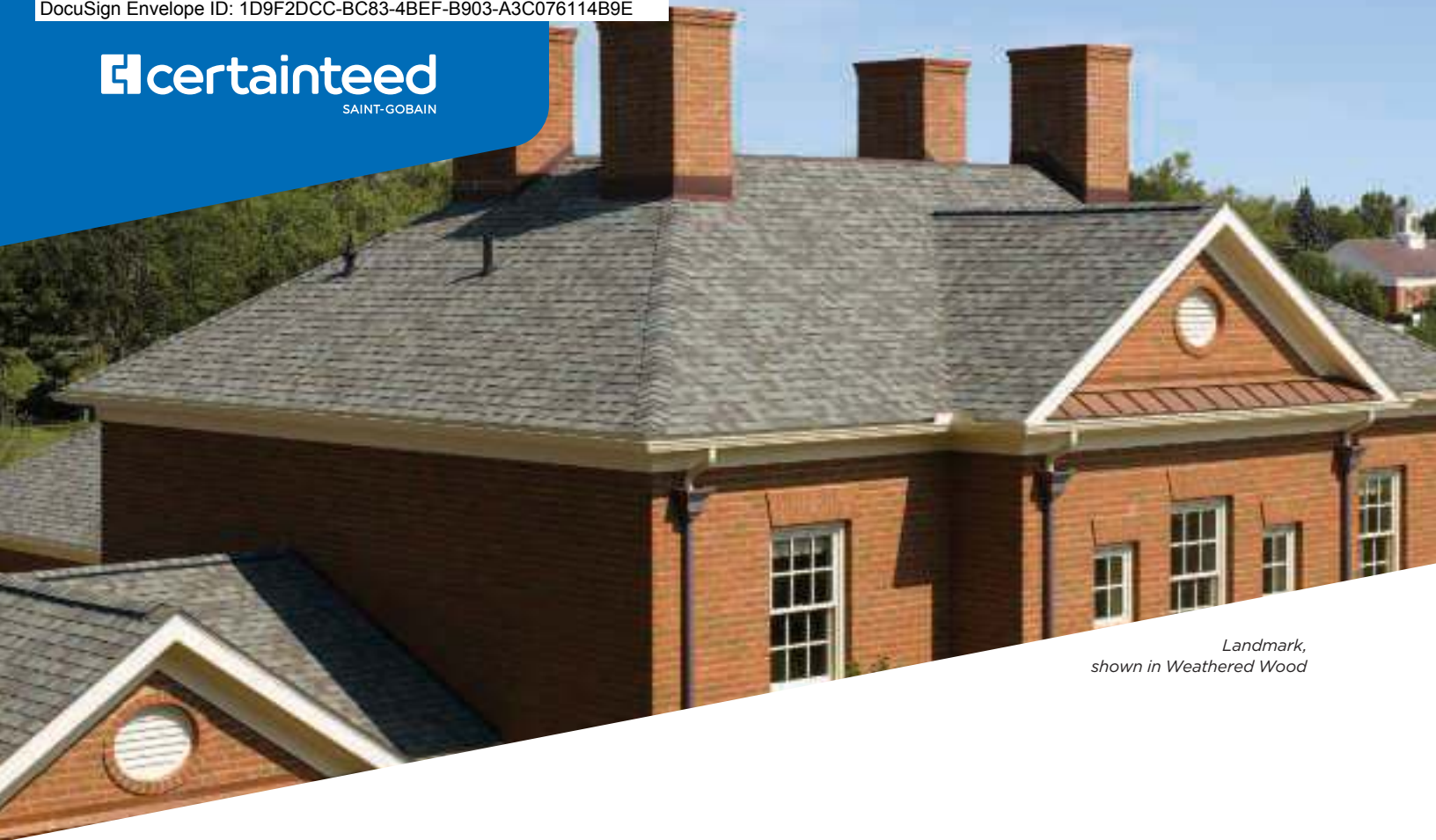
Landmark, shown in Weathered Wood