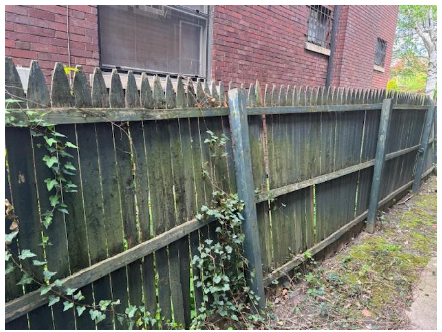
**Bowing falling back at support beams

c. **Height and Dimensions**: The new fence will maintain the same height and dimensions as the existing one, preserving the privacy and boundary delineation of the property in accordance with the guidelines stipulated by the historical district commission (see image below).