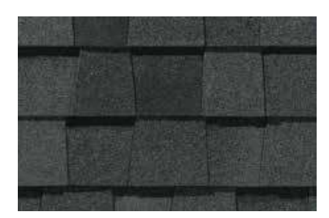
Max Def Moiré Black