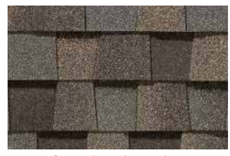
Max Def Weathered Wood