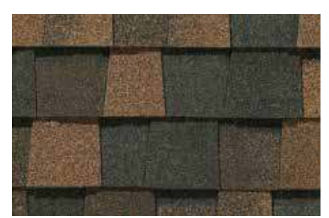
Max Def Burnt Sienna