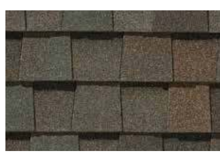
Max Def Heather Blend