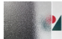
GLASS: PATTERN 62