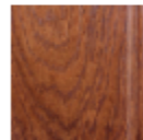
WOOD SPECIES AND FINISH: OAK (WHITE), SELECT, CINNAMON STAIN