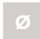
DISTRESS: NO DISTRESS