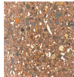
BRICK RED 10%

SEE ACTUAL SAMPLES FOR BETTER VIEW OF COLORS