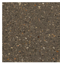
ASH CHARCOAL 10%