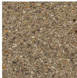
COUNTY GRAY 10%