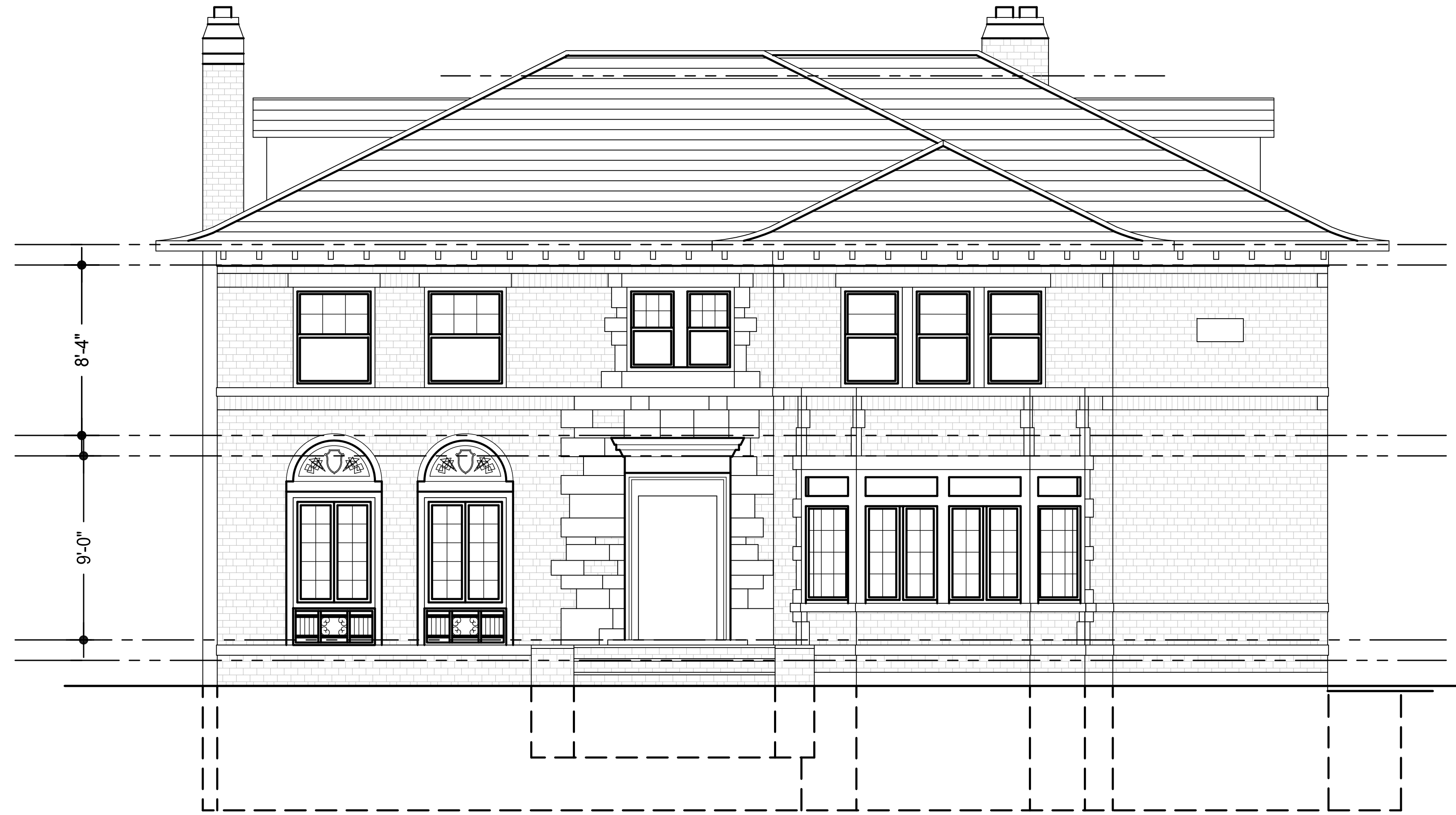
EXISTING NORTH ELEVATION SCALE: 1/4" = 1'-0"