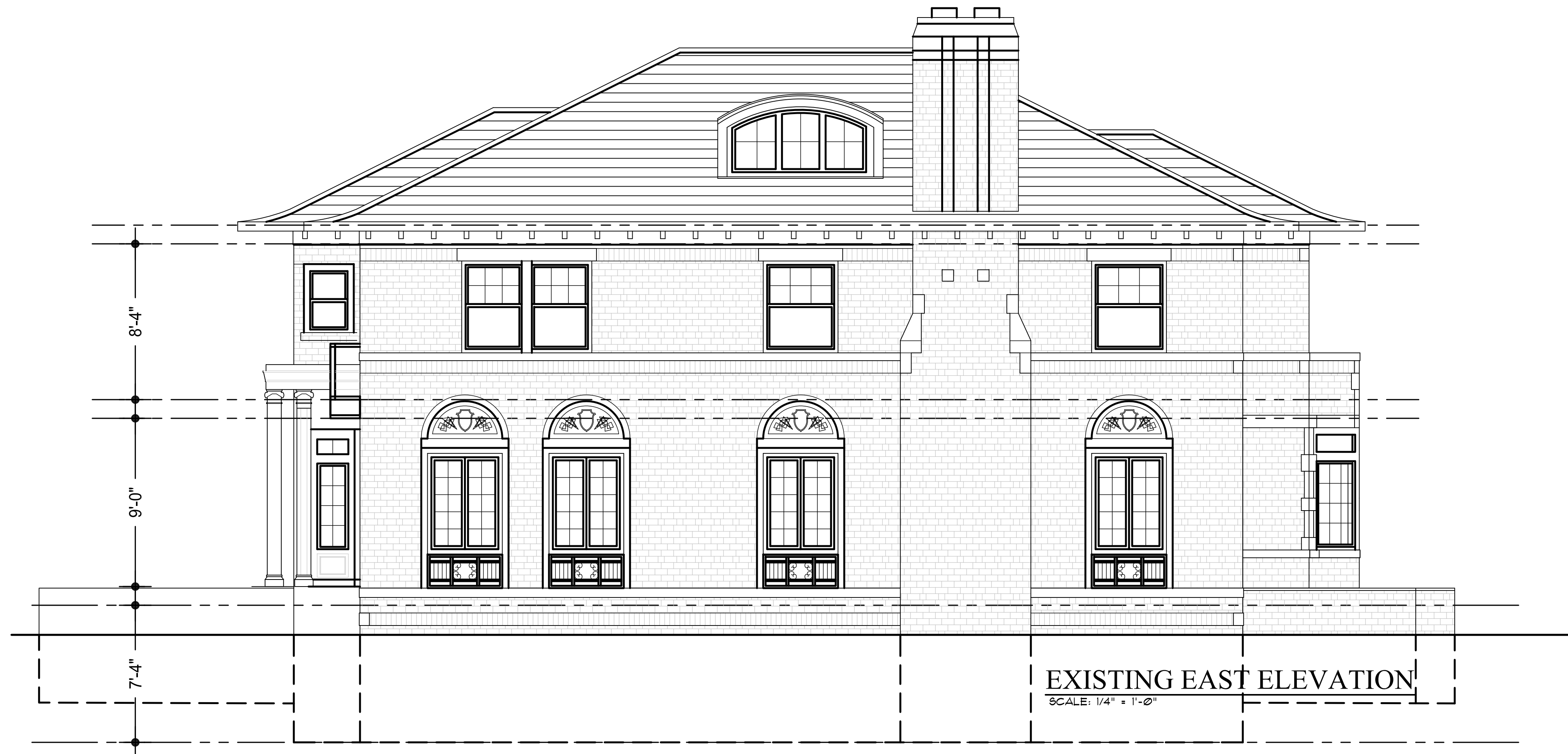
EXISTING EAST ELEVATION SCALE: 1/4" = 1'-0"

GULARI RESIDENCE 9230 DWIGHT STREET DETROIT, MICHIGAN