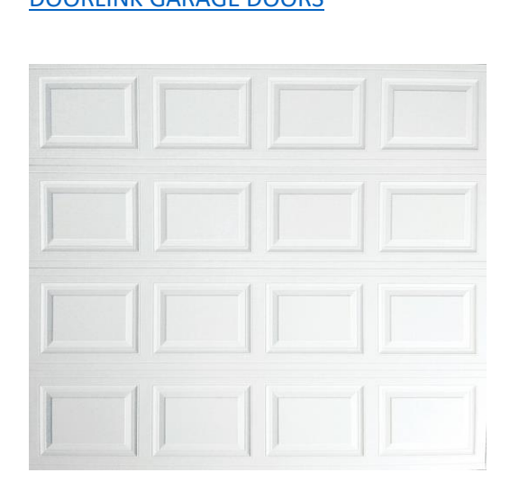
DOOR LINK GARAGE DOOR 410 WHITE DOORLINK GARAGE DOORS