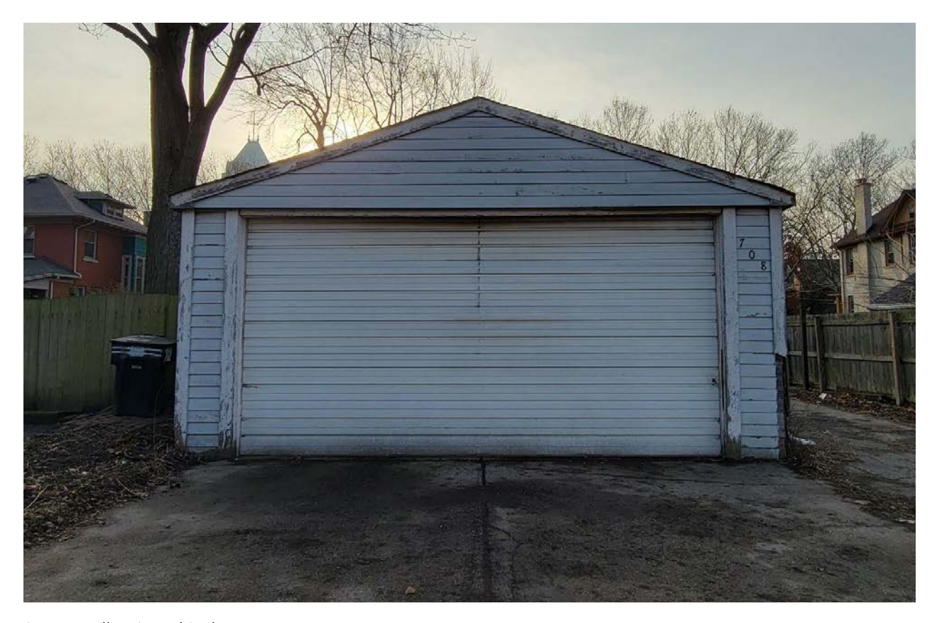
Garage Alley (North) Elevation