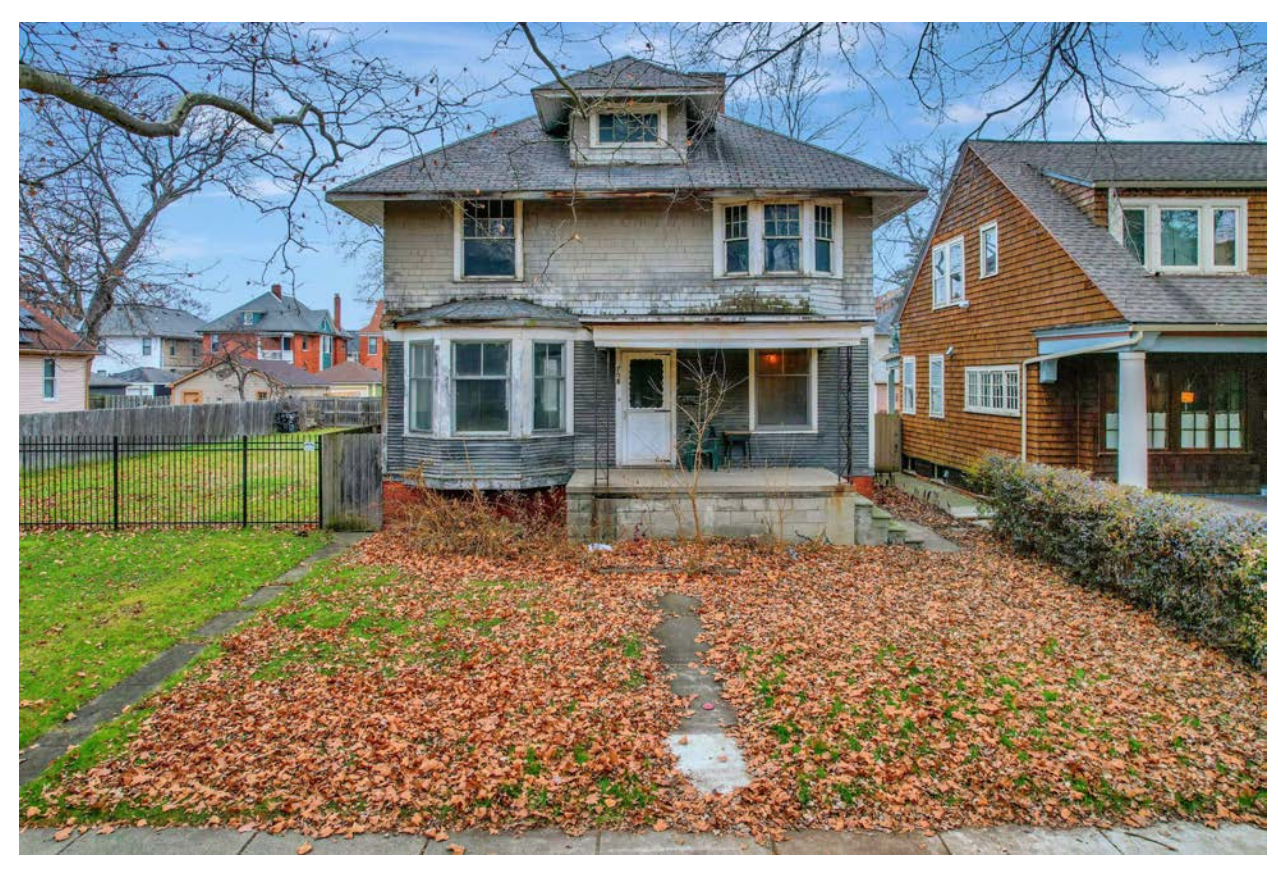
Front (South) Elevation

RE: 708 Pallister Exterior Renovations, Historic District Commission Submission