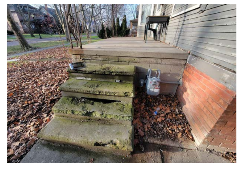
Front Porch Stair Detail