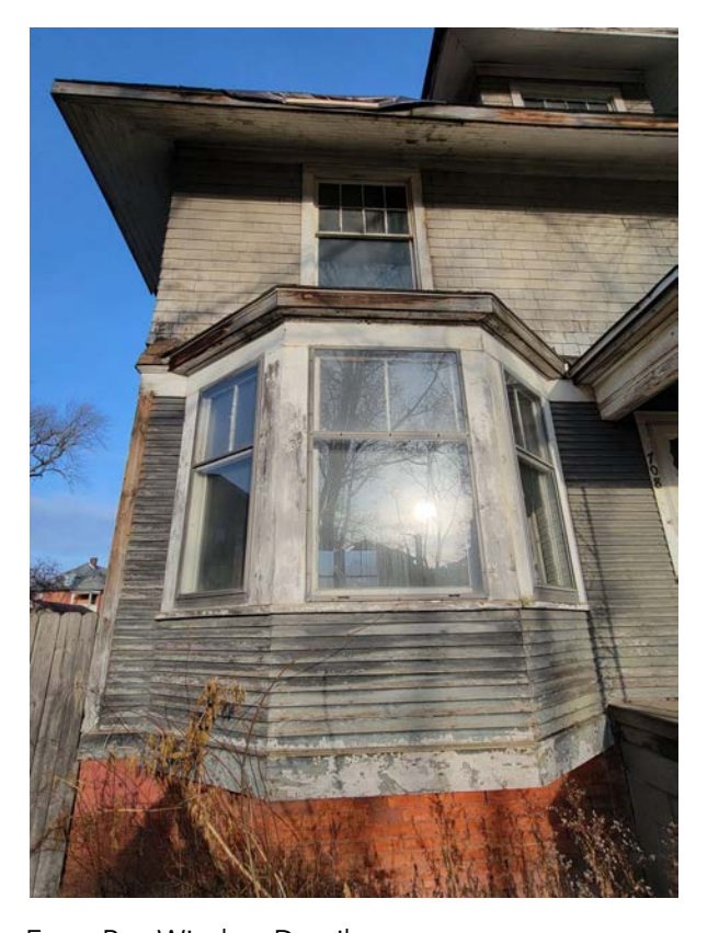
Front Bay Window Detail