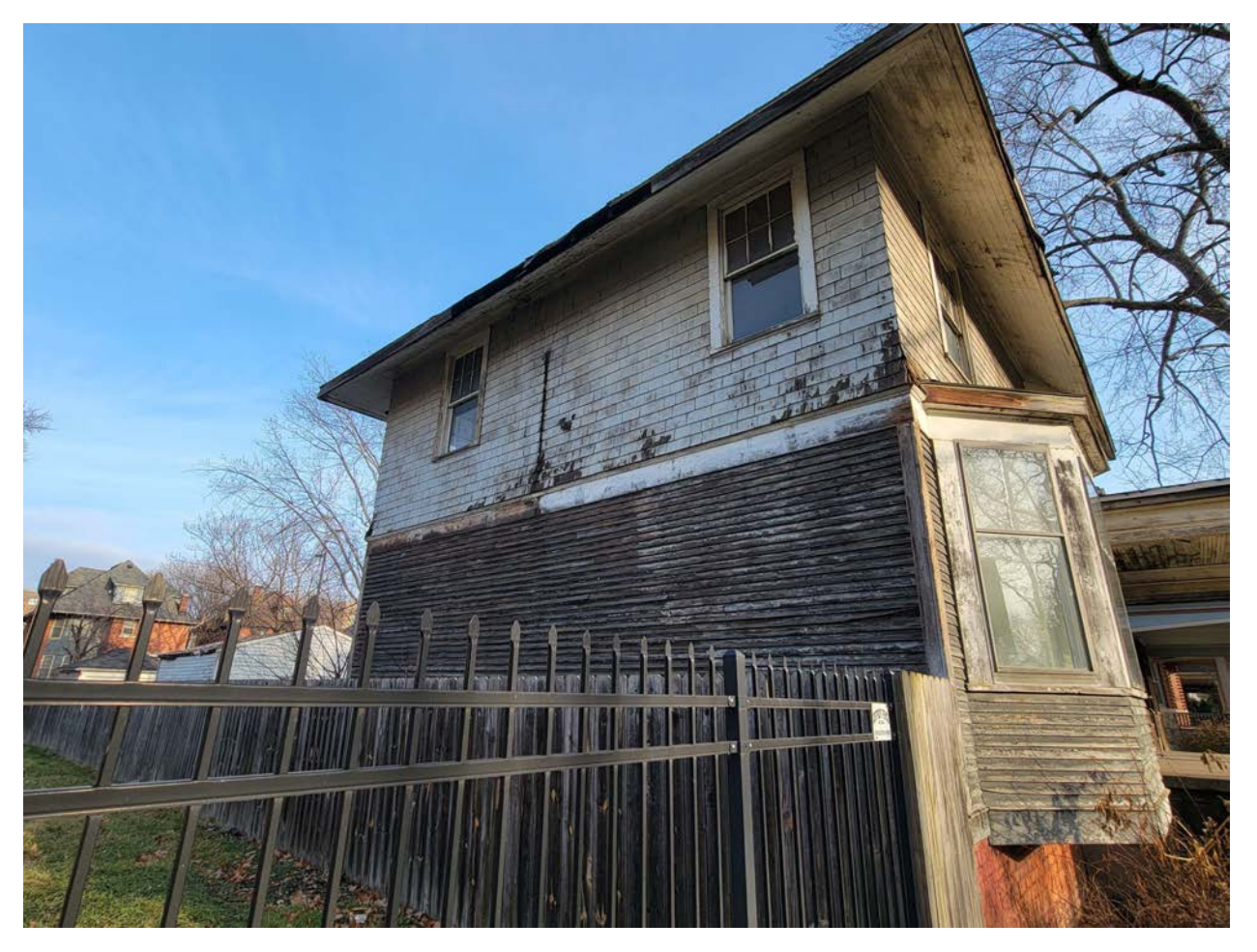
Side (West) Elevation