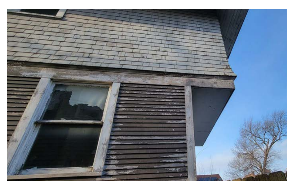
Rear Soffit Detail