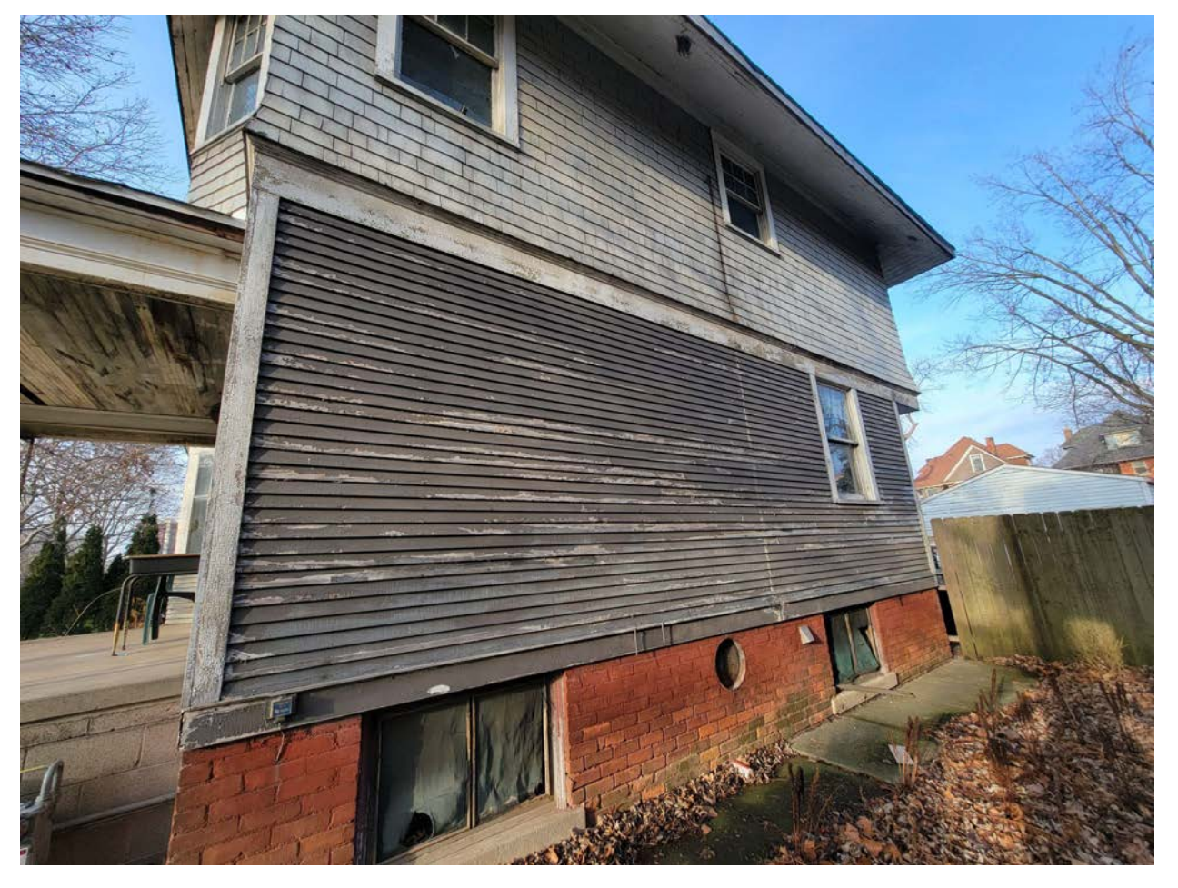
Side (East) Elevation