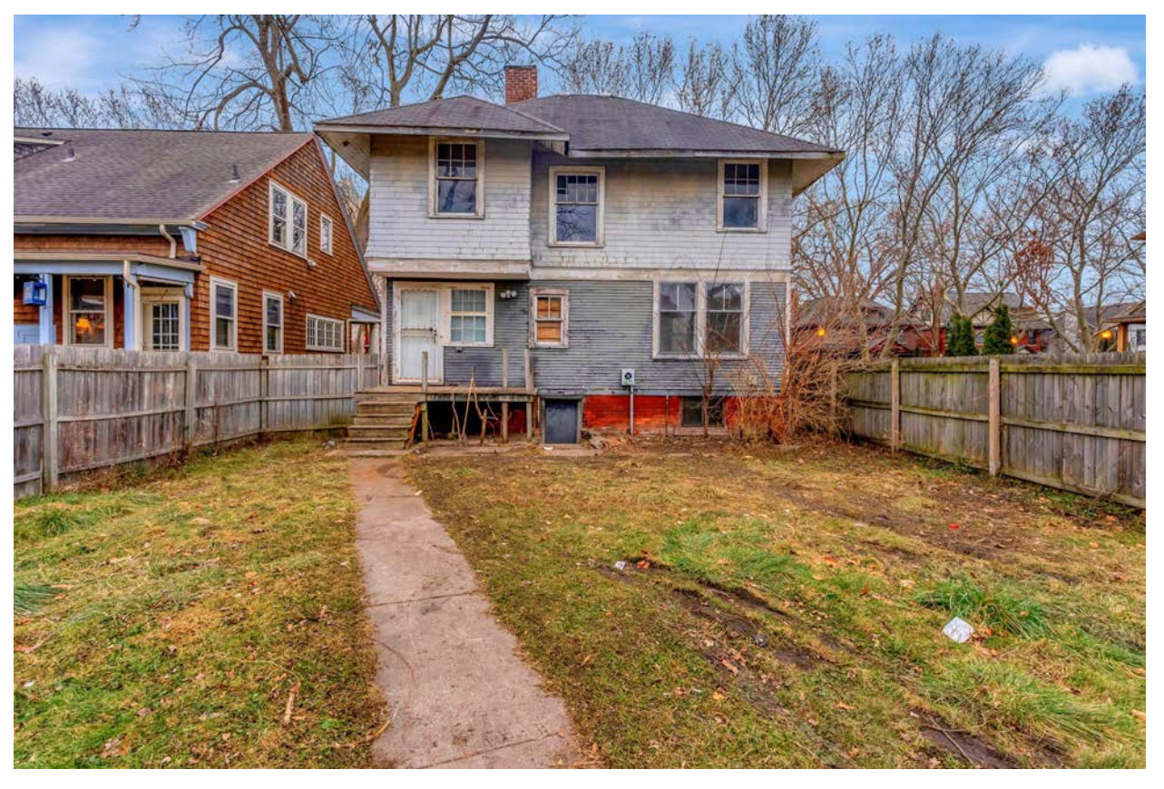
Rear (North) Elevation