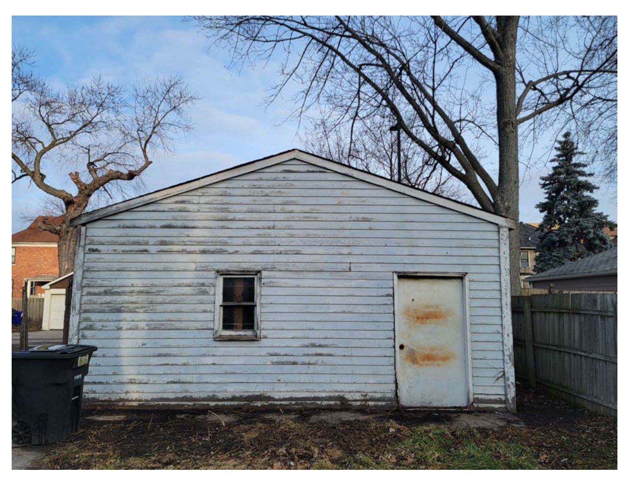
Garage Front (South) Elevation