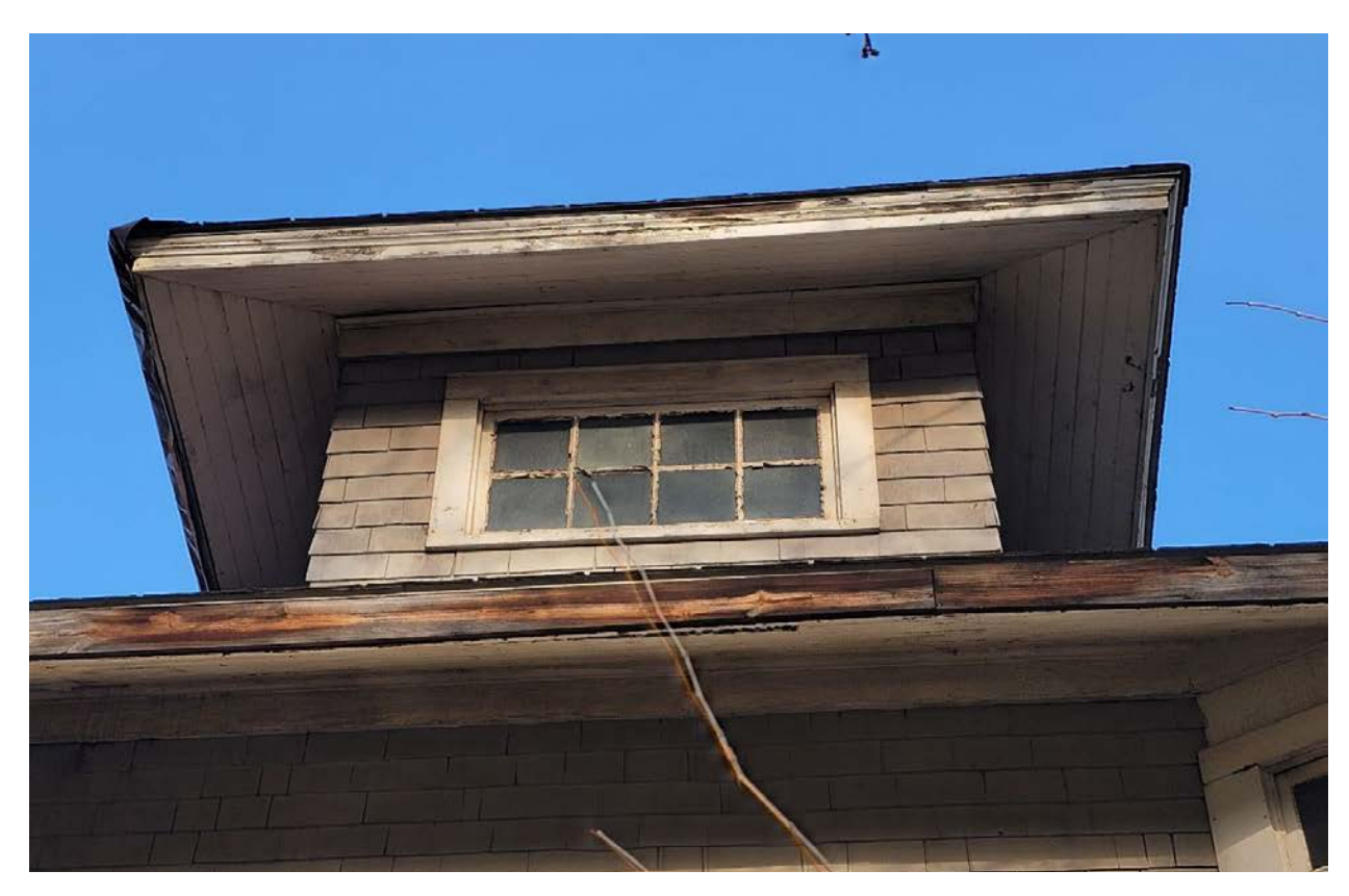
Front Dormer Detail