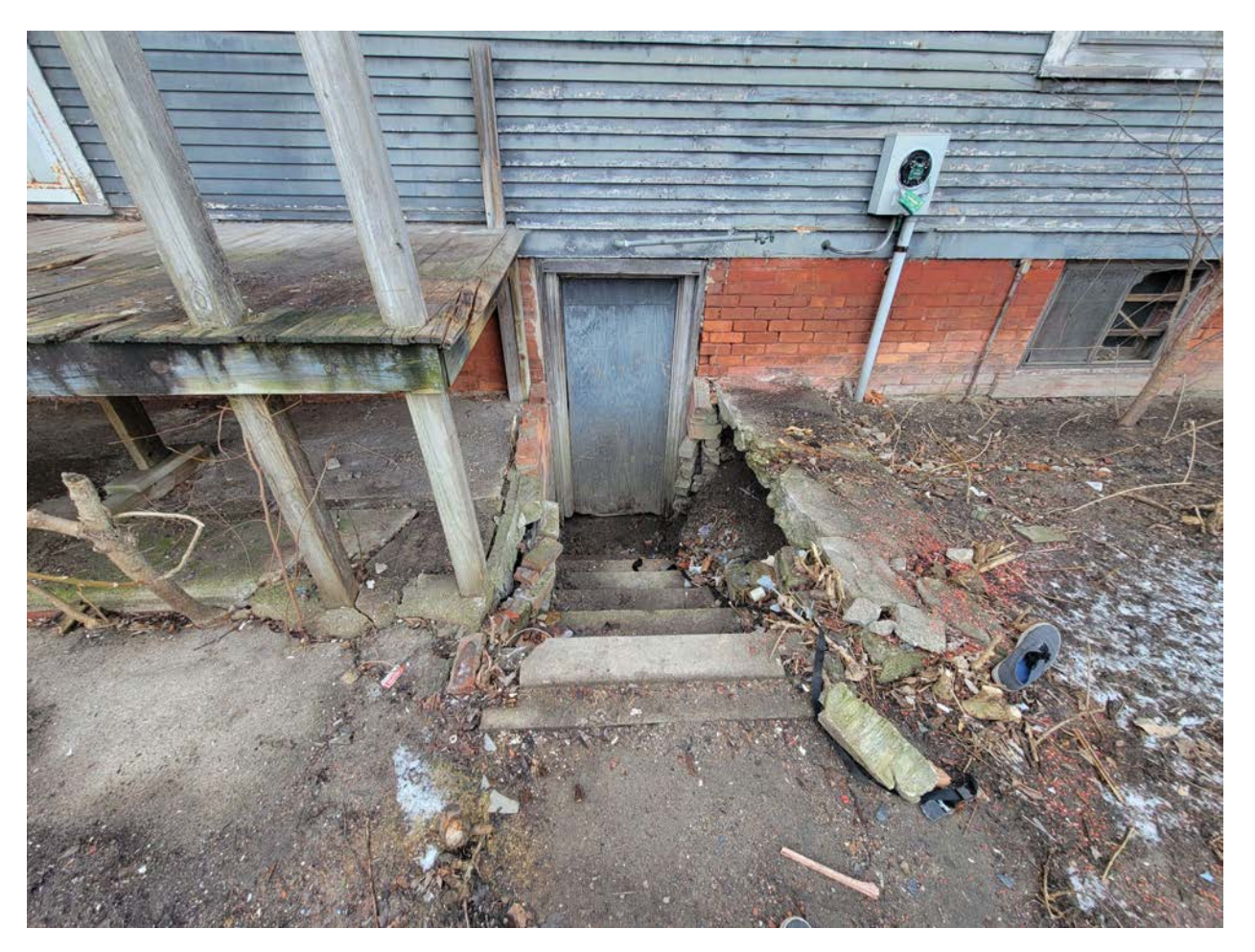
Basement Door Detail