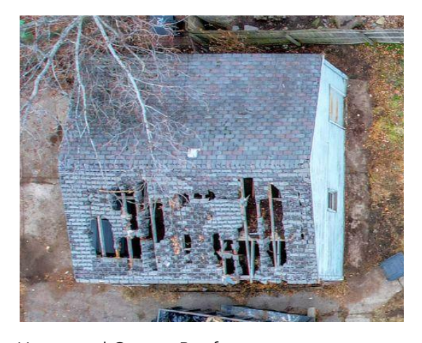
House and Garage Roof