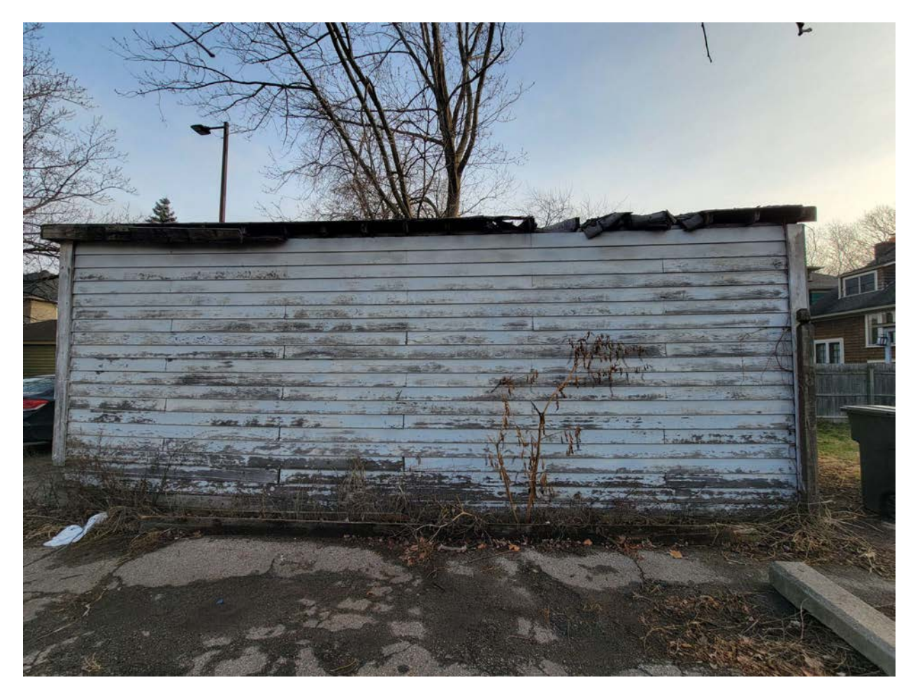
Garage Side (West) Elevation