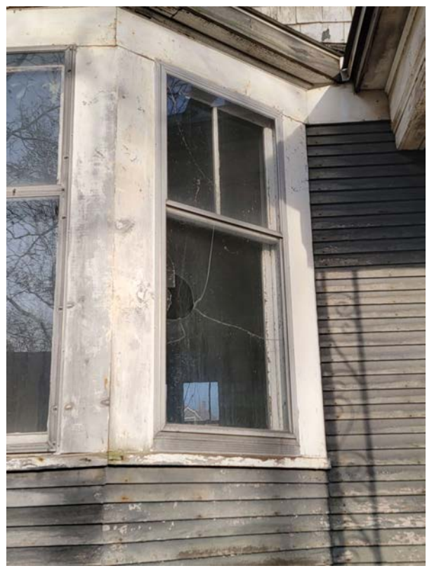
Front Window Detail