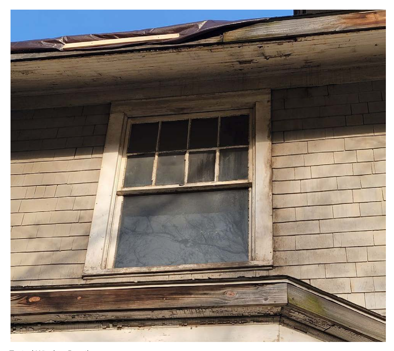
Typical Window Detail