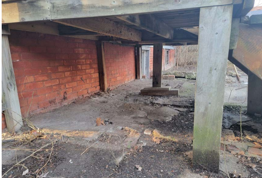
Rear Deck Details