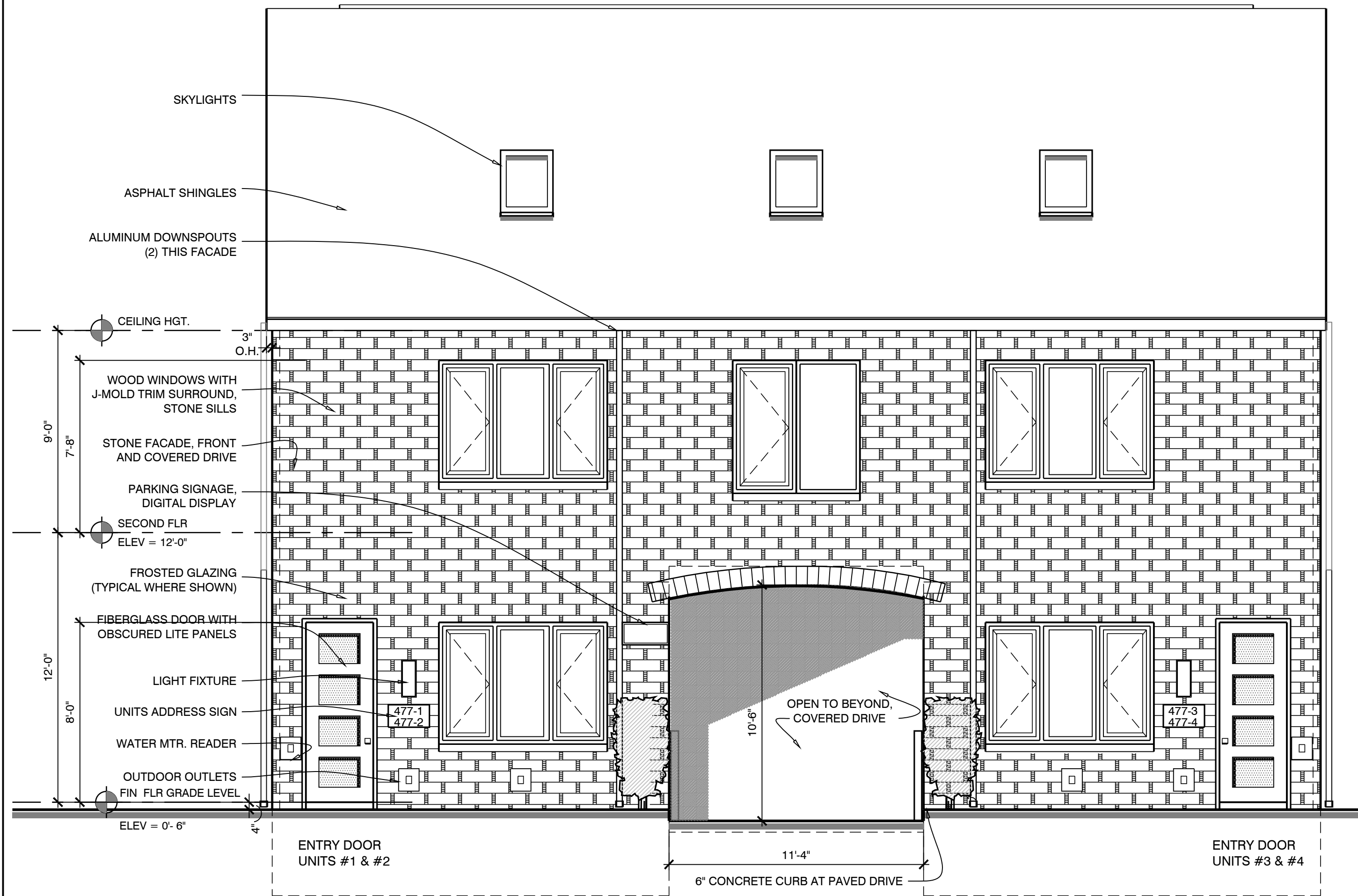
FRONT ELEVATION - NORTH SCALE: 1/4" = 1'-0"