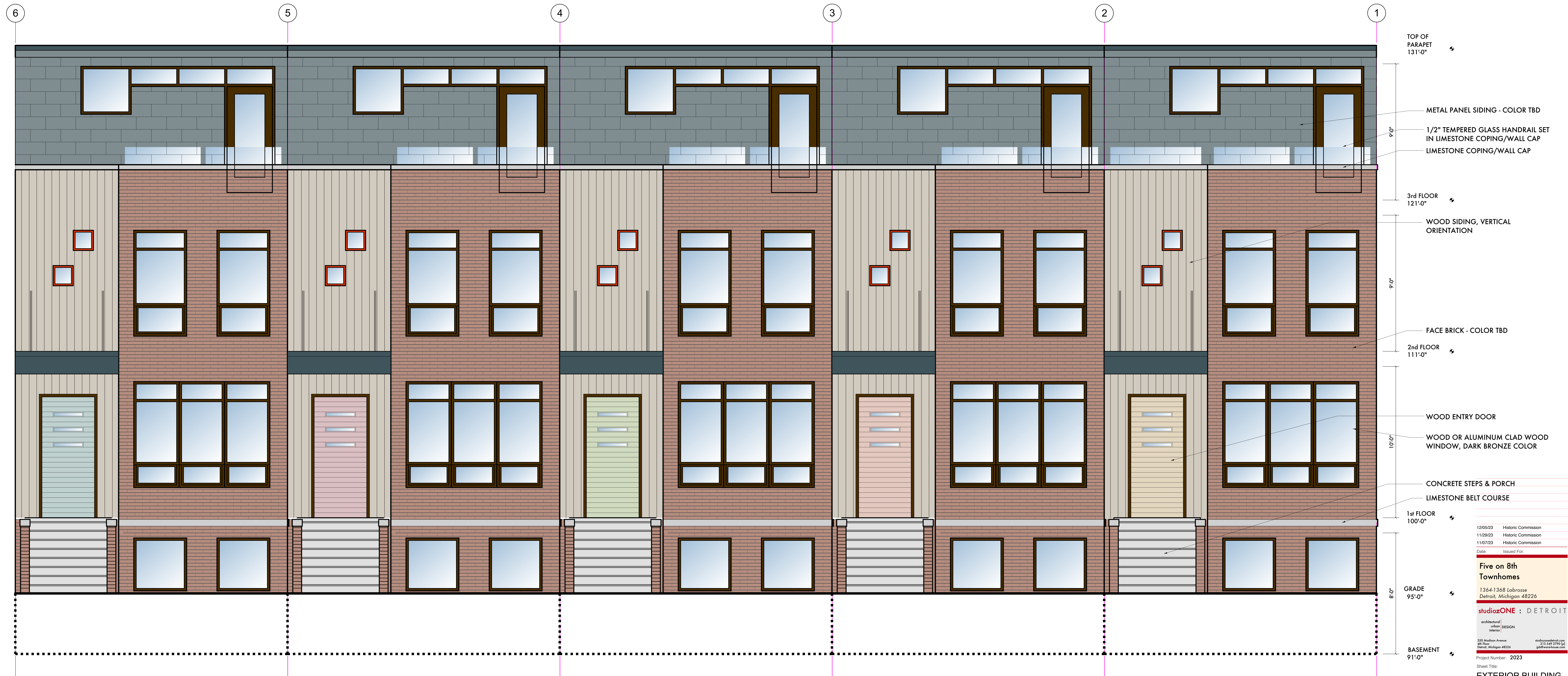
A WEST (8TH STREET) ELEVATION SCALE: 1/2" = 1'-0"