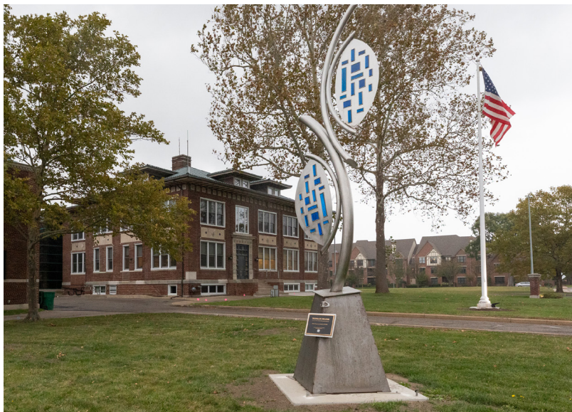
City of Grosse Pointe Park Civic Campus

Strengthen local communities through cross border collaboration strategies with improved cross walk experience, improved walkability, commitment to maintaining a safe and clean corridor through the JEI Block by Block Clean Team Ambassadors and participation in the annual Motor City Makeover.