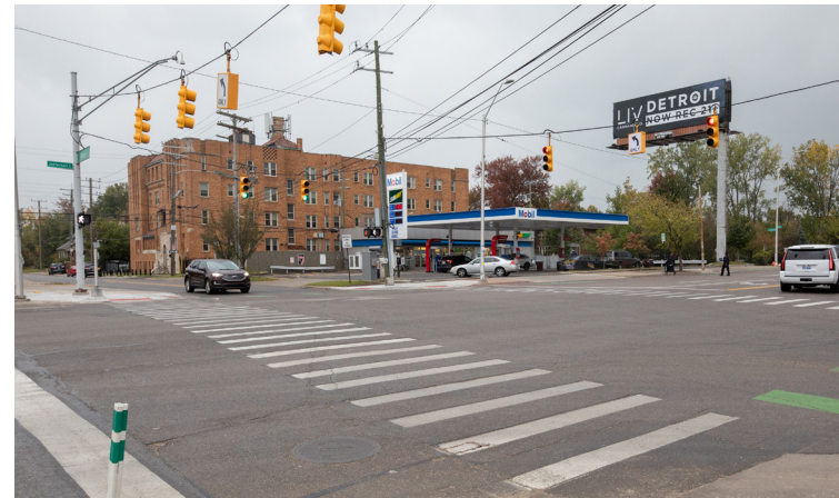
Mobile Gas Station - Southwest Corner