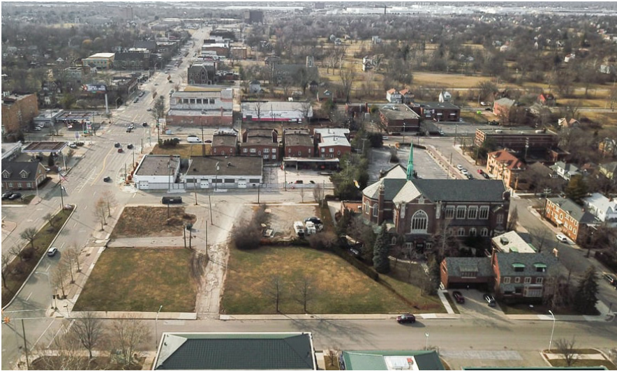
Project Site - April 2023