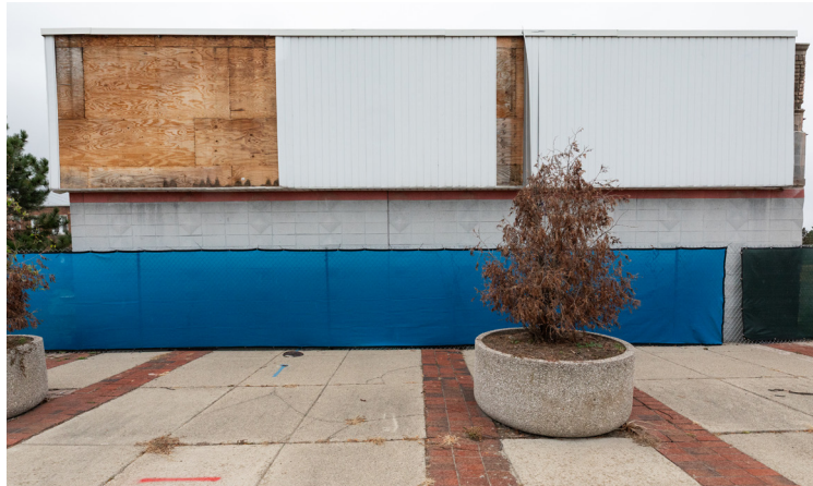
Streetview 14927 E. Jefferson