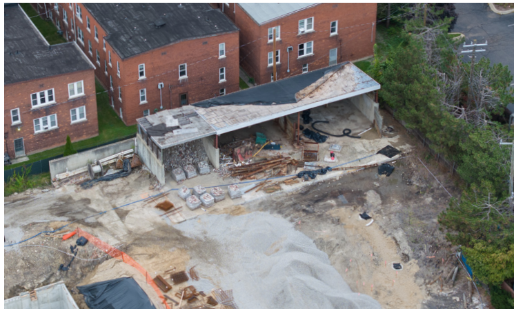
DPW Old Salt Shed