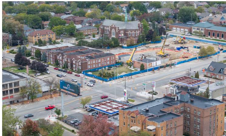
Aerial View of Intersection