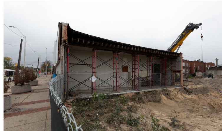
Saw Cut Old DPW Building