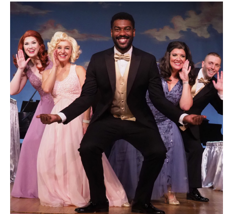
Performance photos from Grosse Pointe Theatre