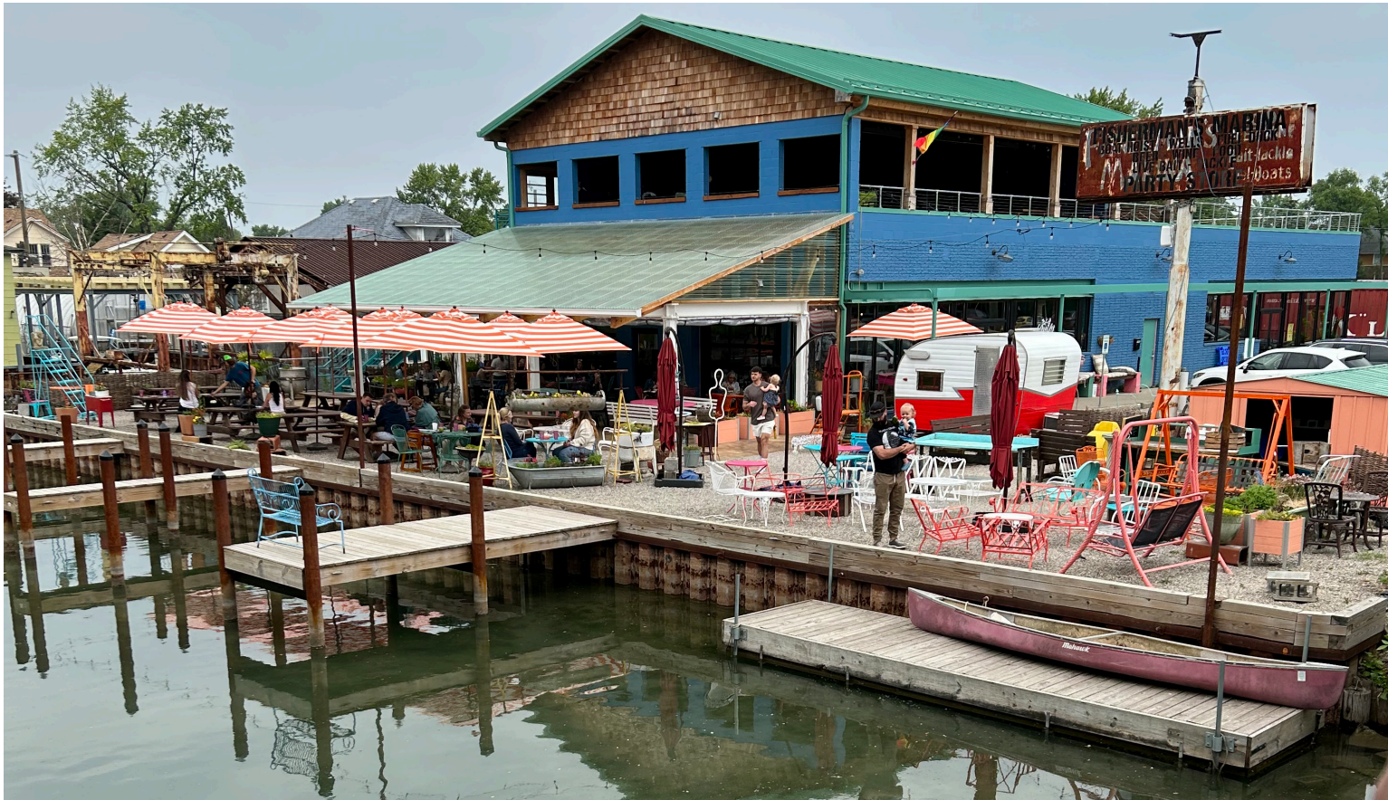
Coriander Kitchen & Farm - Jefferson Chalmers

Our vision is to unite the two communities of Detroit and Grosse Pointe into one community with no boundary that only strengthens and stabilizes a crucial corridor. We have been developing meaningful relationships and partnerships with cultural community partners, civic leaders, Jefferson East Inc., Eastside Community Network, and the City of Grosse Pointe Park to secure investment and philanthropic support of the East Jefferson corridor which has anchored this project since its inception.