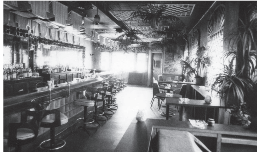
The Deck Bar Interior