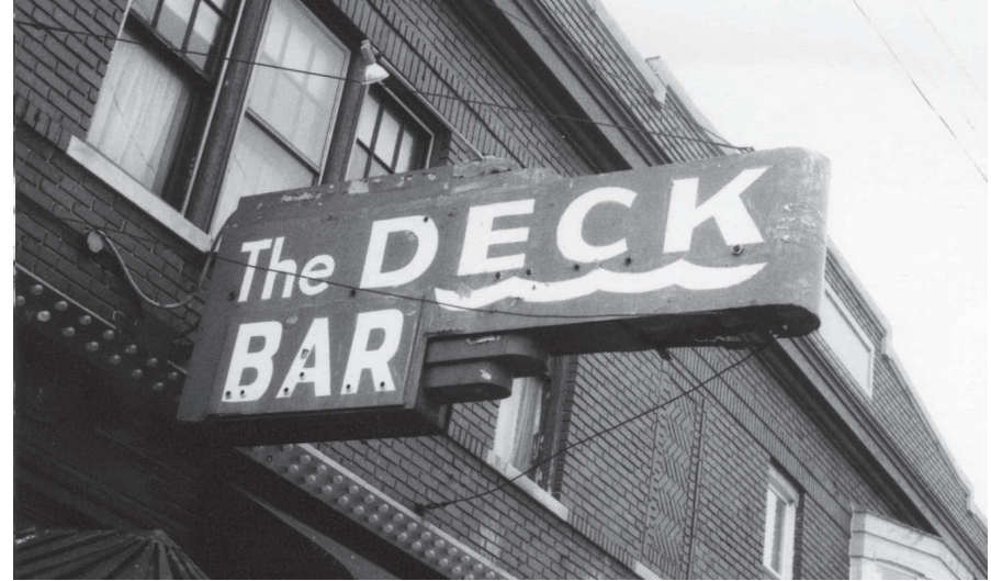
The Deck Bar Sign

In 2015, the City of Grosse Pointe Park was issued a permit and demolished the Deck Bar building located at 14901 E. Jefferson. The Schaap Center and its donors had no involvement in the steps that were taken by the City of Grosse Pointe Park.