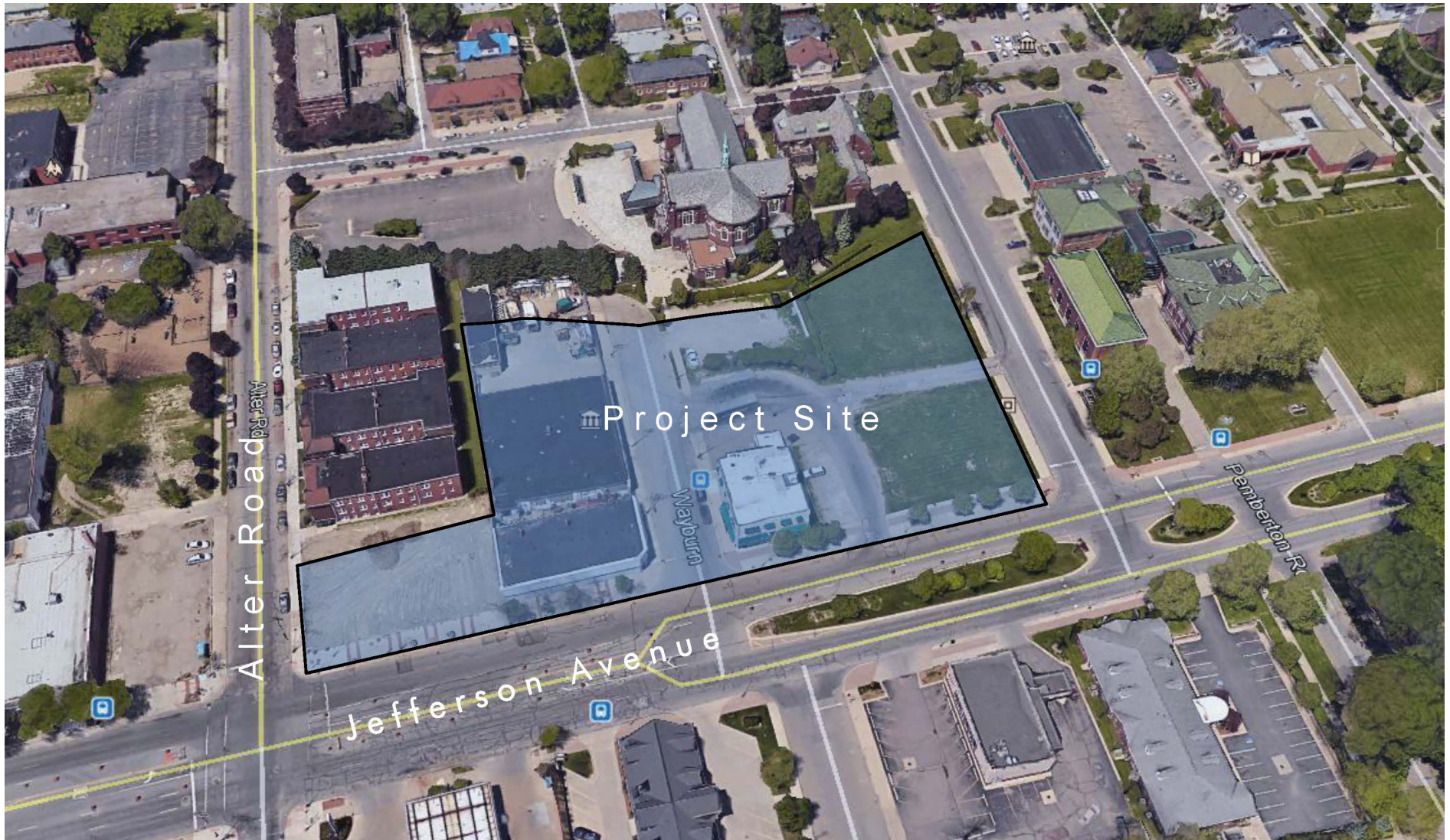
Aerial View of Project Site