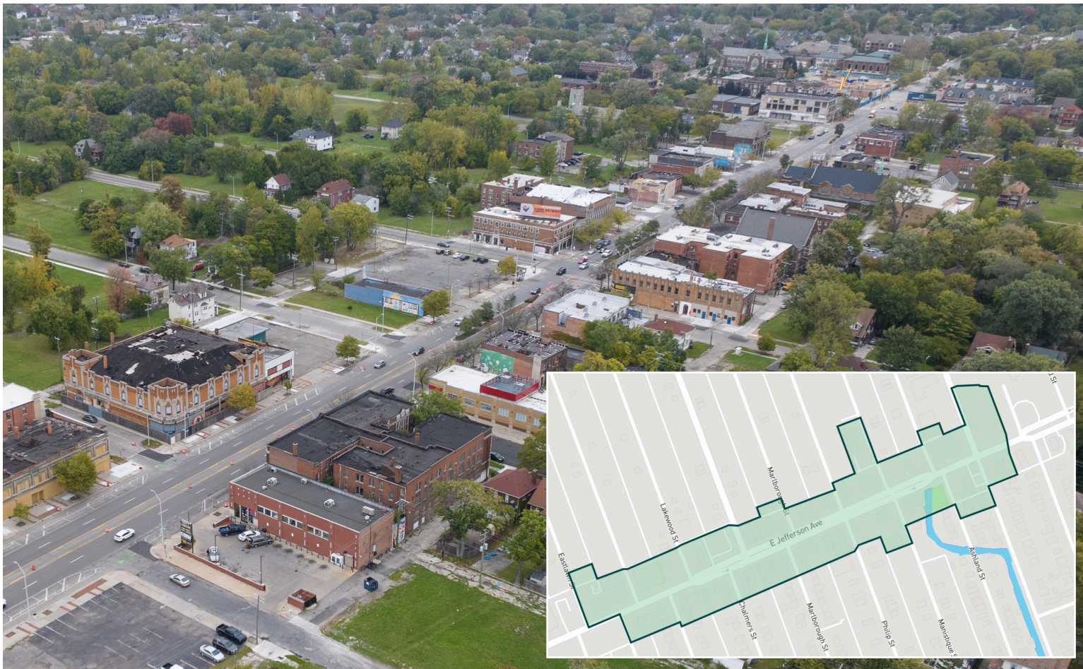
Aerial View of Jefferson Chalmers District and Local Historic District Map

Rehabilitation of the gateway to Detroit's Jefferson-Chalmers Historic Business District to enhance the historic pedestrian character of the district and historic character of the property. Improvements to E. Jefferson Avenue are necessary, as it is one of the main arterials leading downtown from Jefferson Chalmers and the suburbs. It is also an integral commercial corridor for the neighborhood, and contains a designated historic district, with significant architecture and a growing local business district.