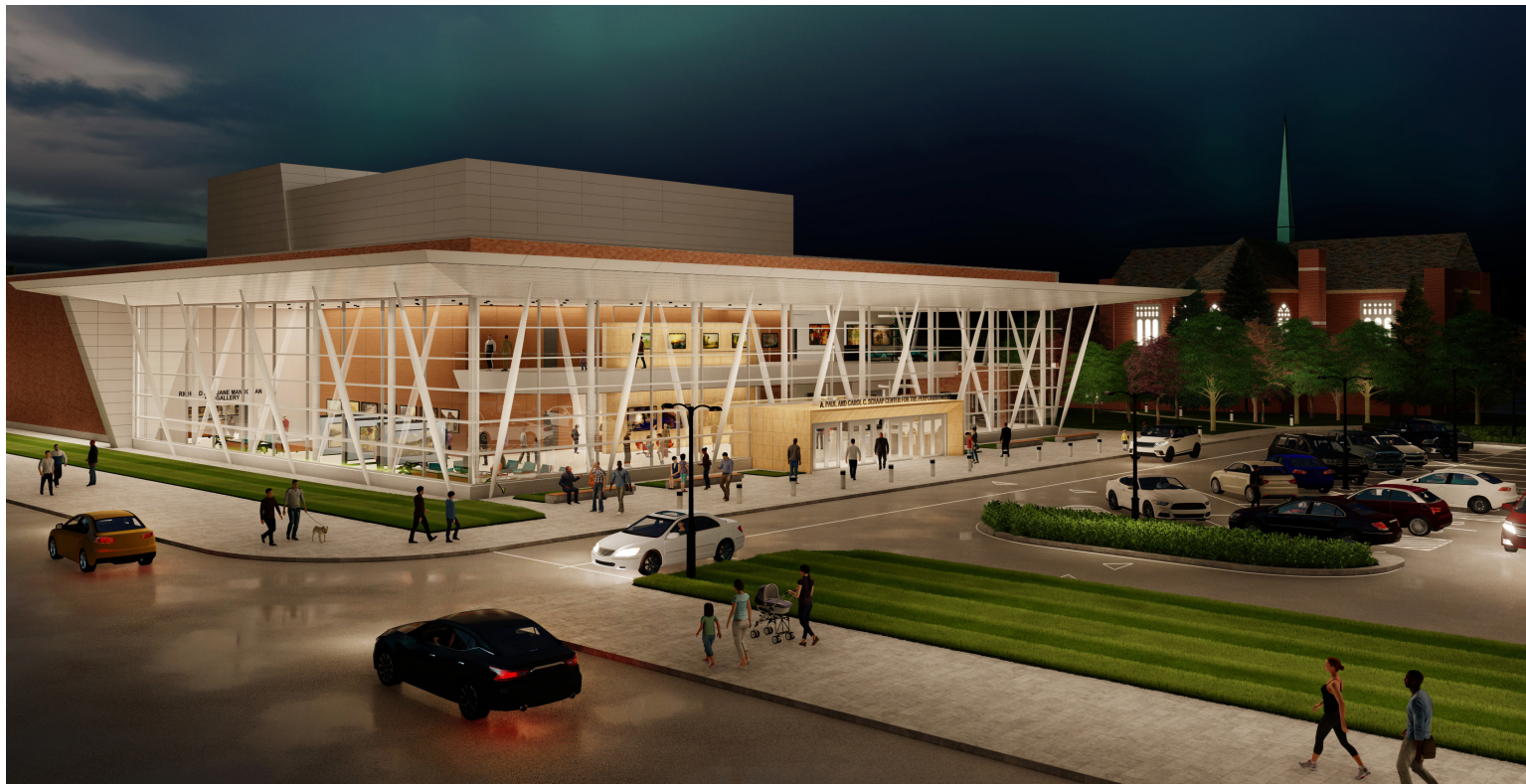
Schaap Center Night Rendering