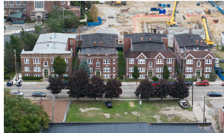
Apartments at The Bridge