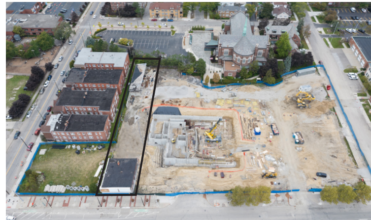
Project Site Aerial