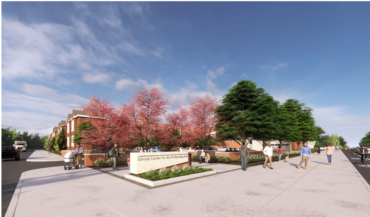
View From Jefferson Ave/Alter Rd Intersection

Embraced by an architectural brick and stone garden wall, the gathering plaza provides comfortable bench seating overlooking an active Jefferson Avenue, lush planting beds filled with native plants and flowers and beautiful specimen trees that give a sense of color, enclosure, and importance. Historic brick cobbles from the Detroit Streetcar Railway system will be used for paving along with a tasteful architectural sign marking the Schaap Center project.