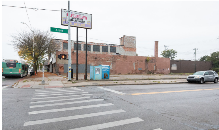
Future Development - Northwest Corner