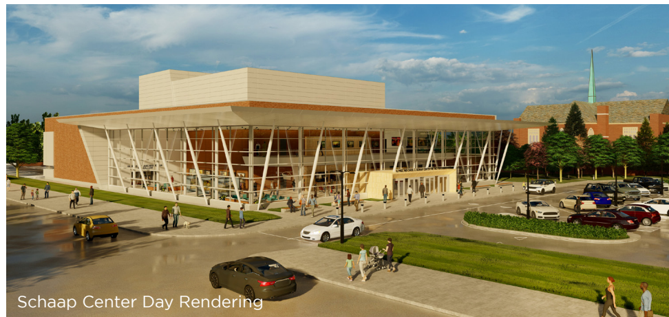
Schaap Center Day Rendering