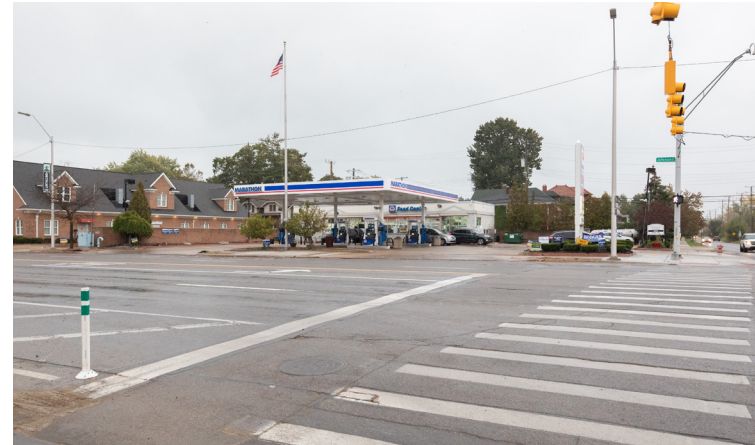
Marathon Gas Station - Southeast Corner