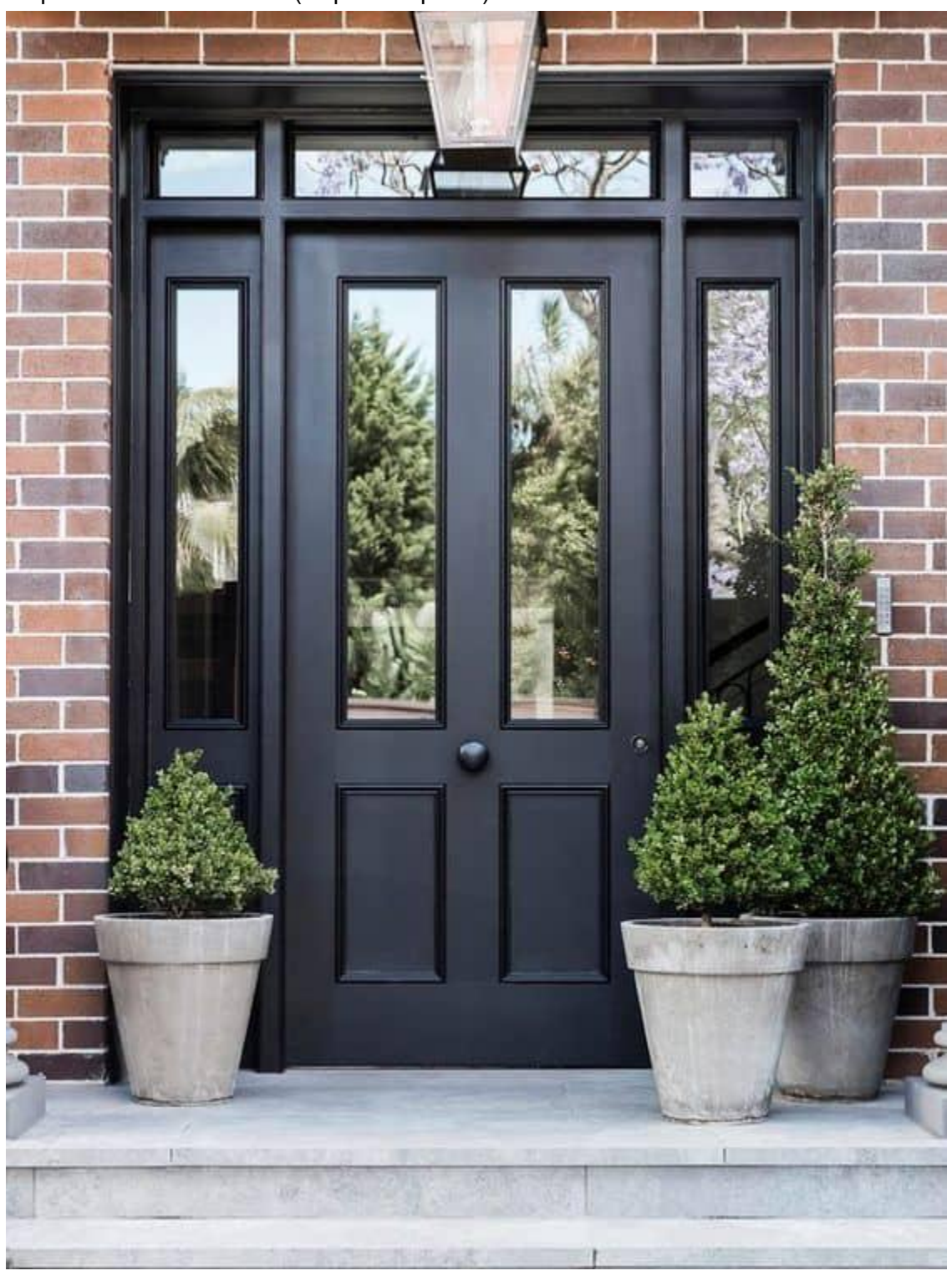
Proposed New Front Door (inspiration photo):