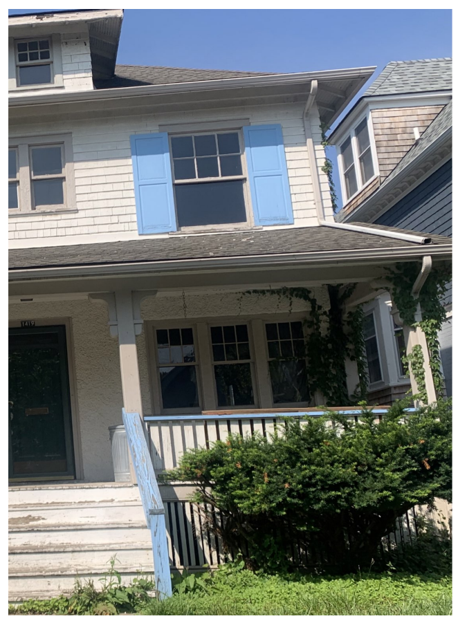
WINDOW#1#2#3. Double-Hung Windows with 21 lites (7 per sash)