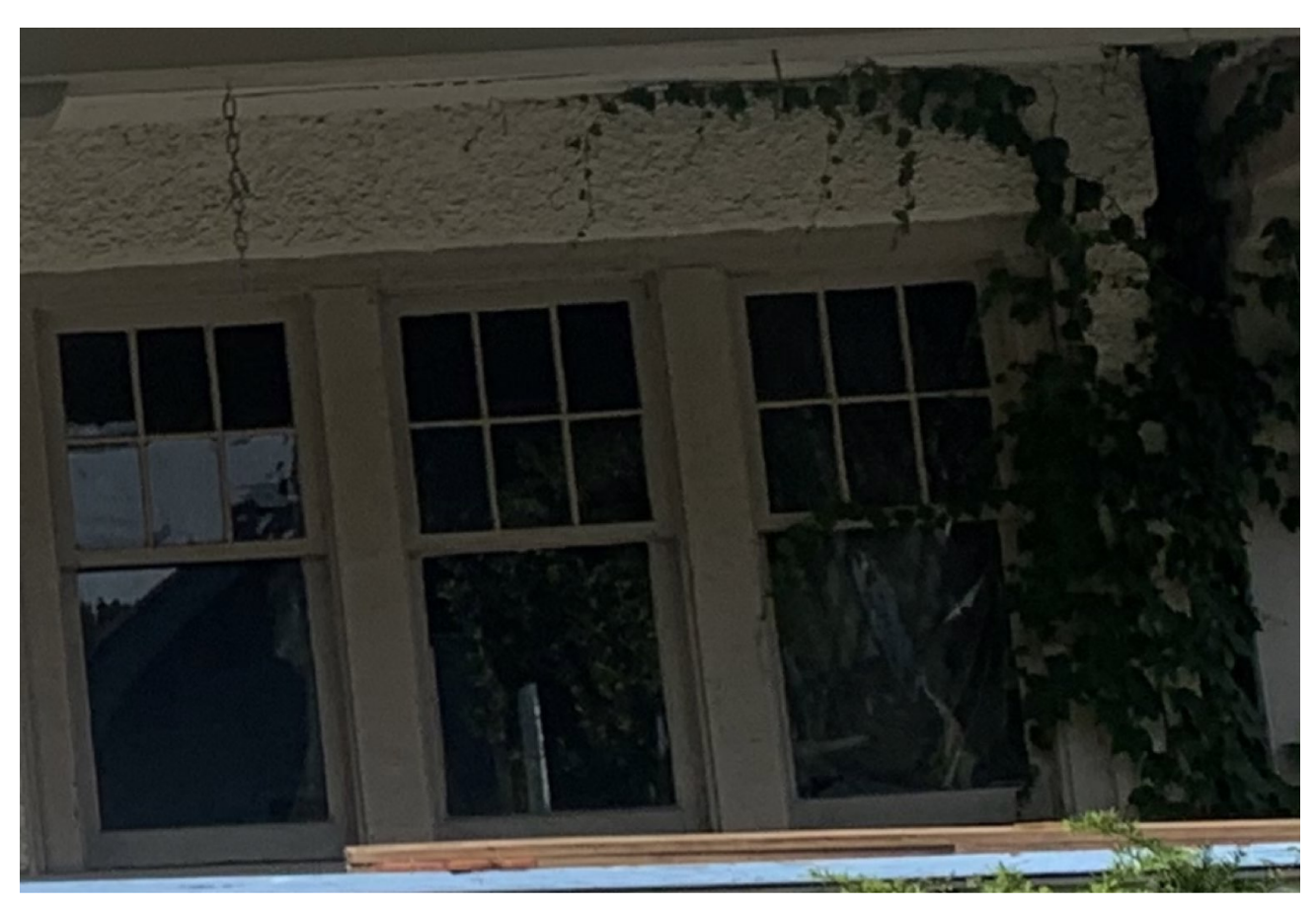
WINDOW#1#2#3. Exterior view.