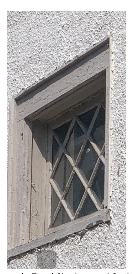
WINDOW#5#6. Exterior Framework. Fixed Single wood Sash with 17 diamond shape lites.