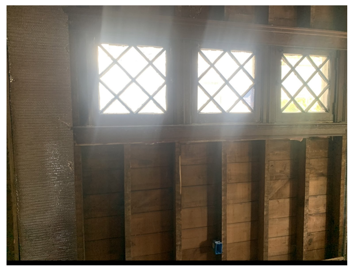
WINDOW#14#15#16. Fixed Single wood Sash with 36 diamond shape lites. (12 per sash).