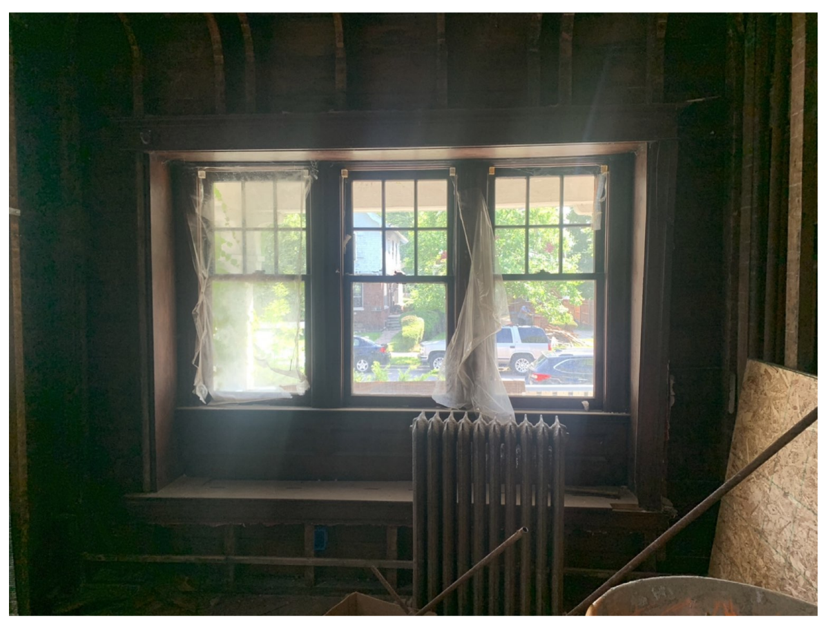
WINDOW#1#2#3. Interior view. 6-1.