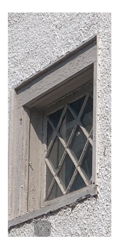
Page 11 of 12