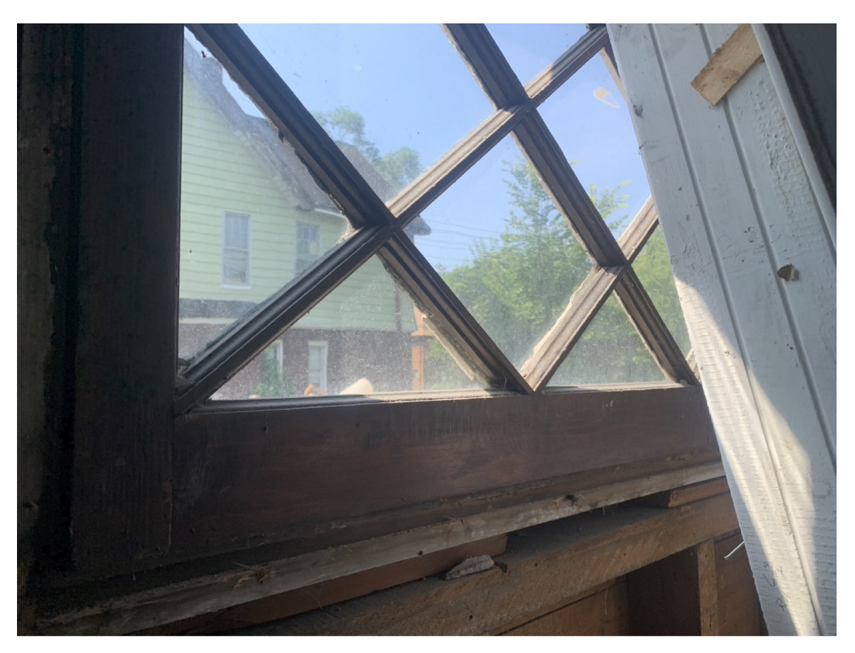
WINDOW#5. Fixed Single wood Sash with 17 diamond shape lites.