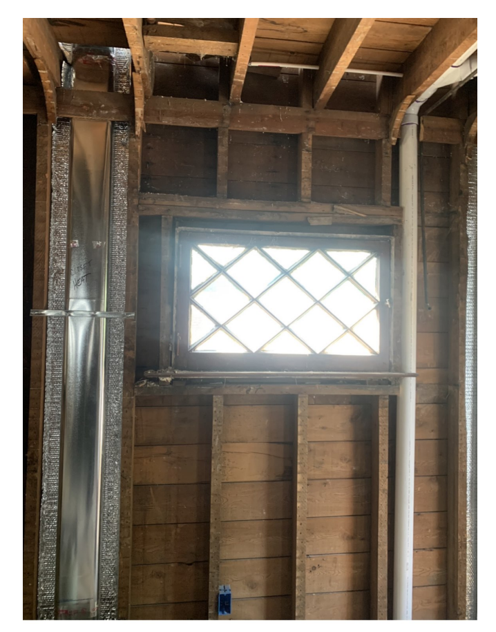
WINDOW#6. Fixed Single wood Sash with 17 diamond shape lites.