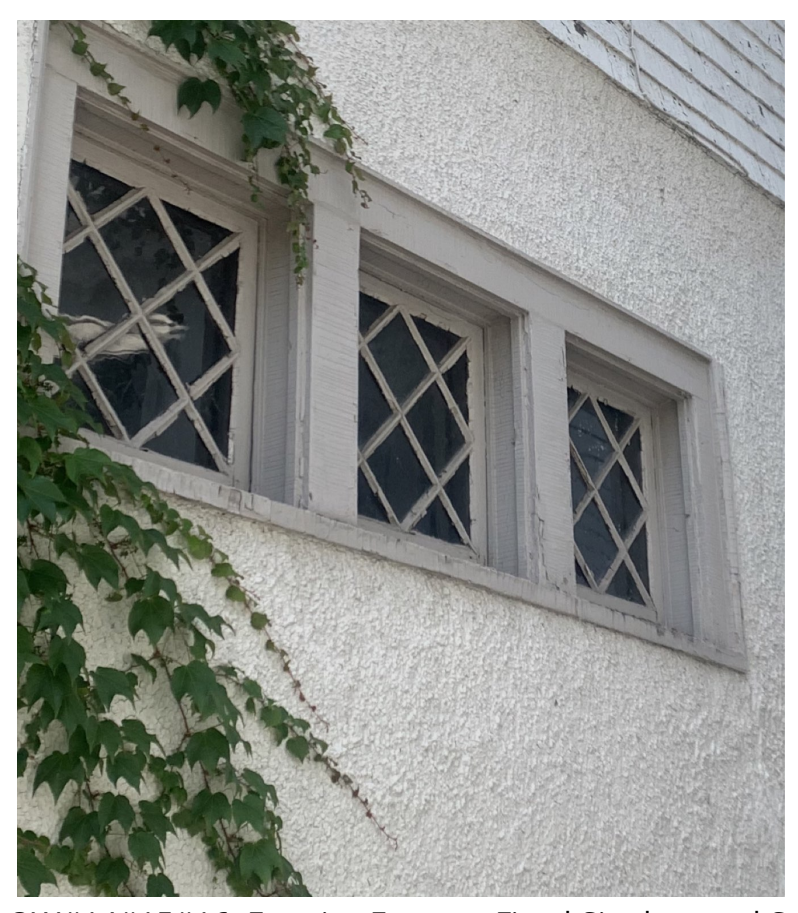
WINDOW#14#15#16. Exterior Frames. Fixed Single wood Sashes.