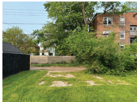
West view looking towards the alley.