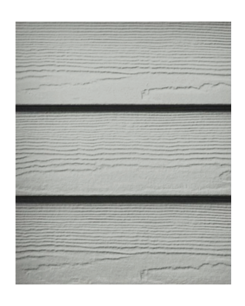
SIDING James Hardie Cement Board COLOR B:14 Dark Grayish, Olive MS: 10Y 2/2, Color System E, to match house.