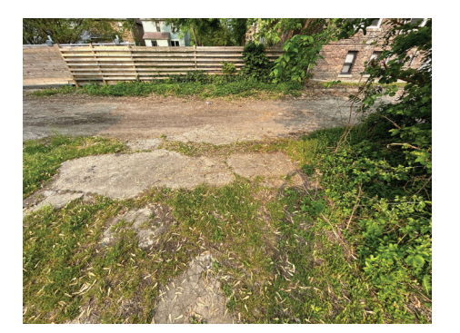
Existing dilapidated cement pad.