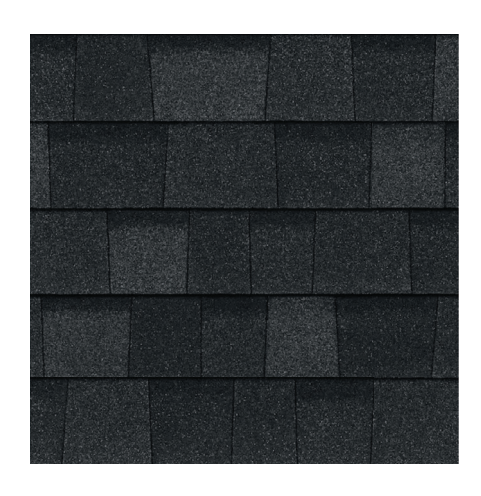
ROOF Owens Corning Onyx Black Architectural shingle, to match new house shingles.