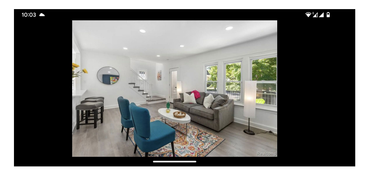
Front view first floor (3 windows)