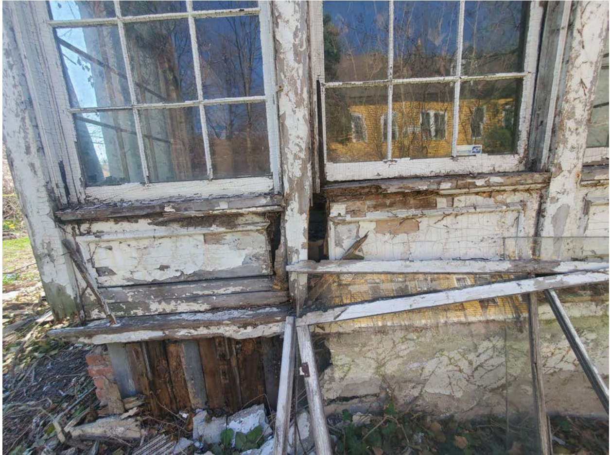
Typical Damage to Bay Window