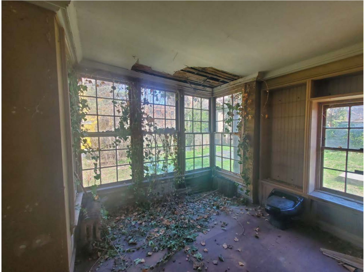
Bay Window Interior