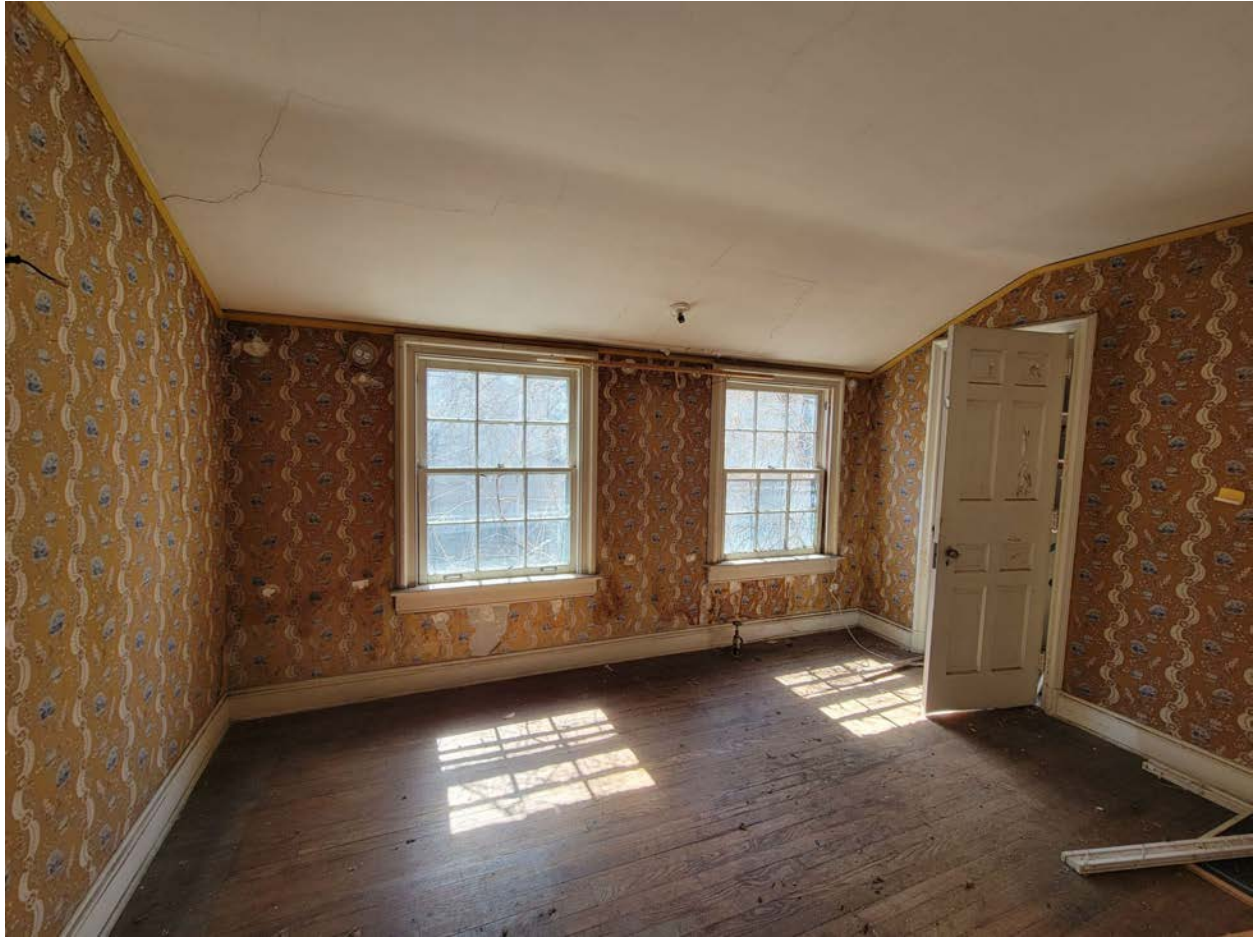
2nd Floor Bedroom 3