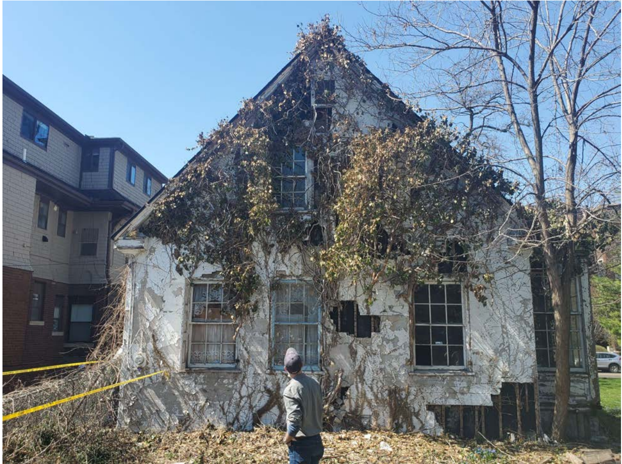
Existing Rear (East) Elevation