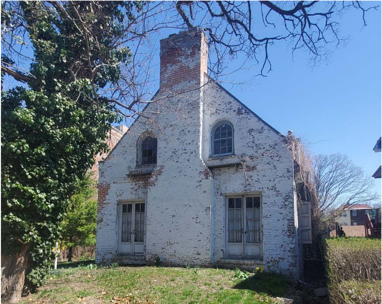
Existing Front (West) Elevation

RE: 1108 Van Dyke Residential Renovations, Historic District Commission Submission