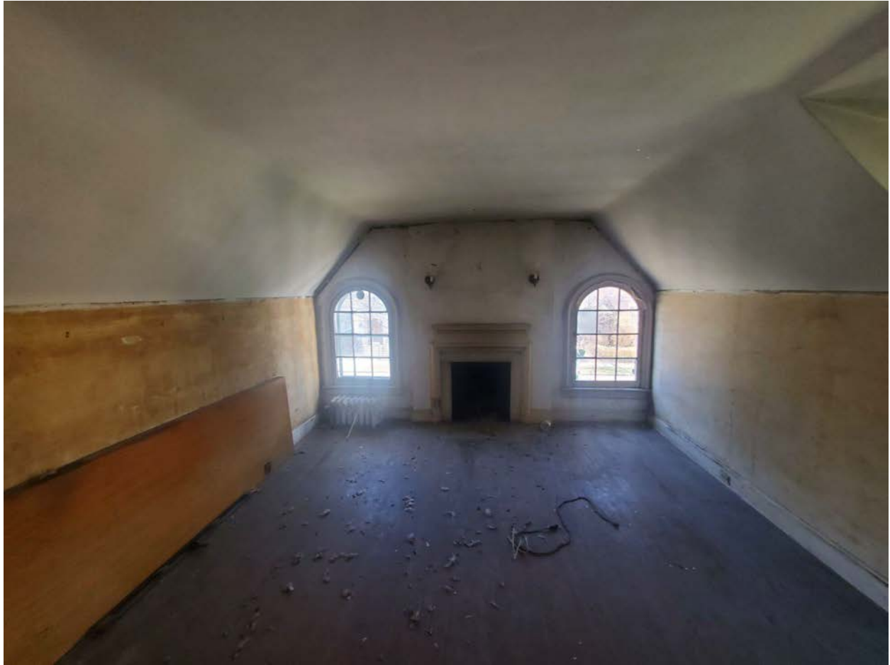
2nd Floor Bedroom 1