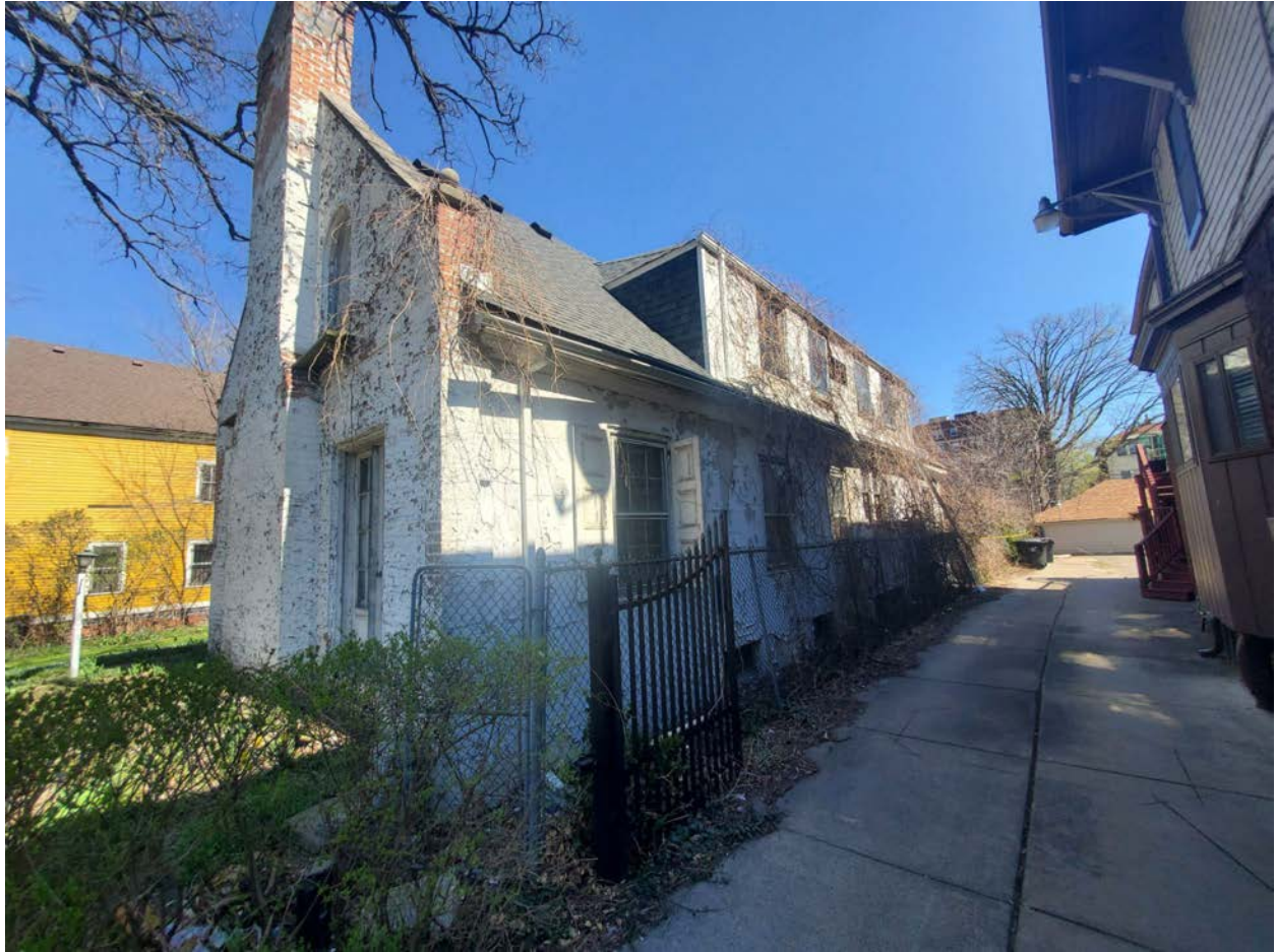
Existing Side (South) Elevation