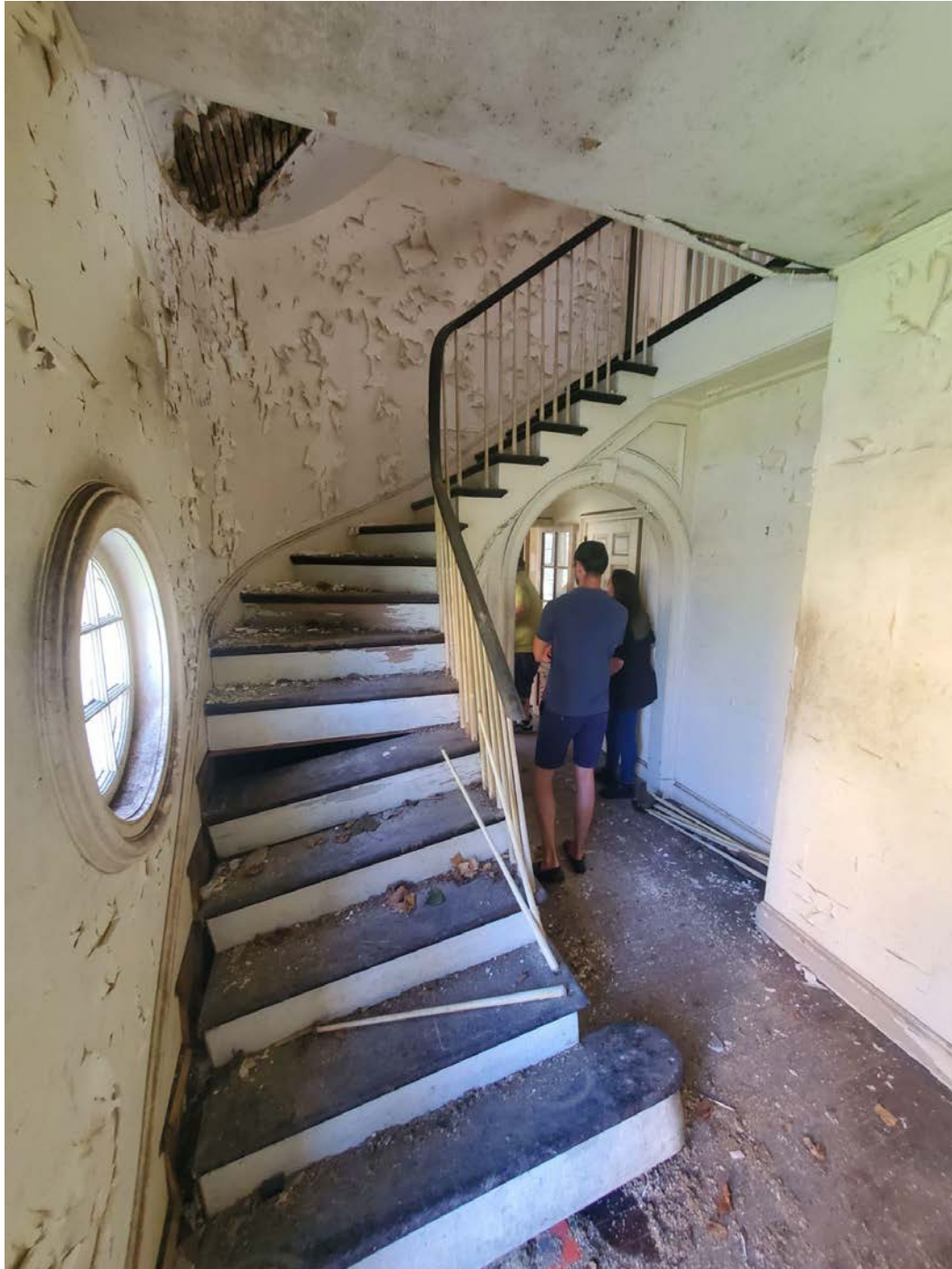
Entry Stair Detail