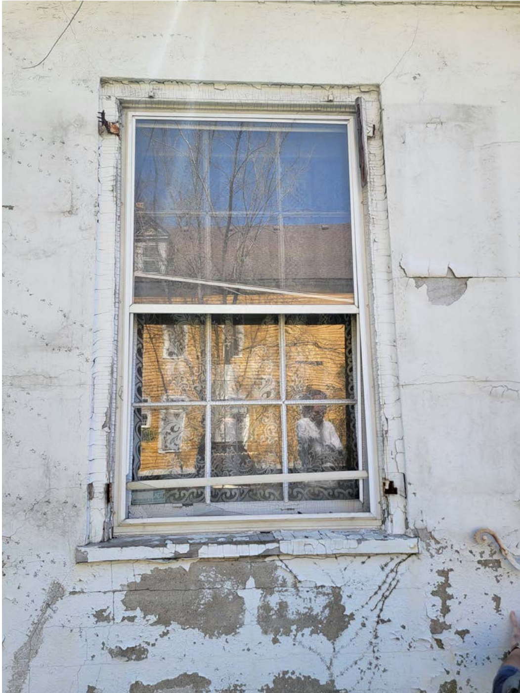
Typical Window Detail