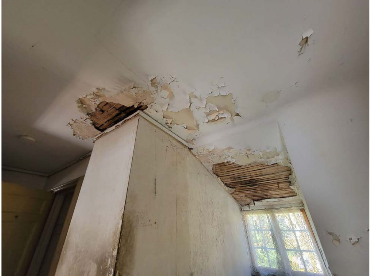
Typical Ceiling Damage Detail