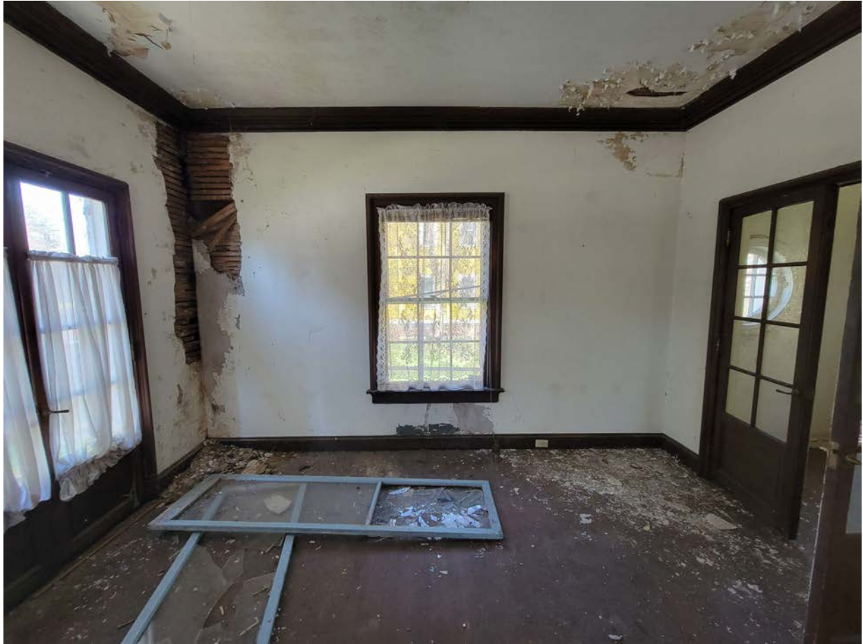
Living Room Detail, Typical Damage to Interior Wall