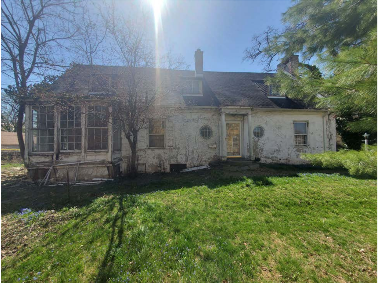
Existing Side (North) Elevation