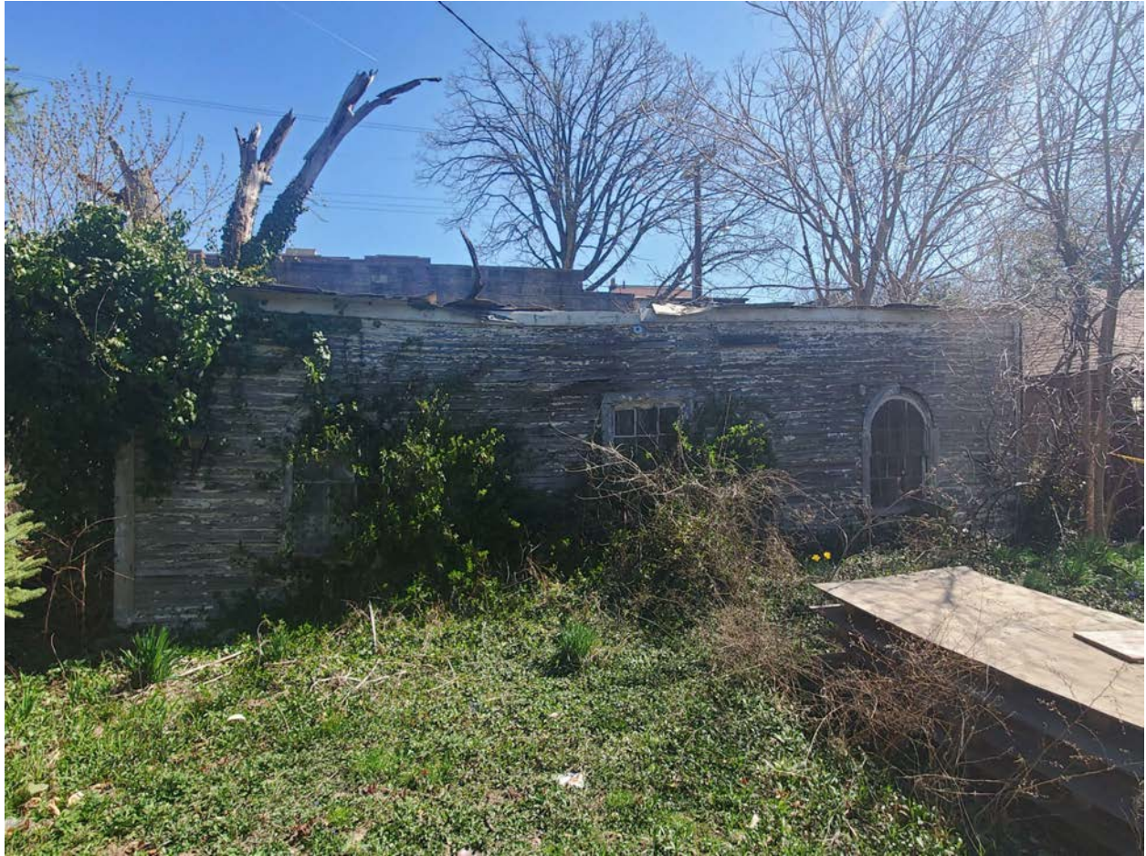
Garage West Elevation