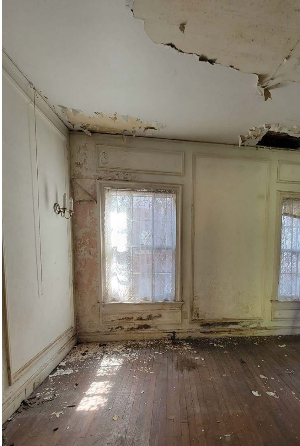
Sitting Room Detail