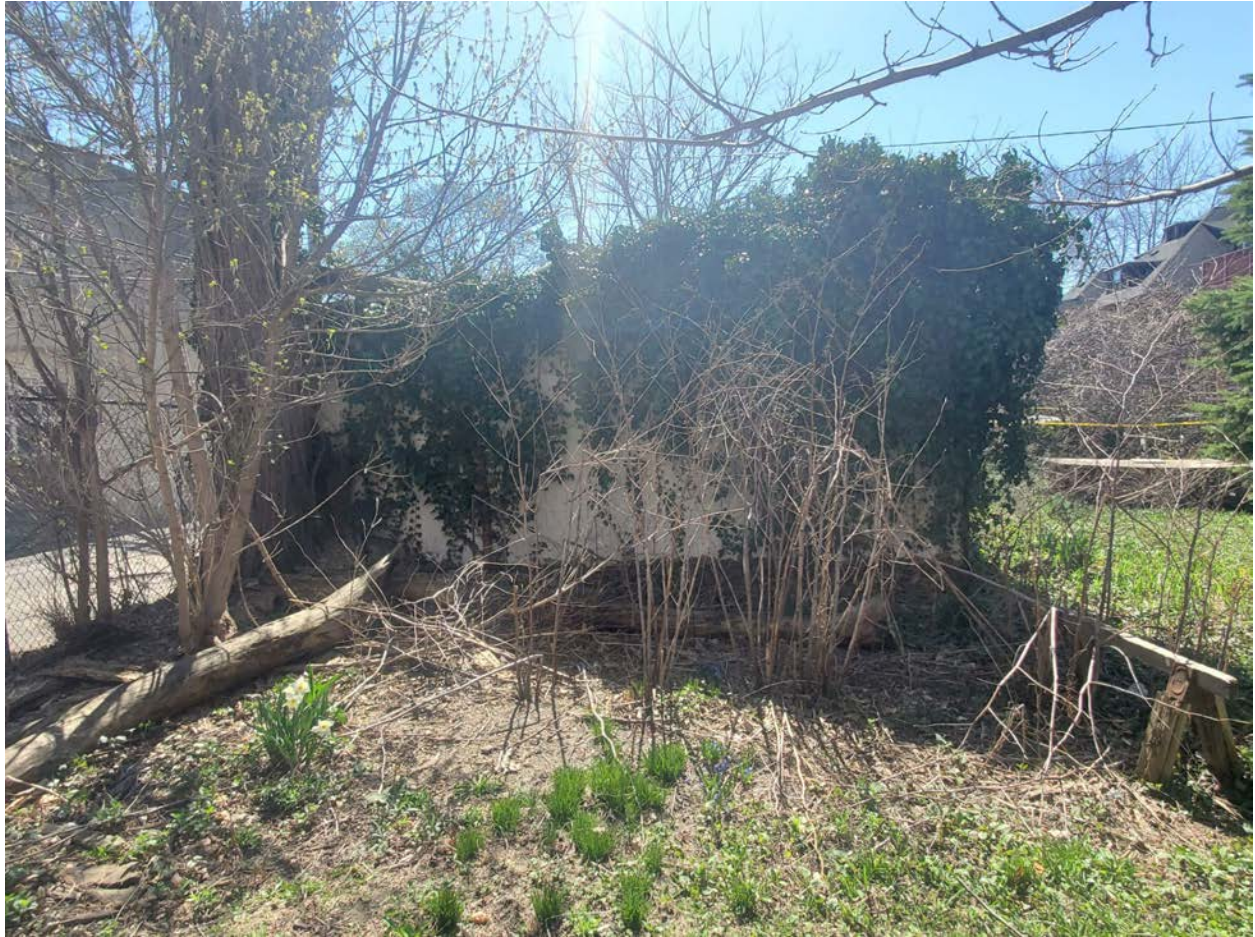
Garage North Elevation