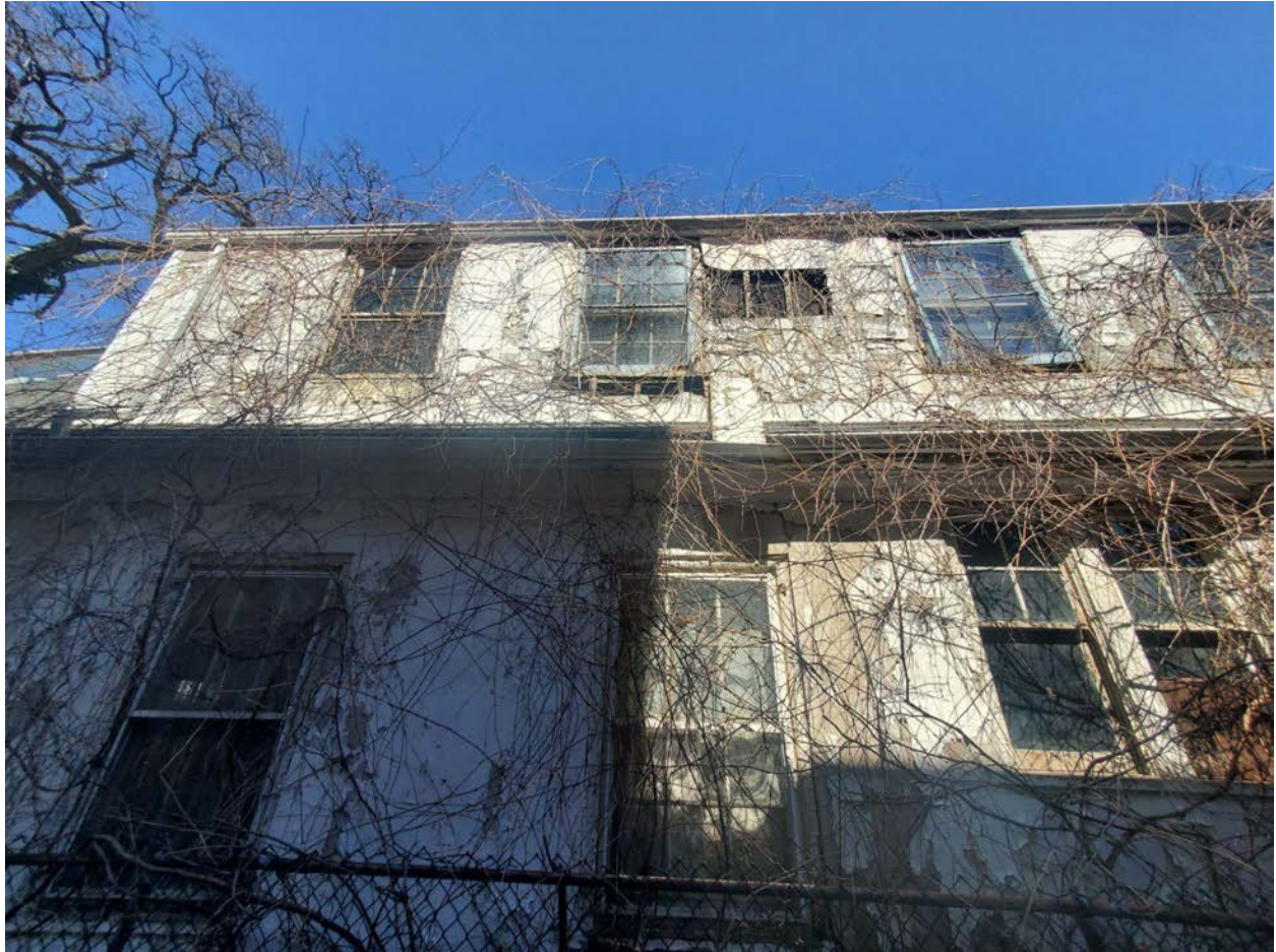
Existing Side (South) Elevation