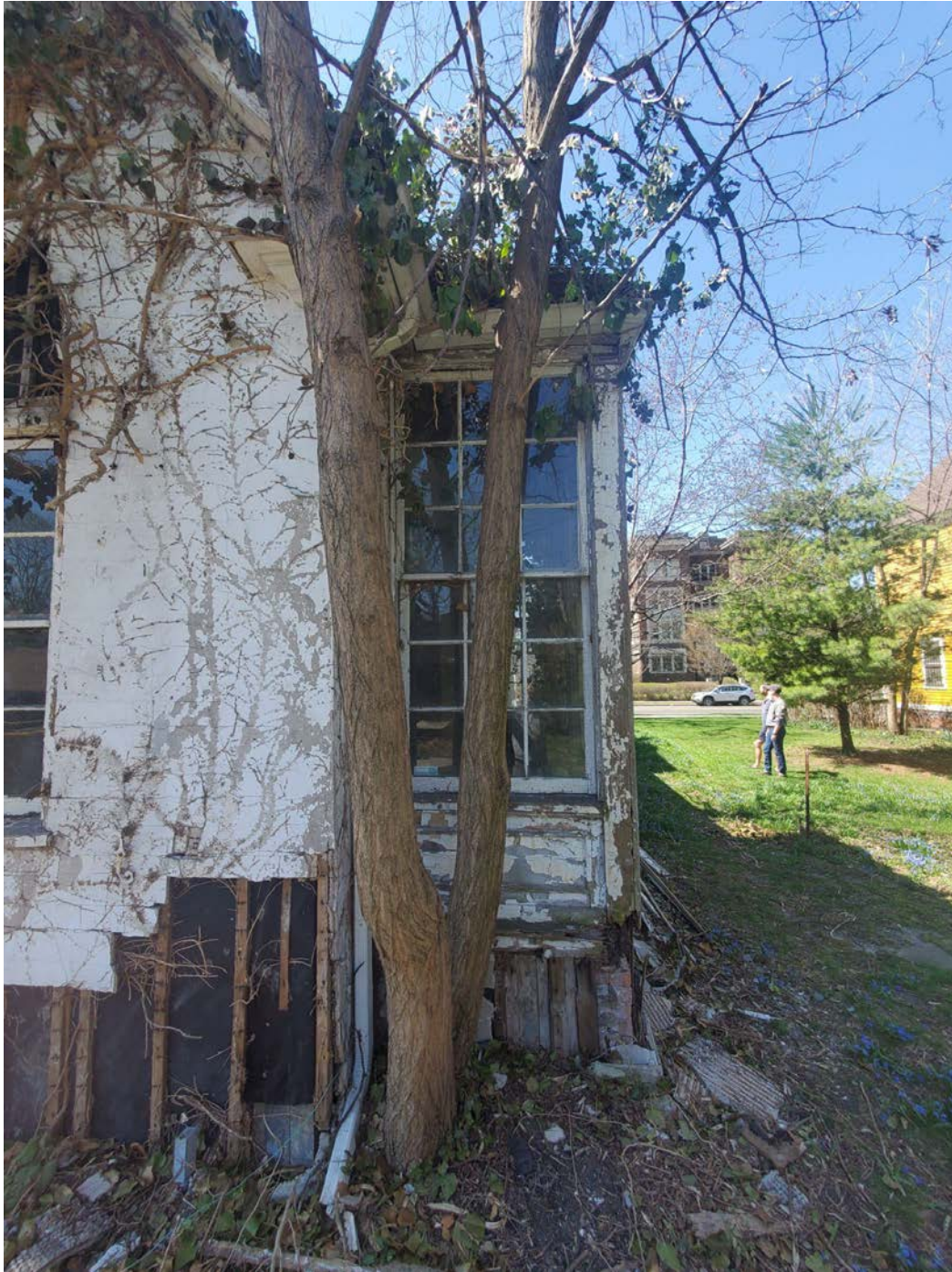
Existing Bay Window Detail