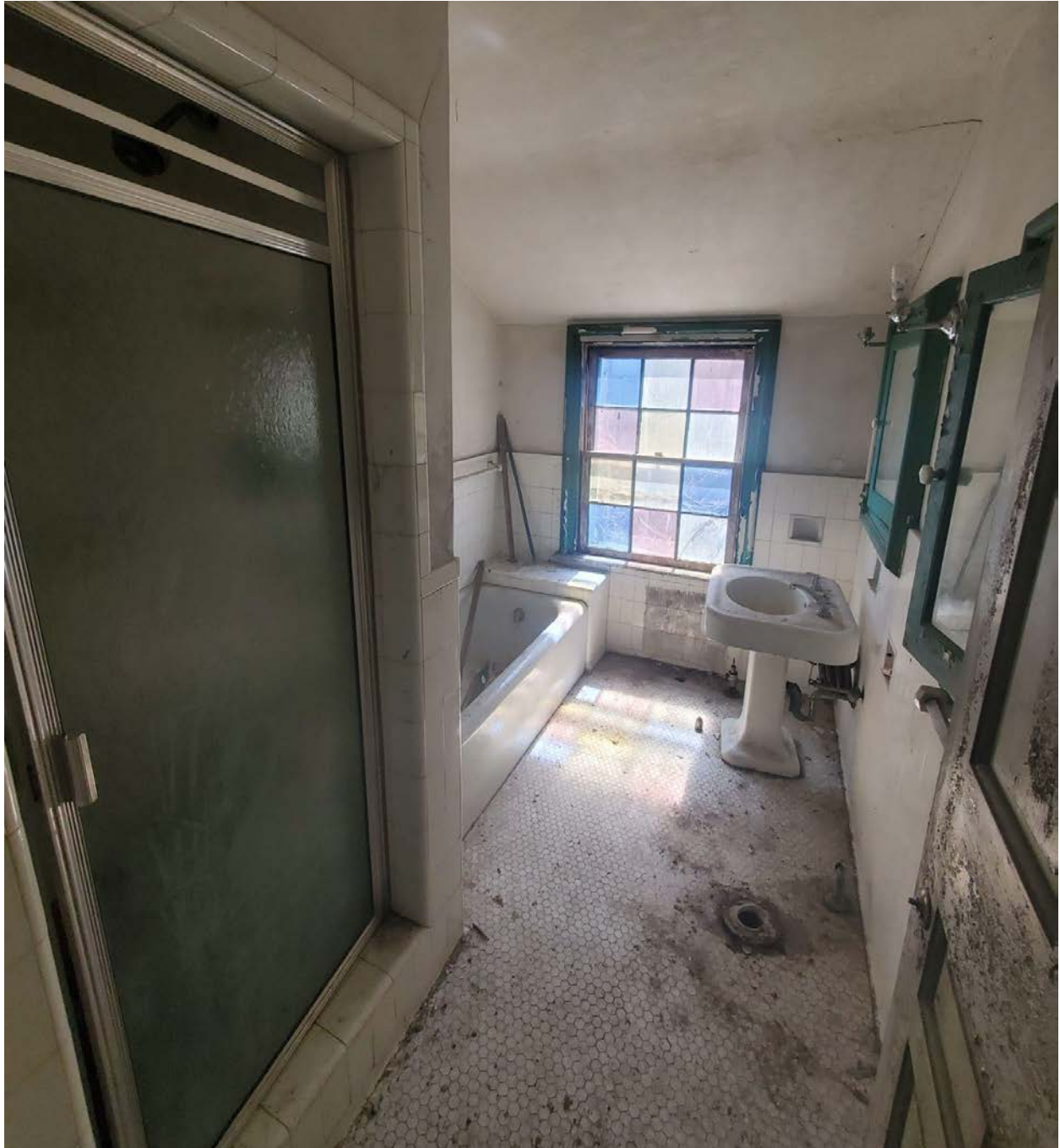
2nd Floor Bathroom