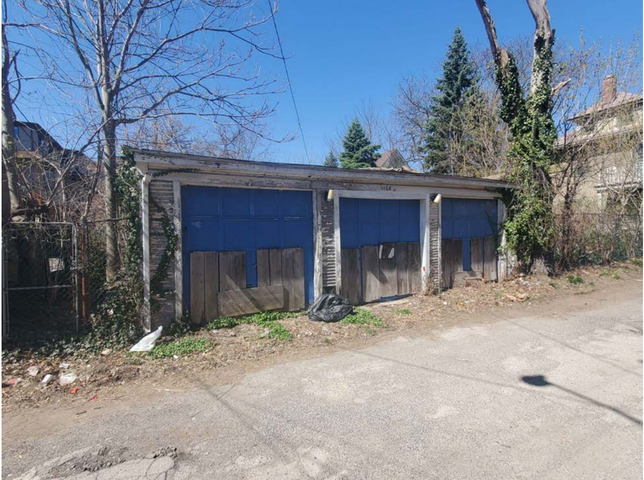
Garage East Elevation