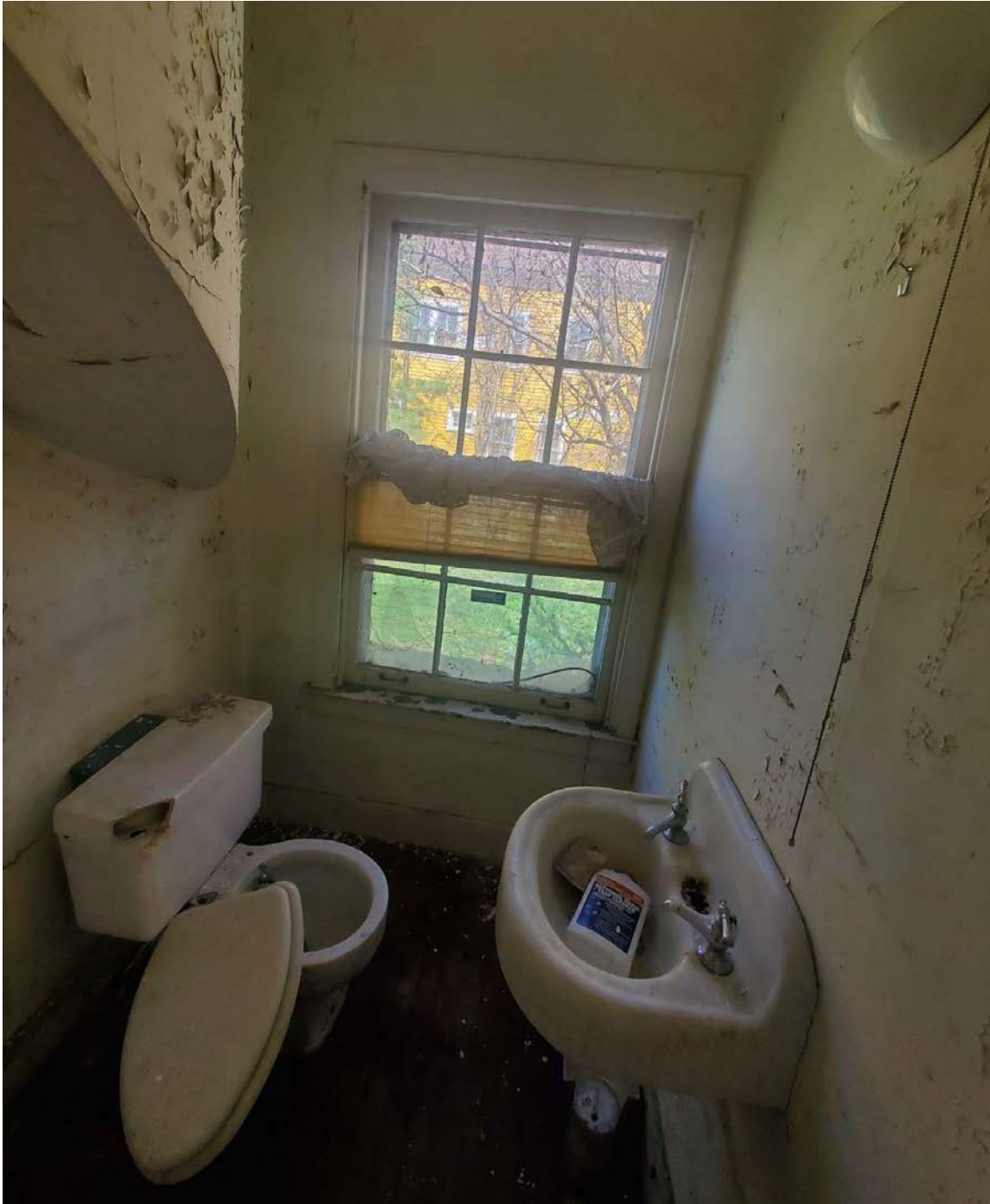
1st Floor Powder Room