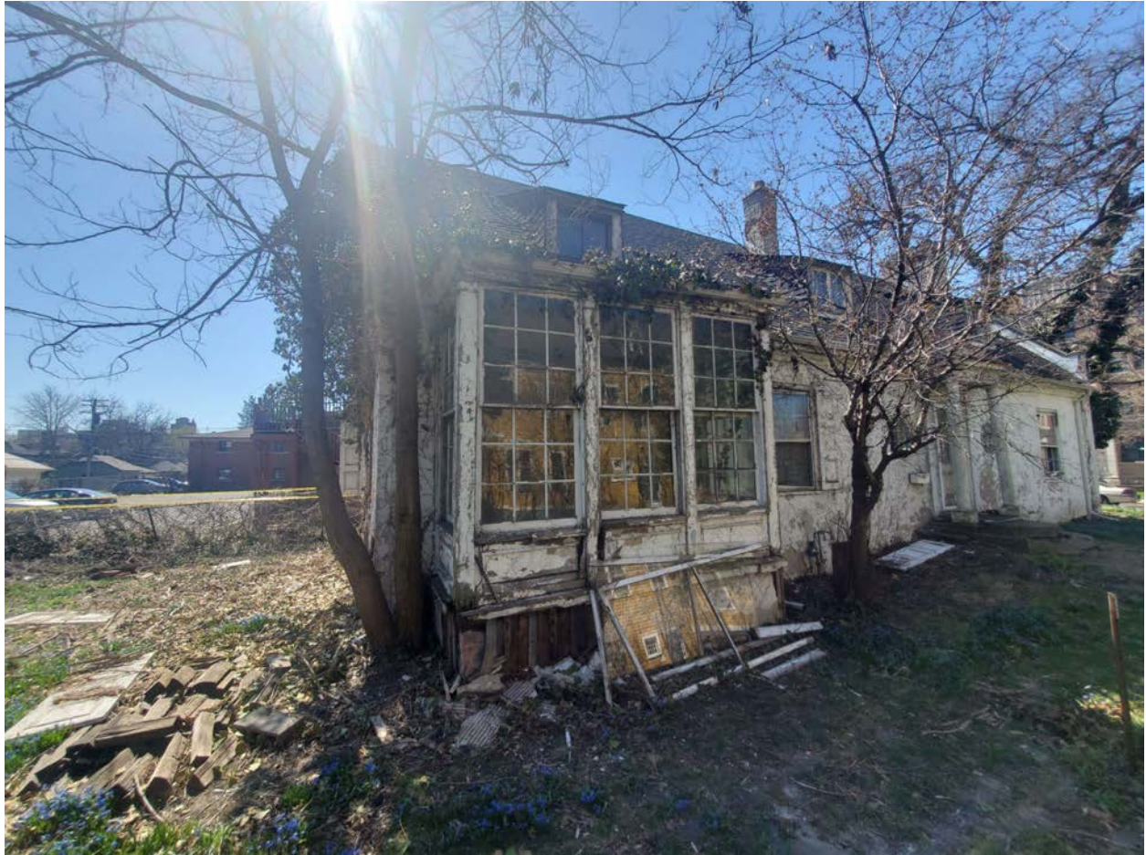
Existing Bay Window Detail