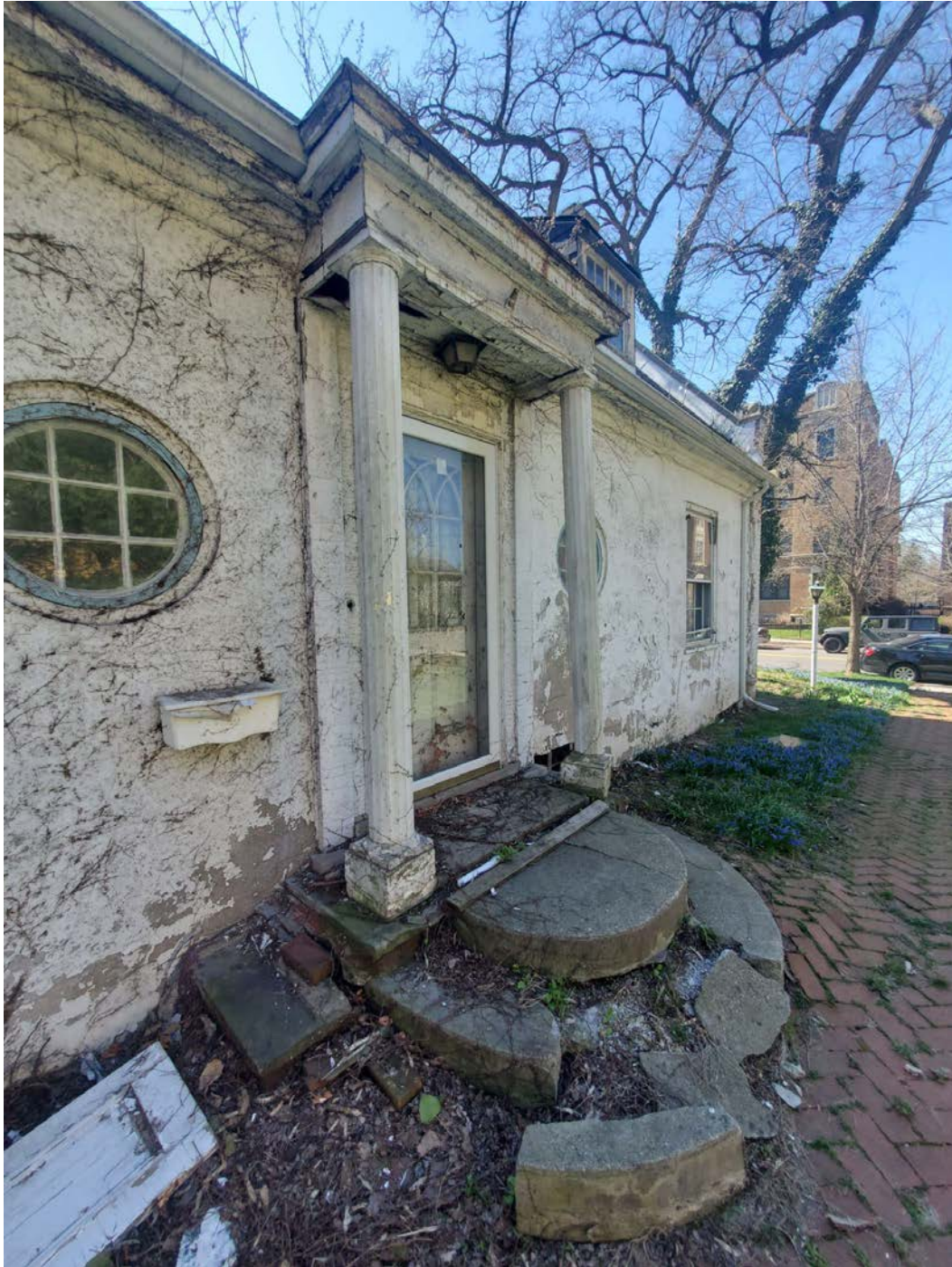
Existing Porch Detail