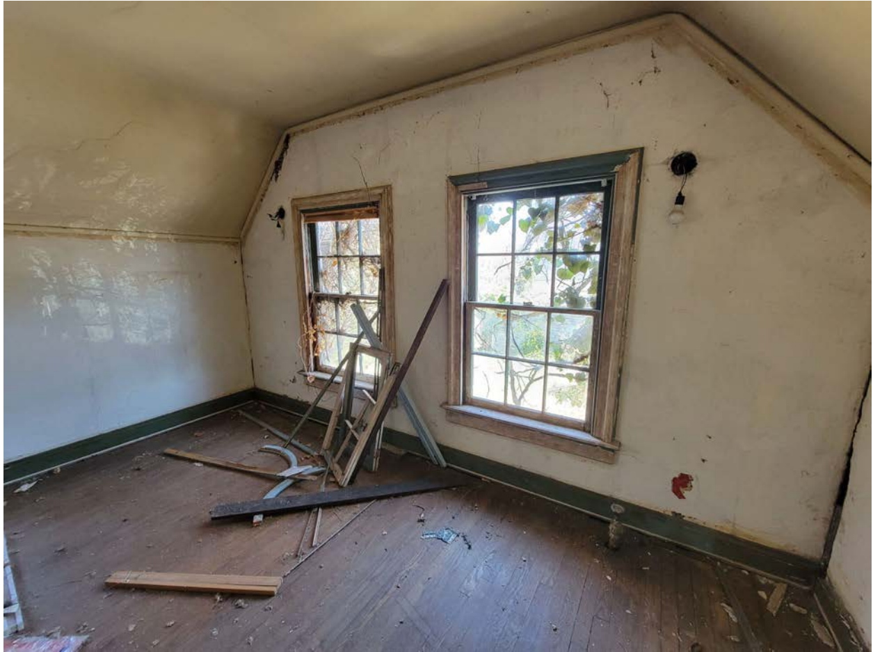
2nd Floor Bedroom 2