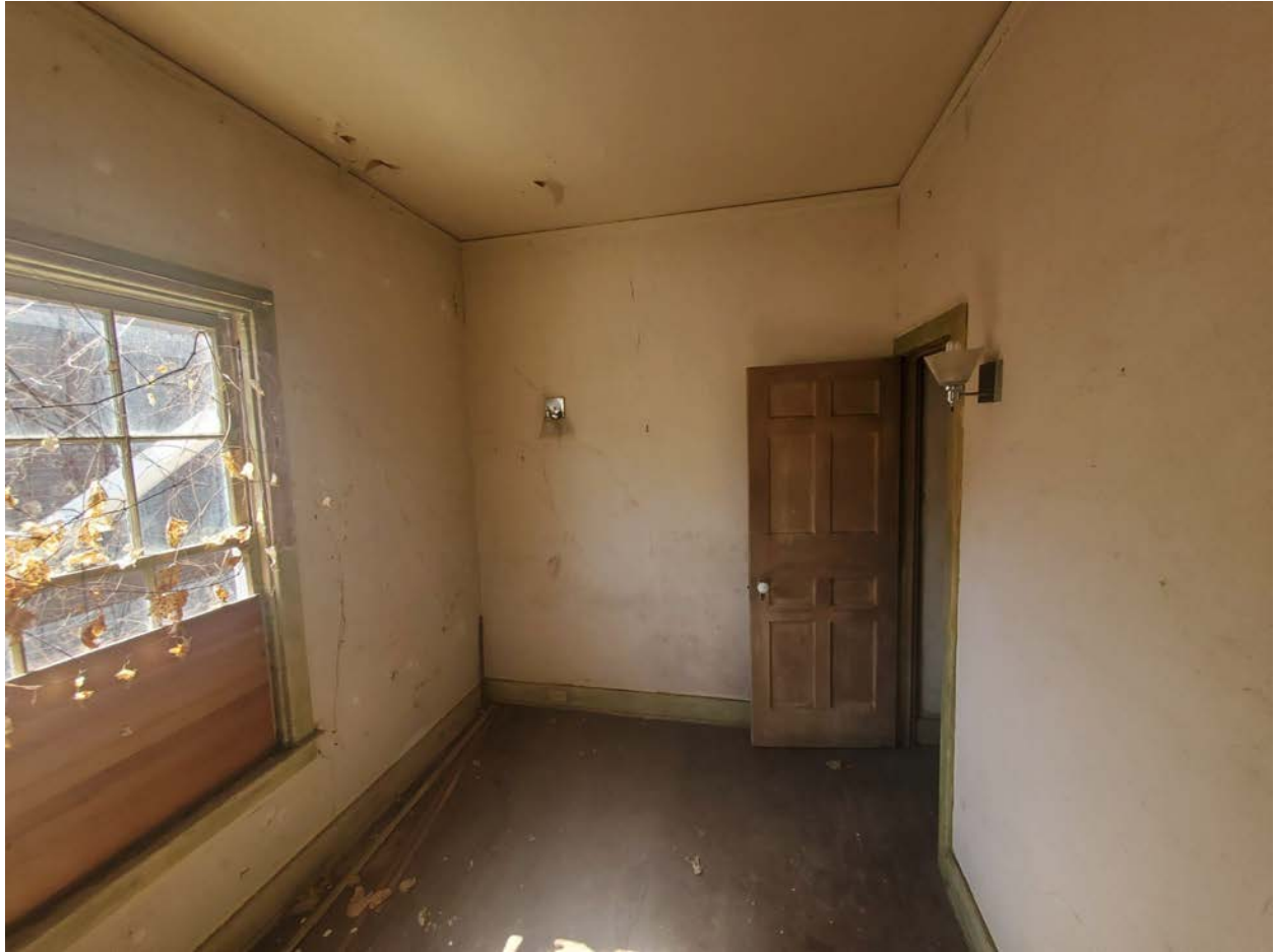
1st Floor Bedroom