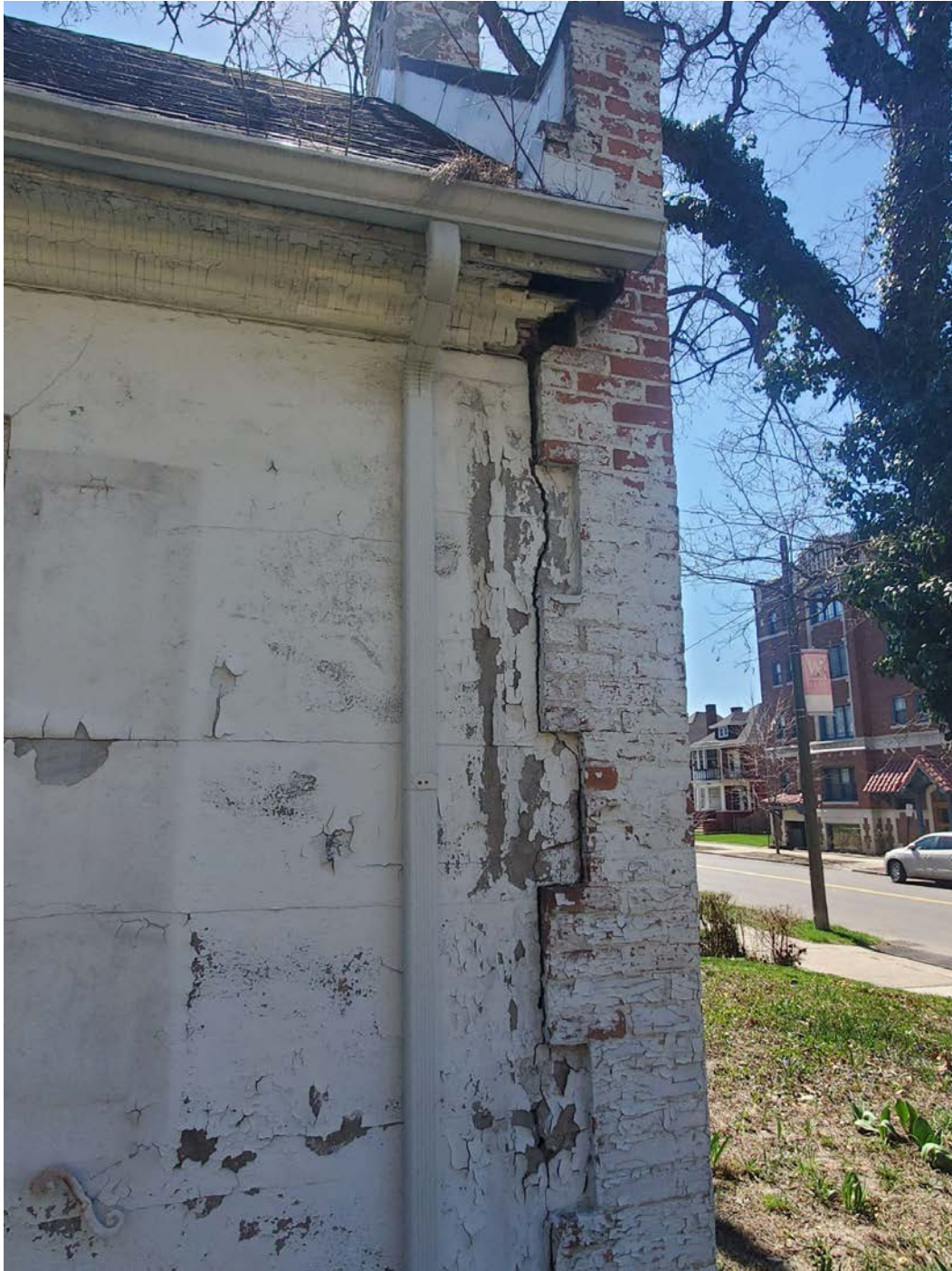
Typical Damage to Facade Detail