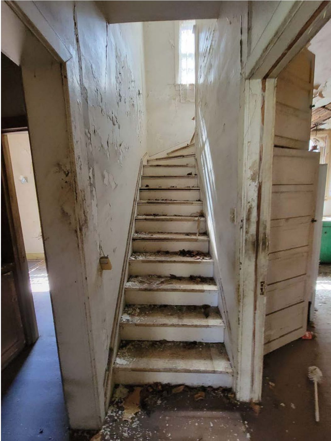
Typical Damage to Stair Detail