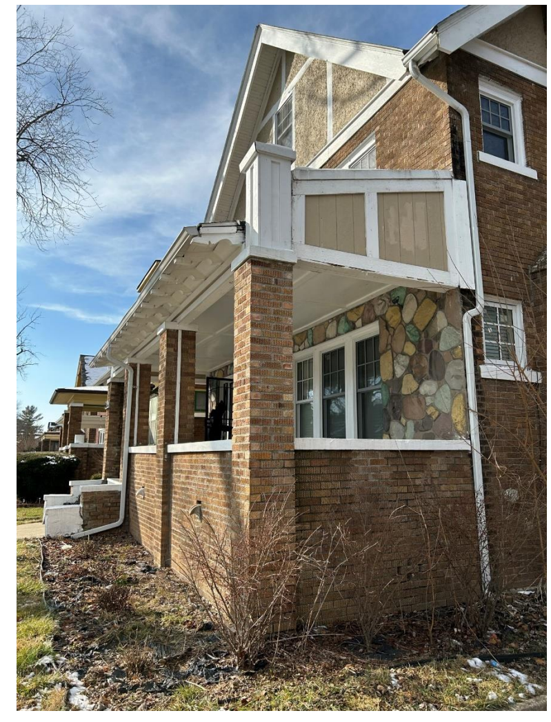
1652 Edison Street, Detroit, Michigan 48206. Front porch oblique taken from southeast corner.