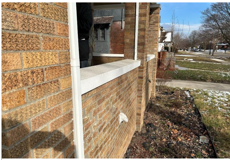
1652 Edison Street, Detroit, Michigan 48206. Front porch masonry brick.