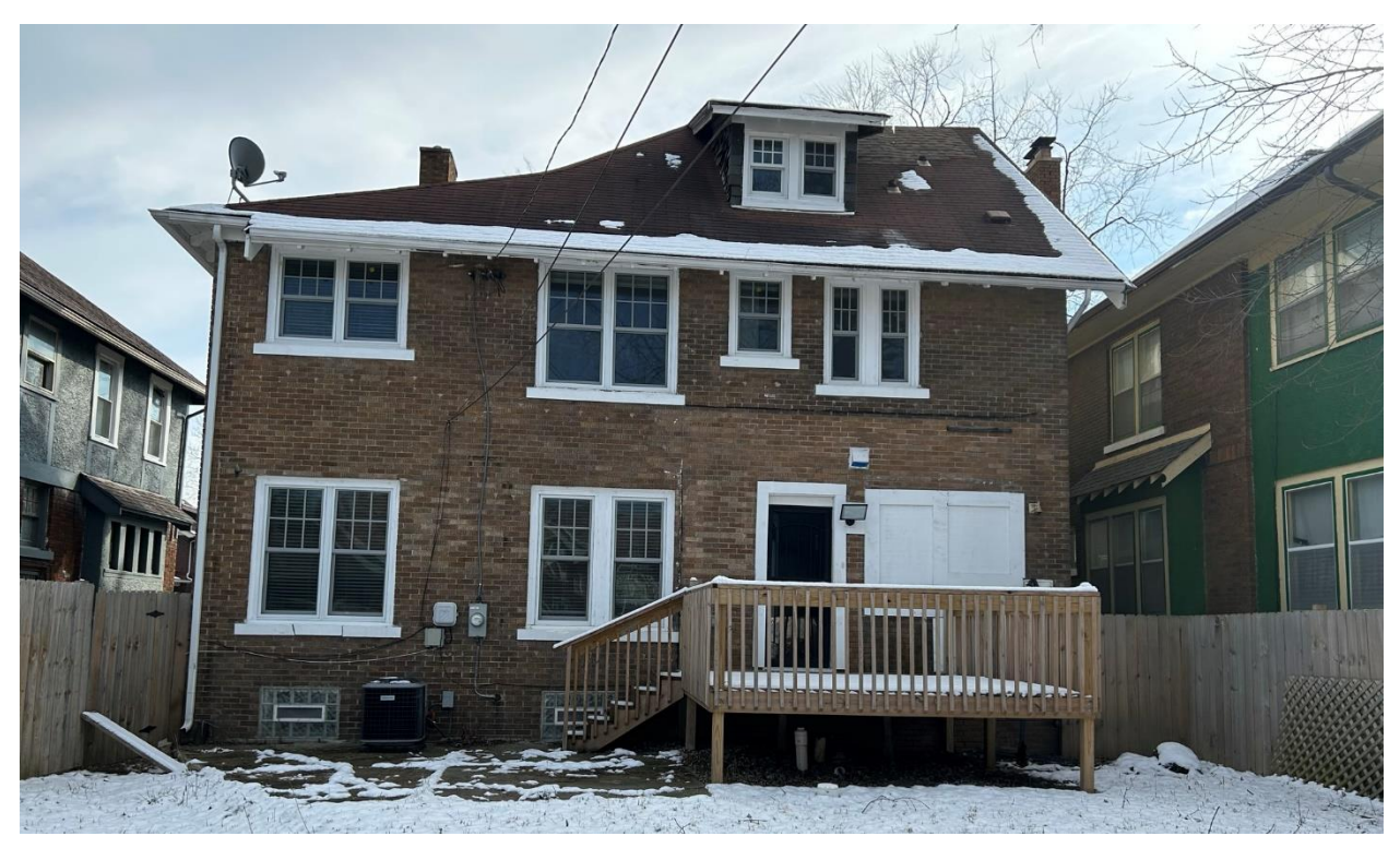
1652 Edison Street, Detroit, Michigan 48206. Rear (north) facade.