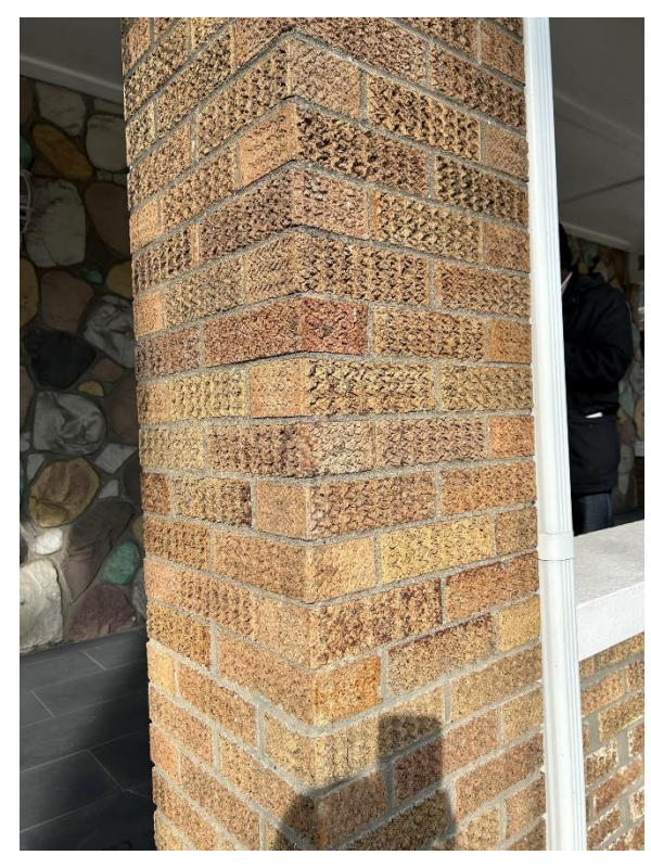
1652 Edison Street, Detroit, Michigan 48206. Front porch brick column.