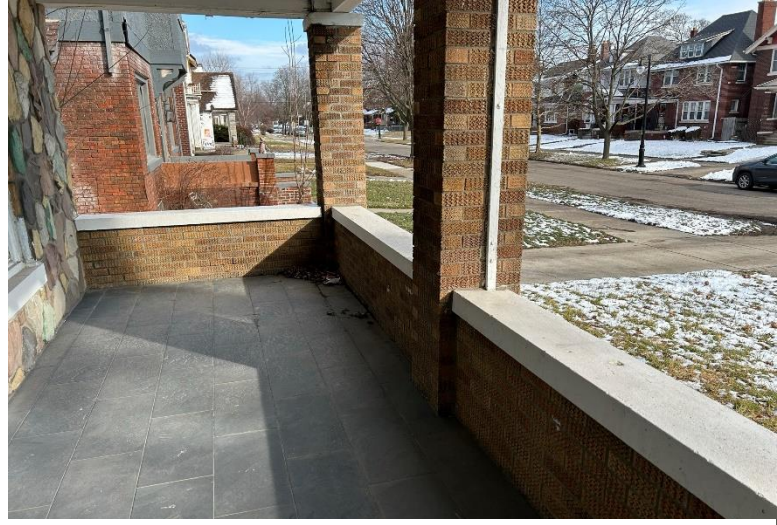
1652 Edison Street, Detroit, Michigan 48206. Front porch floor.