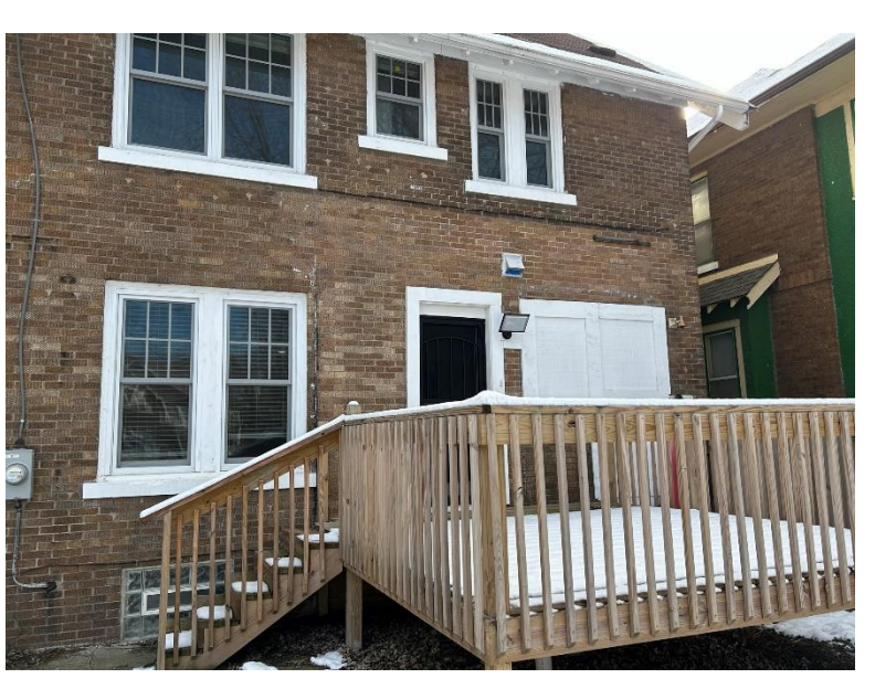
1652 Edison Street, Detroit, Michigan 48206. Rear wood porch and stairs.