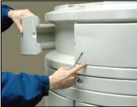
Remove inserts from lower module

... Now features high-density polyethylene molded inserts — the same maintenance-free material as the wells — which add strength and rigidity to withstand adverse freeze/thaw and settling conditions while simplifying the backfilling process.