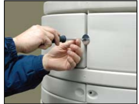
Lock to form a cohesive assembly

Unique "Grip/Step" design features convenient handle and gusseted step to meet emergency egress requirements