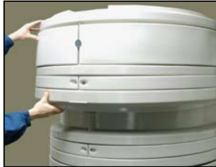
Slide and mate modules together