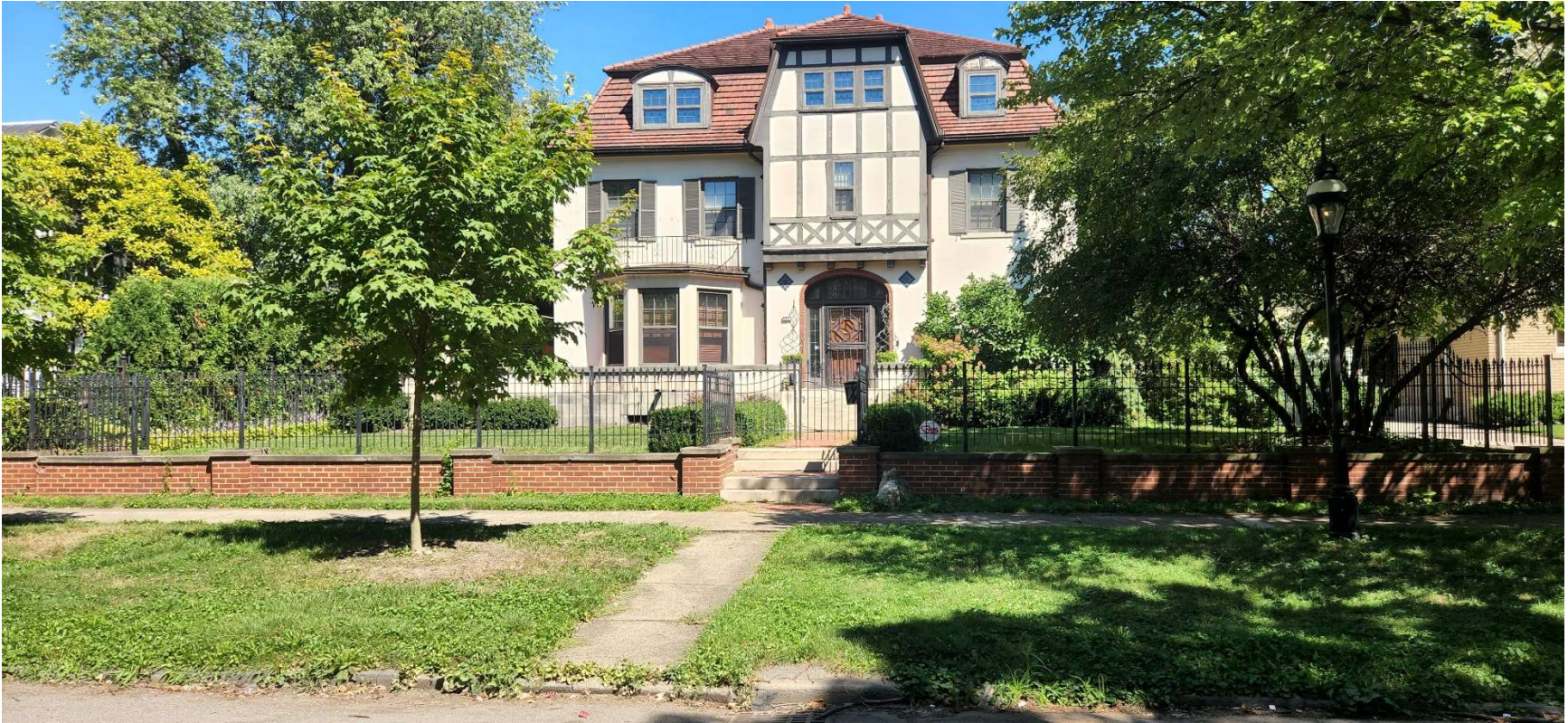
Figure 4 - 1481 Seminole St