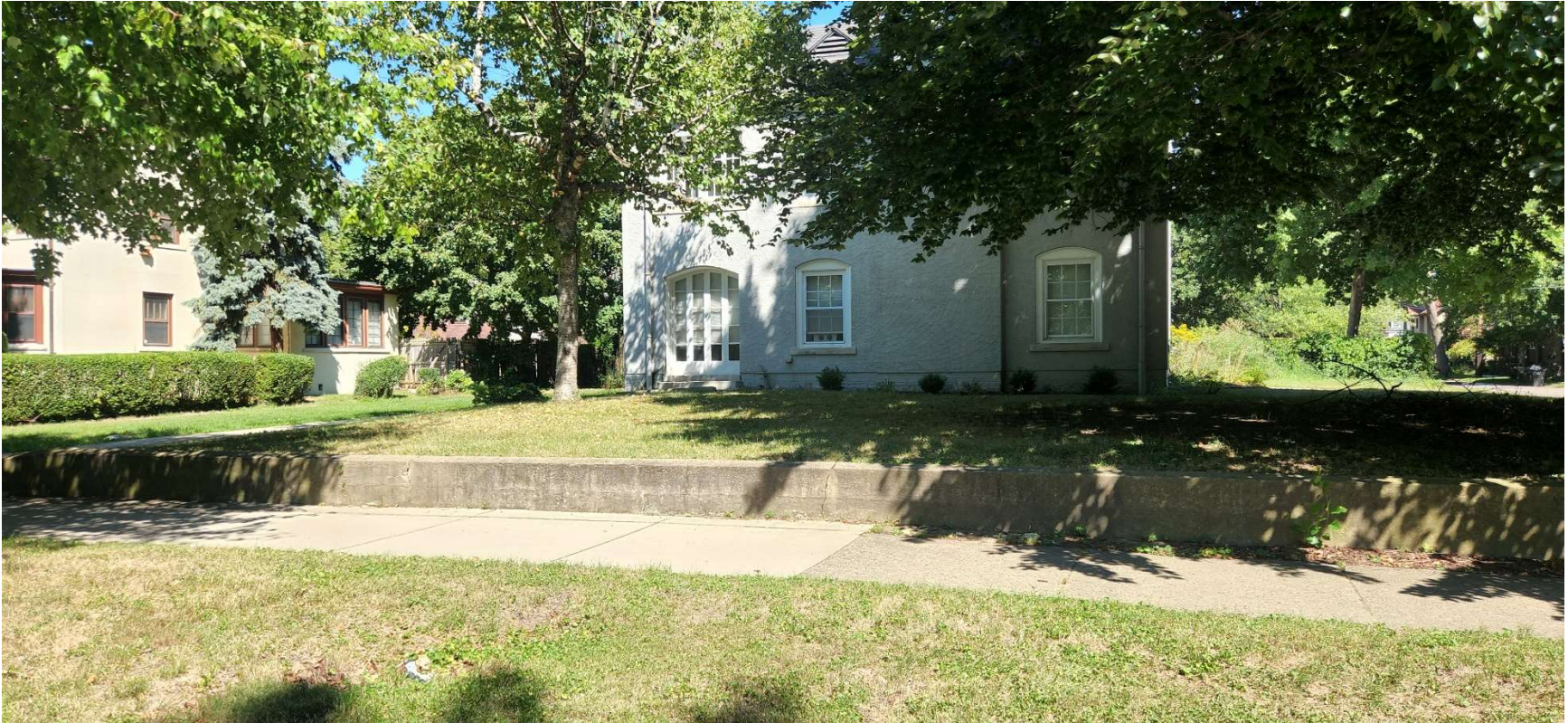
Figure 3 - 1710 Seminole St