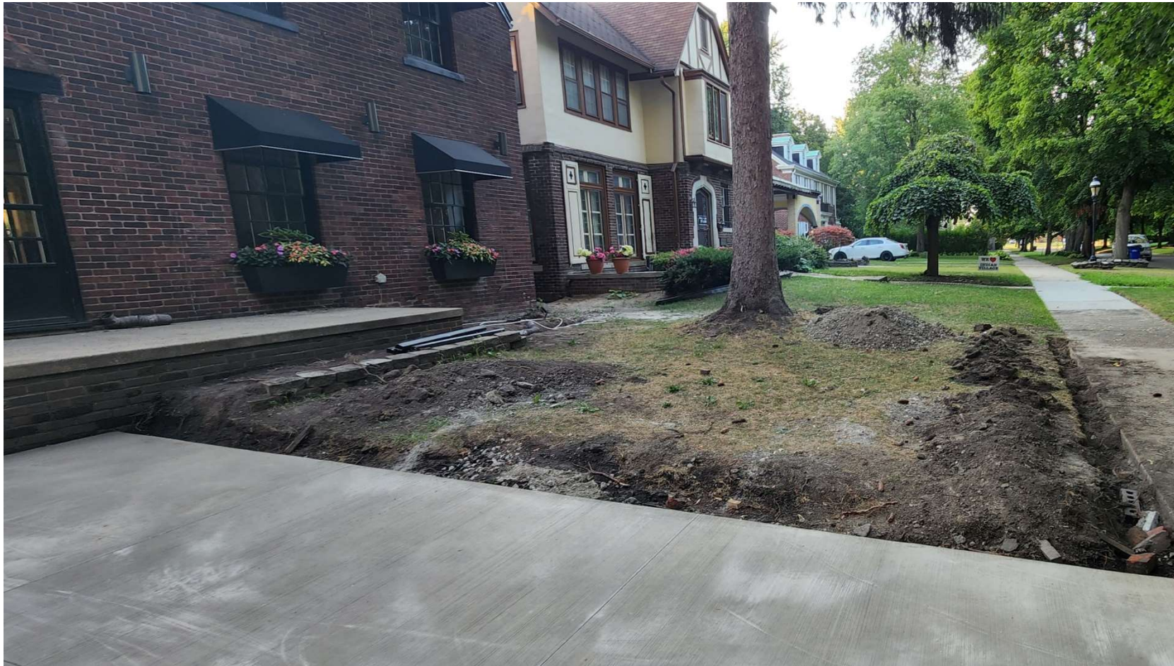
Figure 1 - Front Yard, existing