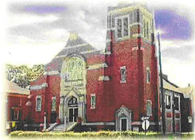
Shalom Fellowship Int'l

Shalom Fellowship International 4001 14th Street Detroit, MI 48208