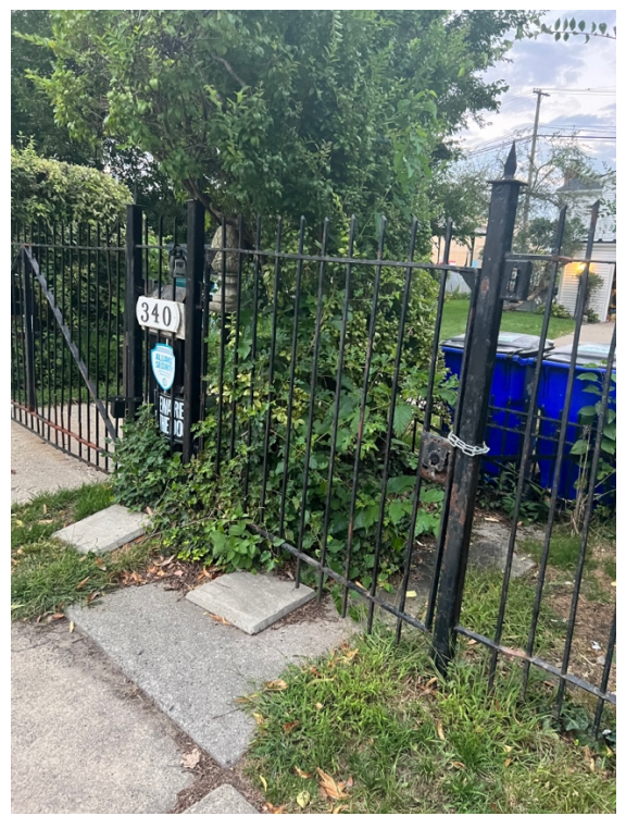
5 foot tall fence next to sidewalk at 340 Parkview Drive

Newly installed 8 foot tall steel fence next to sidewalk at south end of the same block – Great Lakes Water Authority property.