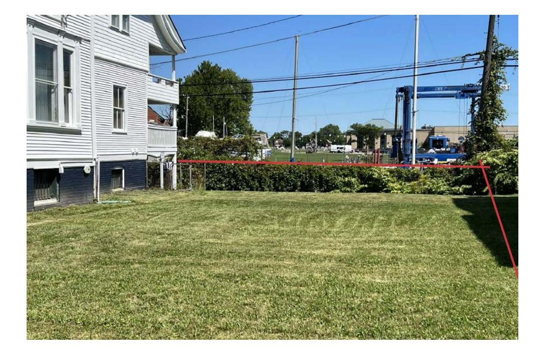
Rear of property