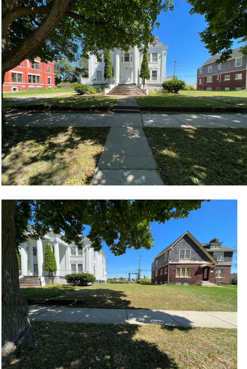
View of west side at street