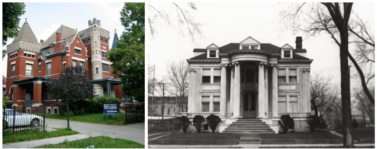
House next door at 530 Parkview with 5 ft fence at edge of sidewalk circa 2010

Detailed photographs of location of proposed work (photographs to show existing condition(s), design, color, & material)