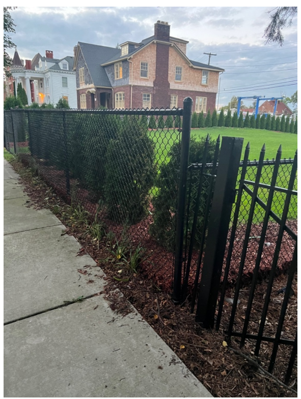
5 foot tall chain link fence installed 2 years ago at 470 Parkview