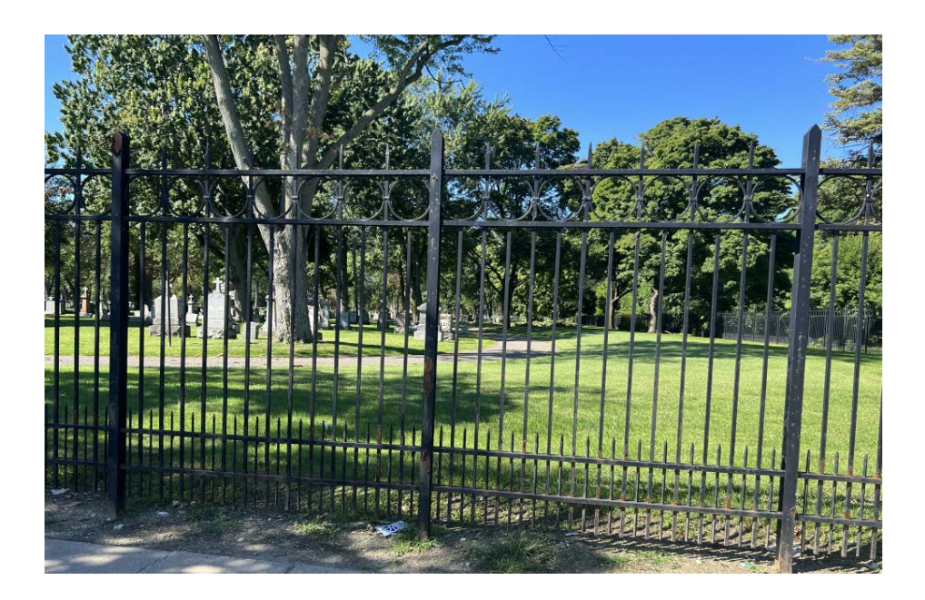
Mt. Elliott Cemetery Fence new fence at 506 Parkview to be similar design and materials custom-fabricated

Brochure/cut sheets for proposed replacement material(s) and/or product(s), as applicable