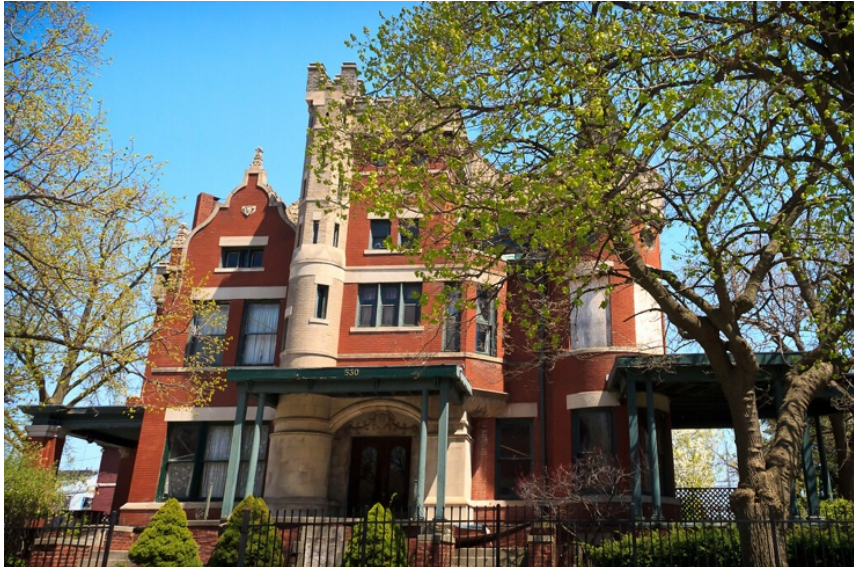
Another view of 2010 fence at 530 Parkview