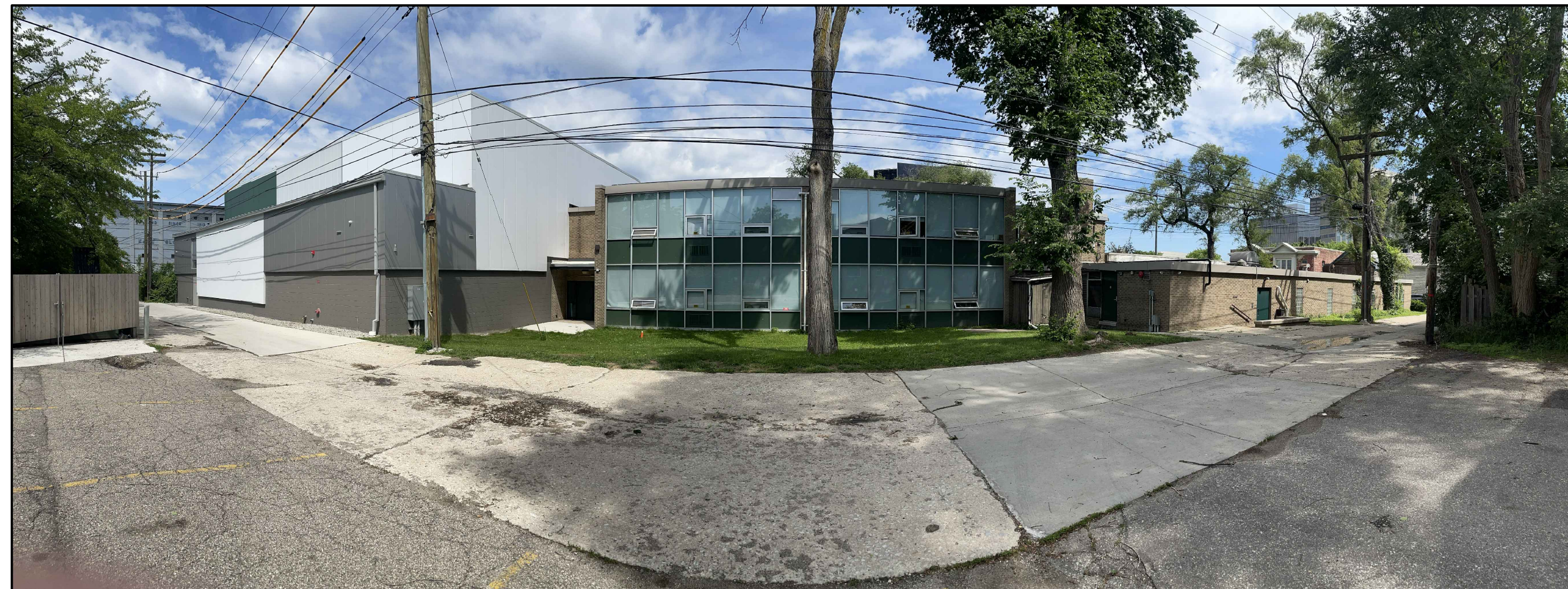
SOUTH ELEVATION South Elevation = 198' L x 11'/20'/24' H (Various Heights) SCALE: NTS