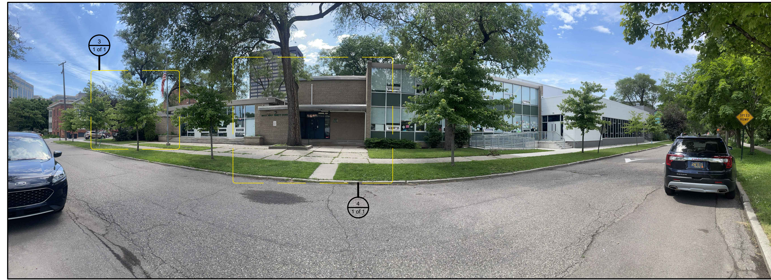
NORTH ELEVATION North Elevation = 198' L x 11'/20'/24' H SCALE: NTS (Various Heights on Building)