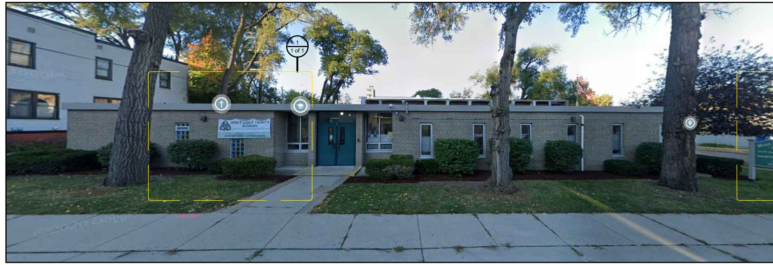
EAST ELEVATION East Elevation = 100' L x 11' H SCALE: NTS