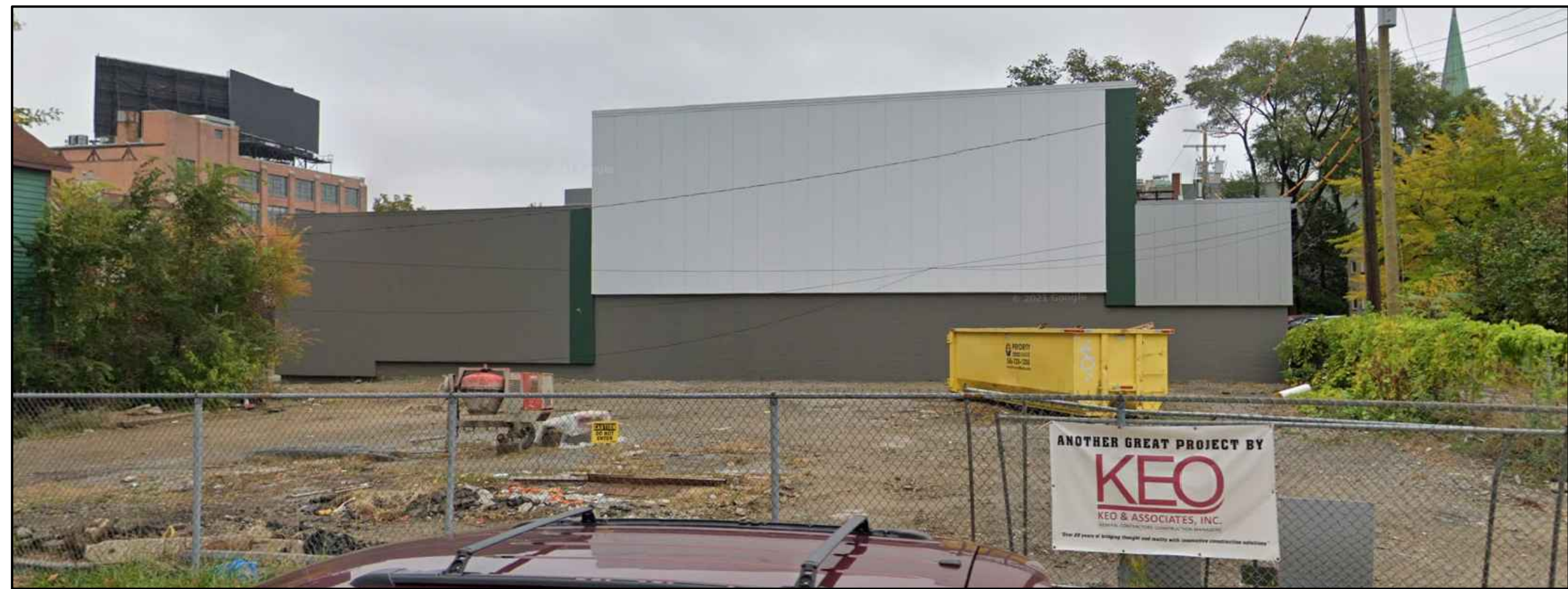
WEST ELEVATION West Elevation = 67' L x 20'/30' H (Various Heights) SCALE: NTS