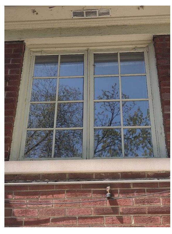
Rotting at frame is allowing moisture into 1st floor ceiling beneath window