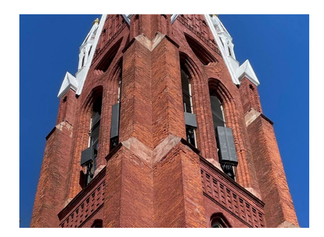
T-Mobile Equipment (Southwest Tower)