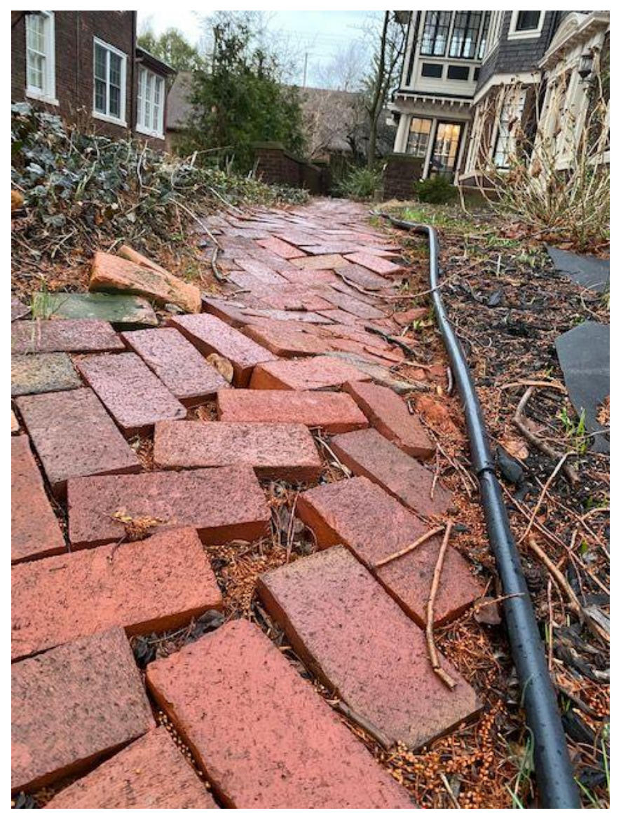
View 2: Showing bricks raised and in disrepair from 100 ft tree roots